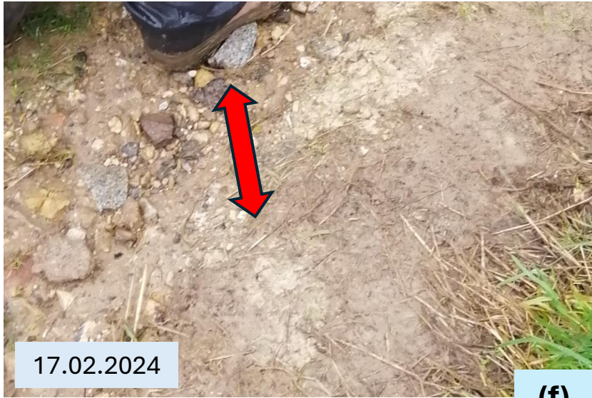
Spot points along path, N-O