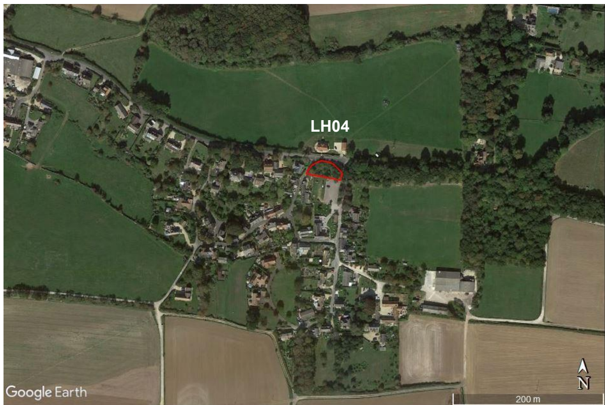
Figure 2-2: Map of site LH04 in Langton Herring.

2.3 Table 2-1 provides a summary of the findings of the site assessment. The final column in the table is a 'traffic light' rating for each site, indicating whether the site is appropriate for allocation. Red indicates the site is not appropriate for allocation through the Neighbourhood Plan due to identified constraints and Green indicates the site does not have any insurmountable constraints to development and is therefore appropriate for allocation. Amber indicates the site is less suitable or there may be issues that would need to be resolved or mitigated.