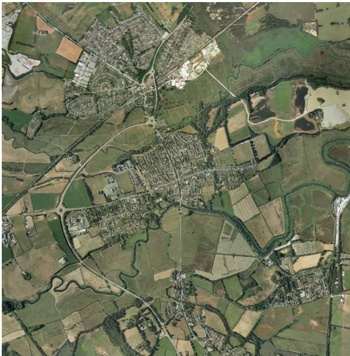
Figure 1: Vertical aerial photographic view of Wareham, 2005.

constrained suburban development. The long narrow historic properties along the main streets have defined a characteristic rhythm to the streetscapes with their predominantly Georgian brick houses built after the 1762 fire. This unity of historic built environment is a major component of the historic character of the town. The survival of many unbroken groups of buildings, with little disruption from modern development, is a major factor that highlights the contribution made by historic elements to Wareham's urban character. The landscape setting of the town on a low ridge between two rivers has constrained suburban development to immediately east and west of the town and encouraged expansion further to the north at Northport. The extensive views from the Town Walls and the Quay across the floodplains and the surrounding landscape is another significant element in the character of the town.