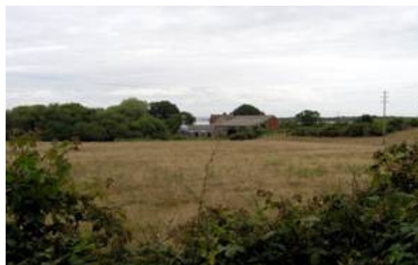
Figure 14: View northeast towards Goathorn Farm.