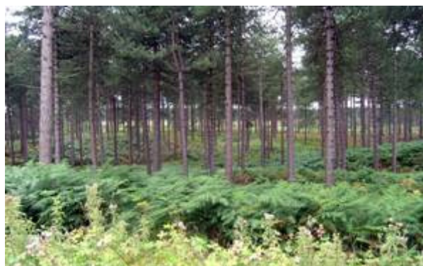
Figure 13: View of forestry plantation, Newton Heath.