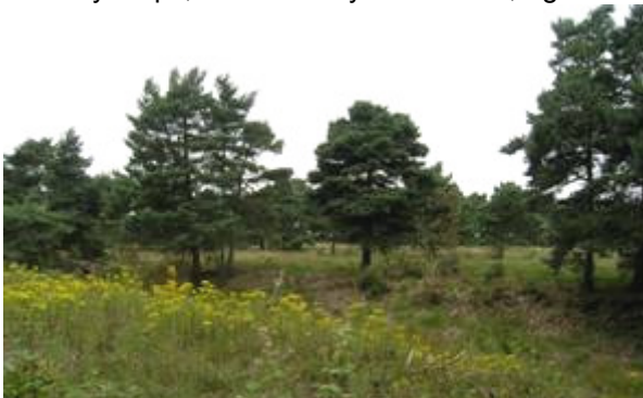
Figure 15: View north towards Goathorn Point.

The settlement pattern consists of dispersed farmsteads enclosed from the heathland, possibly of medieval or early post-medieval date and later forestry plantations. Newton Cottage is set on the edge of a series of irregular enclosures with curvilinear boundaries stretching northwards along the east side of Newton Bay. Further irregular enclosures to the west along the south side of the bay have been amalgamated into larger enclosures. On the west side of Goathorn Point are the remnants of other irregular enclosures which probably belong to a 17 th century settlement here.