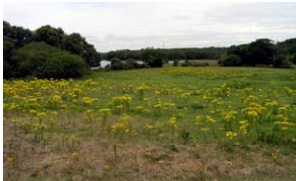
Figure 16: View of enclosed fields on west side of Goathorn Point.