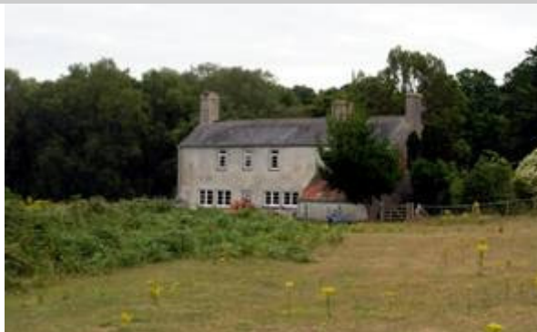
Figure 17: Newton Cottage.