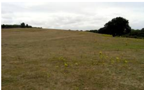
Figure 10: View of area of cropmark enclosures, viewed from east.

A note of caution needs to be injected, for although the location appears suitable, the form of the features recorded is, perhaps, less so. Planned medieval towns were generally laid out on a grid pattern, unless other features, topographical or political, intervened. In the case of Newton, the land is generally level adjacent to the edge of Newton Bay (to the north of the track shown on Figure 9), but the land further south rises up steeply into a series of rounded knolls and hollows. It was this higher ground that contained the small enclosures investigated by excavation. Nevertheless, the topography is not uneven enough to preclude the town being laid out in a grid. In the absence of definite evidence, the identification of the ditches excavated by Cox & Hearne as the settlement of Newton must be considered doubtful. The land to the east of Newton Cottage at the base of the Goathorn peninsula appears rather flatter and less irregular and perhaps is a more likely place in which to lay out a town. But without further close investigation of the landscape of this area, no definite location for the town can be proposed.