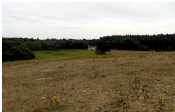
Figure 11: View from area of cropmark enclosure eastwards towards Newton Cottage.