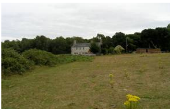
Figure 7: Newton Cottage viewed from the east.