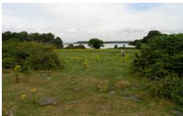
Figure 6: View across Newton Bay from Newton Cottage.

Weighing up the evidence for Newton, it is difficult to avoid the conclusion that in 1286 a few plots of the proposed new town were laid out and occupied. It never succeeded as a town but survived as a farm, with the occupiers supplementing their agricultural income with a profitable sideline in wildfowl.