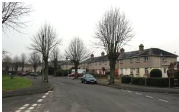
Figure 37: View west along Hardy Crescent, Leigh Park