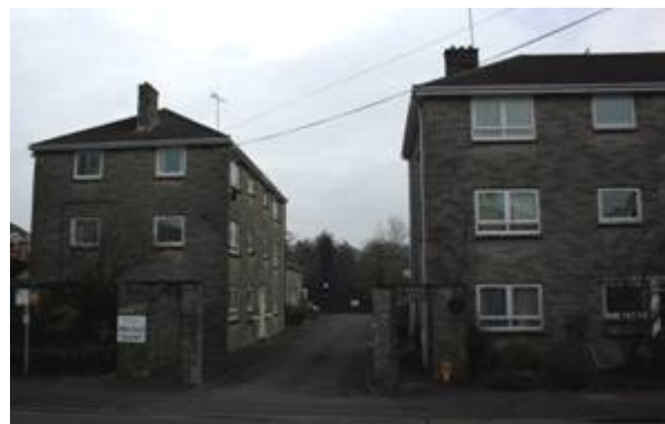
Figure 41: Allen Court, built on the site of the former workhouse