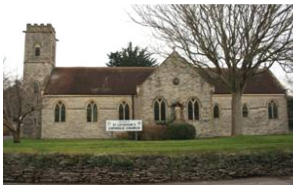
Figure 42: St Catherine's Roman Catholic Church built in 1933

42. North West Wimborne Modern Housing Estates . The development of 20 th century suburban to the north west of Wimborne Minster town centre began during the inter-war period along Redcott's Road, Culverhayes Road and the south end of Blind Lane. These were either pre-existing lanes or linear culs-de-sac with detached houses set back from the street frontage. Piecemeal development along the same lines continued into the post war period along Blind Lane, Stone Lane, Cemetery Road and Netherwood Place. During the later 20 th century small housing es-