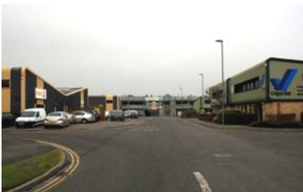
Figure 36: Riverside Park Industrial Estate and Wimborne Market

Prior to the closure of the railway, 20 th century Wimborne Minster remained little changed from that of the late 19 th century. Suburban development had stalled following the Victorian period of expansion. A number of small inter-war housing estates had been constructed at Leigh Park (Figure 37) and Colehill and industry had continued to grow slowly in a piecemeal fashion within the Station area. However, the closure of the railway to passenger traffic in 1964 meant that the A31 along Leigh Road, continuing through the centre of town to Julian's Bridge, became an essential trunk route for both domestic and commercial traffic. This led to considerable congestion within the