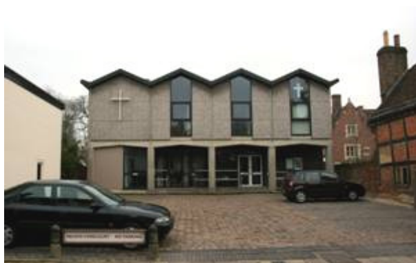
Figure 40: Wimborne Methodist Church, King Street

26. Allendale Community Centre. The workhouse