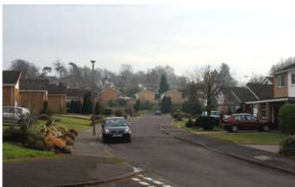
Figure 38: View south east along Lacy Drive, off Allen View Road

Suburban expansion has probably led to the largest change affecting Wimborne Minster and particularly Colehill. As early as 1926 parish councillors had remarked that their rural parish was becoming increasingly urban. It was in the 1960's that large modern housing estates were first developed, at the former Leigh Vineries and Highland Road, as well as further a field at Middlehill Road (outside the study area to the east). During the 1970's and 1980's the large areas around Rowlands and the former water works at Allen View Road were developed, completing a broad swathe of modern and Victorian suburban housing east of the River Allen (Figure 38). This expansion to some extent relieved the development pressure within the old town, allowing a more piecemeal development on a scale more in keeping with that of the historic town and along pre-existing streets. The only extensive modern housing estates to the west of the River Allen lie outside the limits of the Saxon and medieval town to the north west. Thus the town centre retains a great deal of historic character. The Minster Church still dominates the skyline Georgian town houses line many of the central streets and extensive green spaces survive along the River's Allen and Stour.