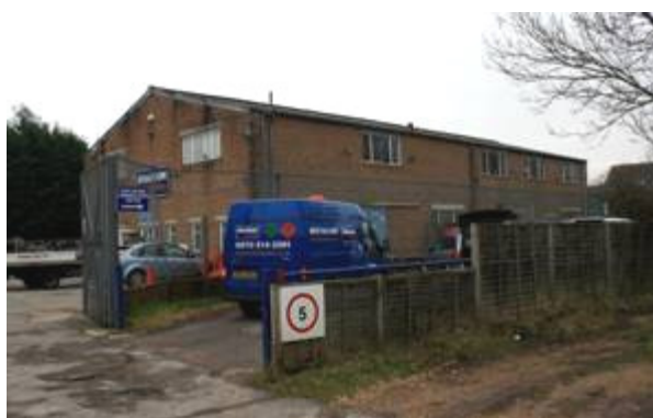
Figure 43: Brandon Tool Hire, New Borough Road, originally an egg packing station

47. Town Green . Wimborne Cricket Club moved to a site on the former Town Green, known as Hanham's after the owners of the site, around 1860. The White Pavilion was built in 1913. Planning permission for a supermarket, covering 60% of the site, was granted in 2008 and development