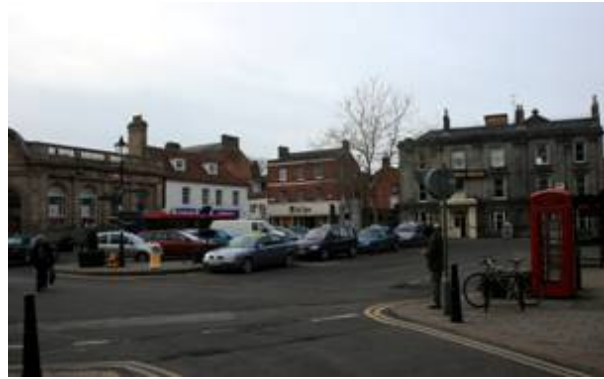
Figure 9: View SW across The Square. Recent excavations have shown that the east end of the chancel of St Peter's Chapel lay approximately in the position of the cycle racks in left centre of the photograph.

2. The Monastery. A nunnery was established by King Ine at Wimborne Minster before AD 705, with his sister Cuthberga as the first Abbess. Shortly afterwards the church was made a double monastery with separate houses of monks and nuns kept strictly apart. This early monastery appears to have been destroyed through Viking raids in the 10 th or early 11 th century and was re-founded by Edward the Confessor as a house of secular Canons. The site of a Saxon church is thought to underlie the current Minster church, as indicated by the discovery of a tessellated floor beneath the current church floor (Woodward 1983, 57). Fragments of the early 11 th century church, probably the original house of secular canons, survive within the current building. The extent of the monastic precinct remains unknown, although a possible