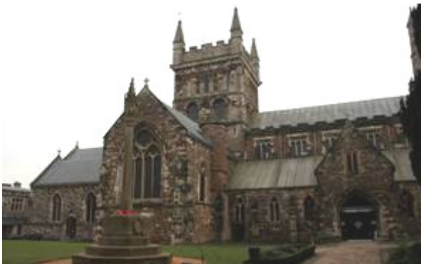
Figure 6: The church of St Cuthberga, showing the Saxon circular turret in the north transept.

Wimborne Minster was not recorded as one of the four Dorset boroughs at the time of Domesday. The tenure of the estate was spread across several holdings, although the main manor was held by King Edward in 1066 and passed to William following the Norman Conquest. This manor paid one night's revenue (together with three other manors at Shapwick, Moor Crichel and Wimborne St Giles). This large estate encompassed the whole of the lower Allen Valley and the north bank of the river Stour between Badbury and Hampreston. It was predominately a pastoral landscape and relatively sparsely populated with 63 villagers, 68 smallholders and 7 cottagers spread across