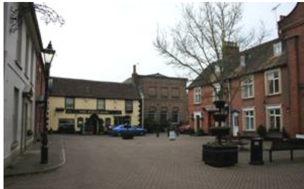
Figure 10: View west across the Corn Market, possible site of a late Saxon chapel of St Mary.

circuit can be suggested from excavated evidence and elements that may have become fossilised in the modern townscape (Figure 8). An excavation between the Minster Church and The Corn Market during 1979 revealed evidence for a large ditch with internal bank and stone revetment running approximately E-W on a line between the church and the graveyard on its north side. The ditch had been cleaned out and then backfilled during the 17 th century, which suggests a significant boundary, prior to the 17 th century, immediately north of the church (Woodward 1983, 61).