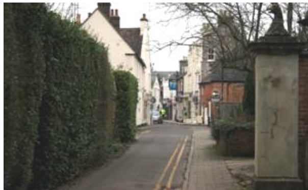
Figure 7: Looking north along the line of Dean's Court Lane and High Street.