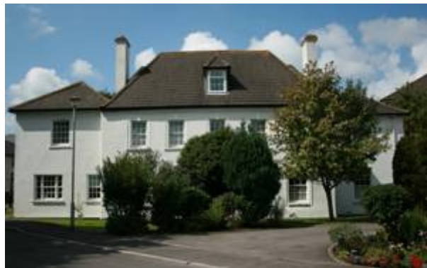
Figure 23: Newbury House, Newbury.