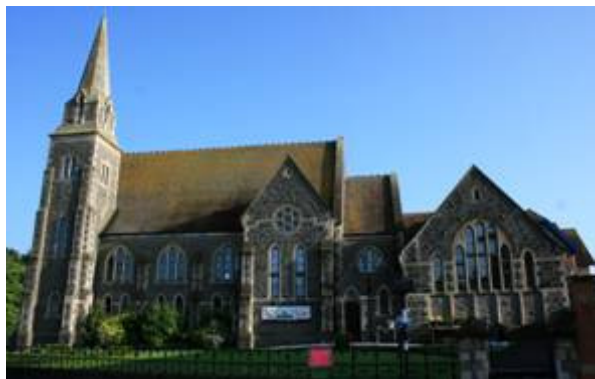
Figure 25: View of the Wesleyan Church, High Street, Newbury.

27. Lodden Meads Housing Estate . A new housing estate was established during the inter-war period on the east side of New Road, opposite the Brickworks. These houses at Addison Terrace were the precursor to a modern estate constructed during the late 20 th century.