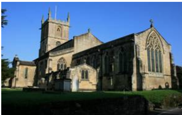
Figure 22: View of St Mary's Church and raised churchyard.

The establishment of the Grammar School on