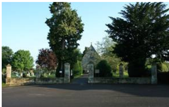
Figure 28: Gillingham Cemetery, Cemetery Road.