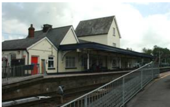
Figure 20: Gillingham Station.

Civic improvements also typified the later 19 th and early 20 th centuries. Gillingham Town Council was formed in 1895 and an organised fire-fighting force was established in the same year. In the same year it was agreed that a fire station should be built on land adjoining the grammar school. The station was completed in 1897 at a cost of £161 (Anon 1992). In 1873 the Free School was re-built on its present site and reconstituted as a Grammar School in 1876. Girls were admitted in 1906 in a sepa-