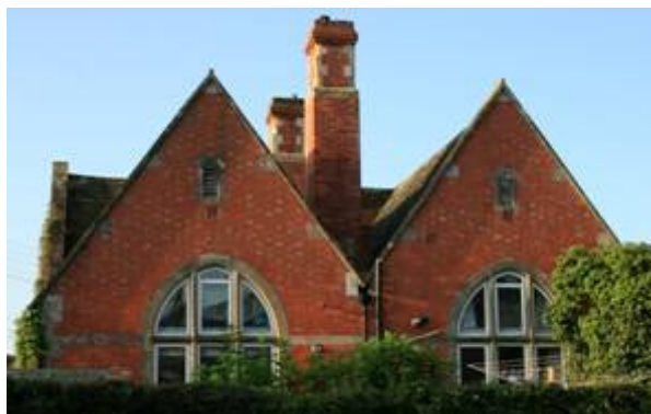
Figure 26: The Old School House, Wyke Road, Wyke.