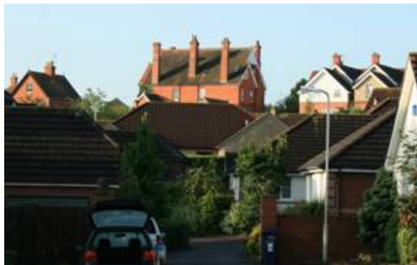
Figure 21: Rear view of late 19 th century suburban villas at Cold Harbour, Wyke Road.