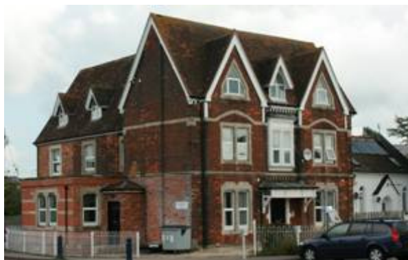
Figure 27: London House, Station Road. Site of the former cattle market.