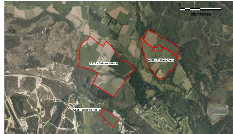
AS28 - Gallows Hill, Puddletown Road - Aerial view