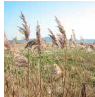
Reeds at River Frome