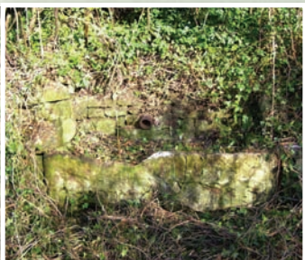
Stone horse trough

A tramway from King Barrow Quarries also linked with the Merchants' railway. The gully, with some impressive dry stone walls, has been opened up to make a pathway into King Barrow, a Dorset Wildlife Trust Reserve. Local volunteers, with the assistance of the Ministry of Defence, helped to clear vast quantities of rubbish and scrub from the route. Under the bridge, the original tramway surface has been revealed. The Merchants' railway finally closed in 1939.