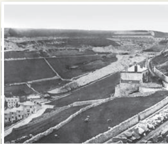
Reshaping of the landscape

New roads and bridges were built and a vast ditch created around the bomb-proof barracks. In 1949, the Citadel became and remains a prison hidden behind the hillside.