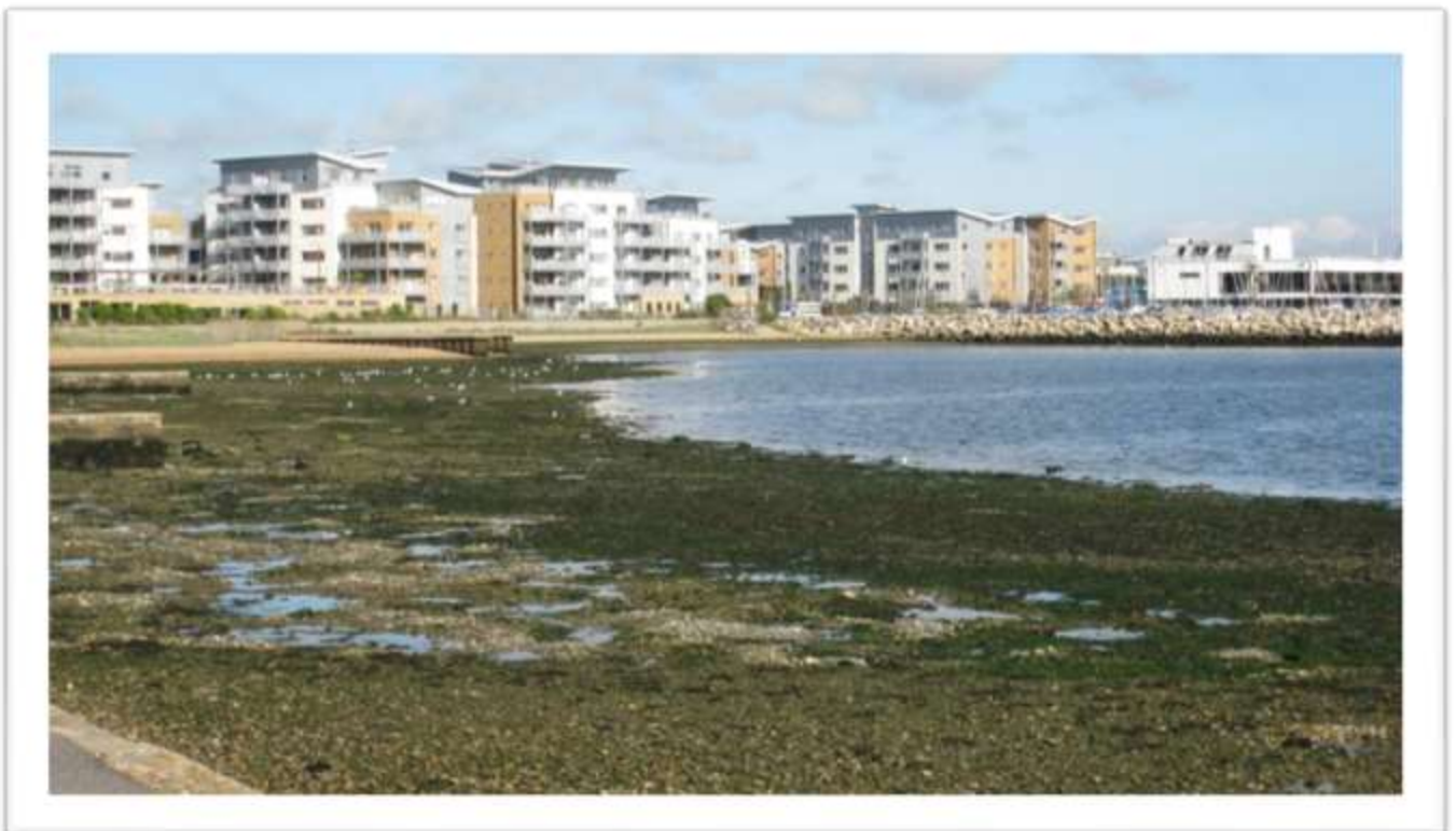
Figure 1: Algal mats on foreshore at Hamworthy, Poole