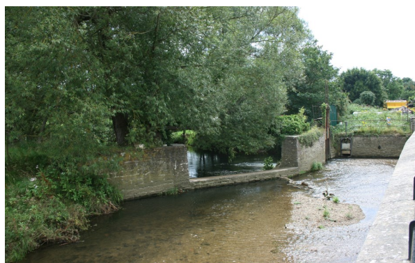
Figure 184: Sluices in the river Asker.