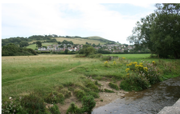
Figure 183: View across the Asker floodplain towards Bothenhampton.

This character area does not form part of the streetscape but is an important green space on the east side of Bridport.