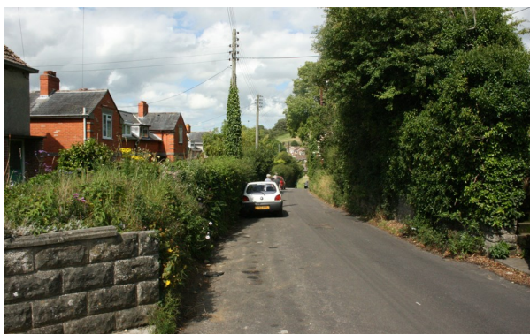
Figure 171: View down Crock Lane, Bothenhampton.

Figure 170 shows the present day historic urban character types. This area is dominated by Modern Housing Estates with smaller areas of Inter-war Suburban Estates, Suburban Villas and Modern Infill. There is a small area of Historic Rural Settlement at Wanderwell Farm.