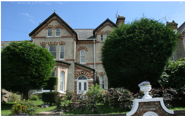
Figure 172: 13-15 Crock Lane, Bothenhampton.

The key buildings are Nos. 1-3 Crock Lane, Nos. 13-15 Crock Lane, Nos. 17-33 Crock Lane, Nordons, and Wanderwell Farm.