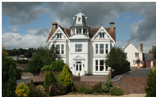
Figure 173: Nordons, 51 Crock Lane, Bothenhampton.