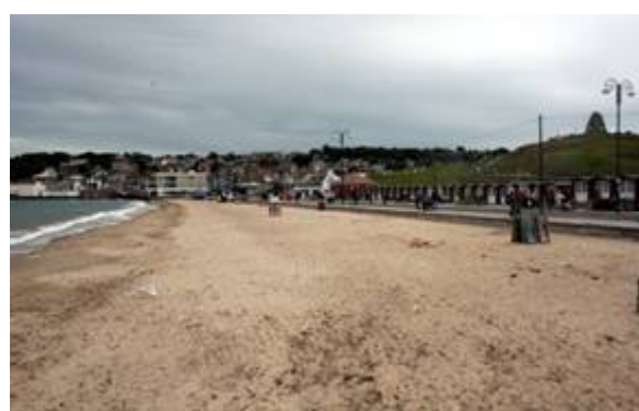
Figure 88: View along beach towards the Mowlem, with Recreation Ground on the right.