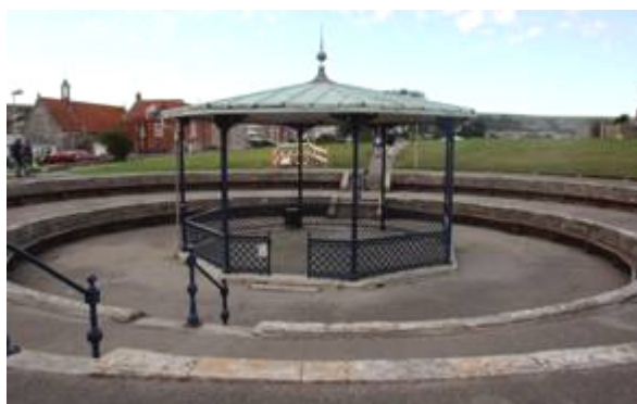
Figure 92: Recreation Ground bandstand.