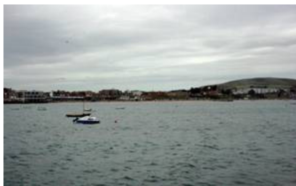
Figure 87: View of seafront from pier.