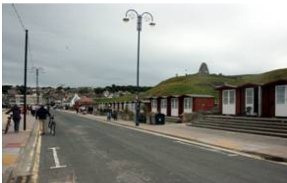
Figure 93: Beach huts along Shore Road.