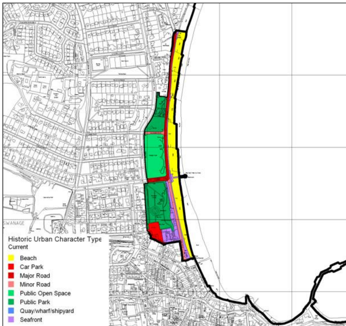
Figure 86: Map of Historic Urban Character Area 5, showing current historic urban character type.