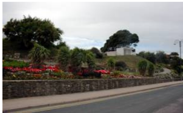
Figure 90: Sandpit Gardens with WW2 gun emplacement reused as public shelter.