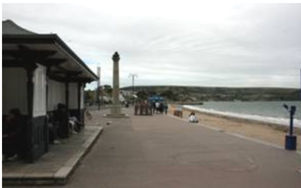
Figure 89: Seafront with Edwardian shelter and Alfred Monument.

The area is characterised by its open space, with good views of the sweeping sandy beach and bay, with the municipal planting along the recreation ground and Sandpit Field forming a backdrop behind the beach, screening parts of the suburban development behind.