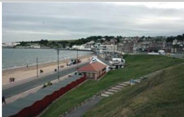
Figure 91: The White House and other buildings along Shore Road, viewed from the Recreation Ground.

Alfred Monument; seaside shelters, The White House, Bandstand, gun emplacement in Sandpit Field.