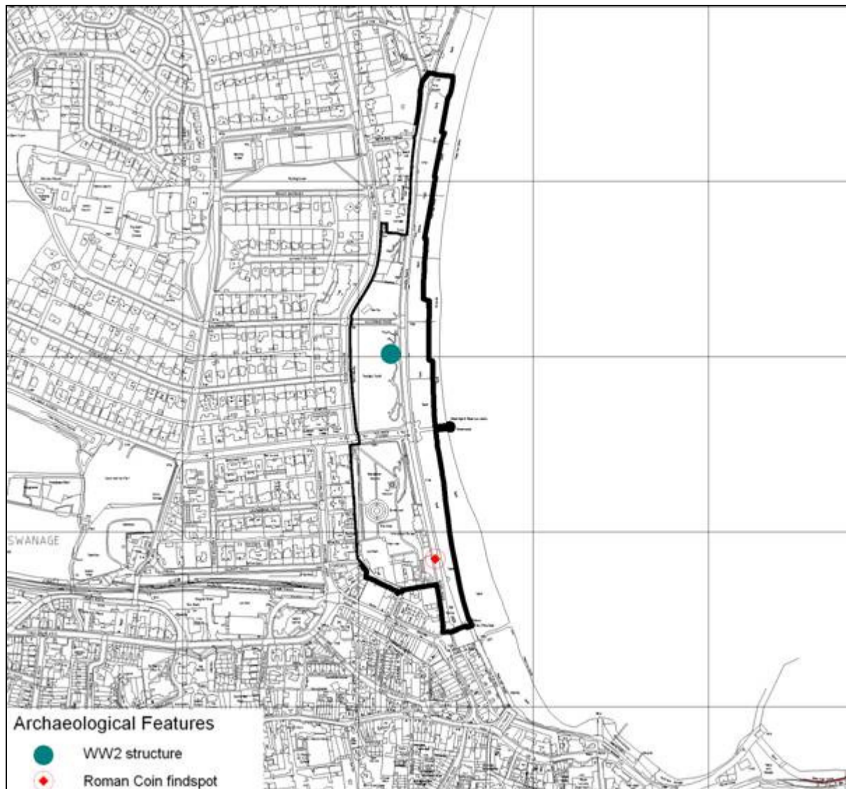
Figure 94: Archaeological features and findspots in Historic Urban Character Area 5.

There is a surviving World War 2 gun emplacement in Sandpit Gardens.