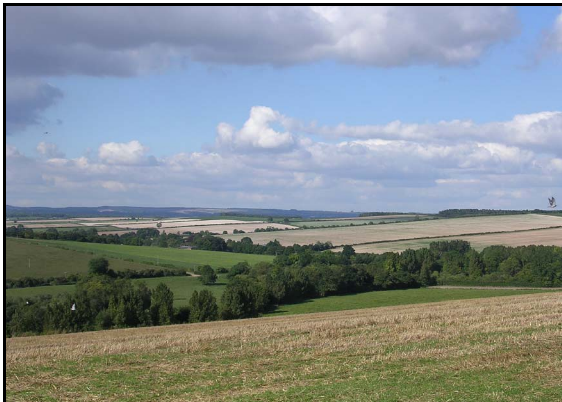
Figure 1 - View north through centre of Parish