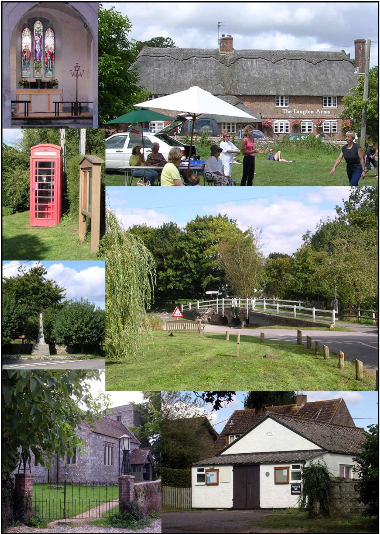
Figure 6 - Village Facilities and War Memorial