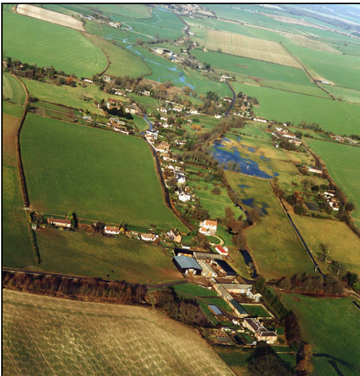
Figure 4 - View of village from south taken in February 1995.

2.5.4. A feature of the village Conservation Area is the virtual absence of any built up street with rows of buildings in close proximity to each other. This gives openness to the village that is in marked contrast to many other English towns and villages see figure 4.