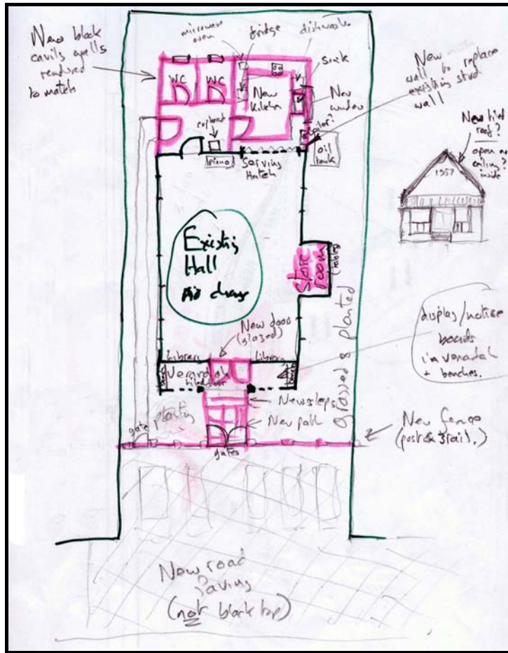
Figure A - Village Hall Improvements