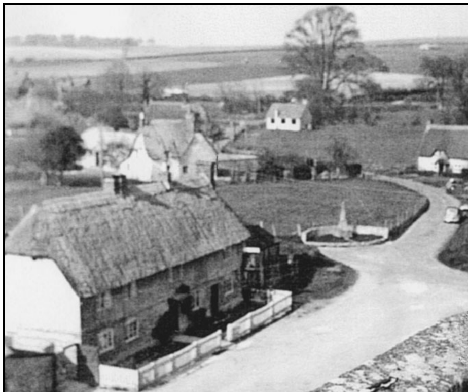
Figure 3 – View from Church towards Splash circa 1955.