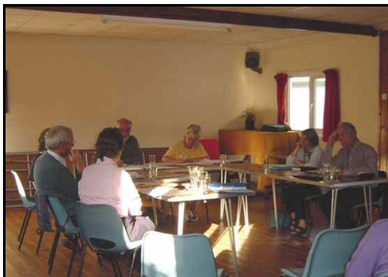
Figure 5 – Parish Plan Steering Group meeting in Village Hall

2.6.2. The Village Hall is used regularly for the Parish Council meetings, Wednesday coffee mornings, French Speaking Club and the Bridge Club and this is reflected in the 18% of respondents who use the Village Hall at least once a month. The majority of people (66%) use the Village Hall occasionally for events such as the Flower Show, Home Produce Sale, Cider Competition and quizzes.