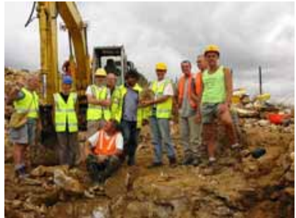
Research dig at Frogden, an inland SSSI in the Inferior Oolite