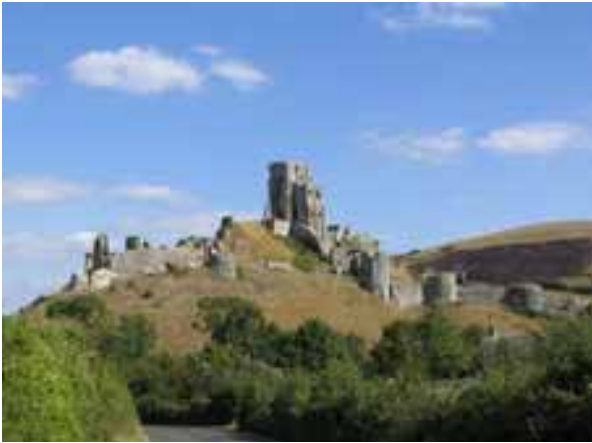
Corfe Castle, Isle of Purbeck