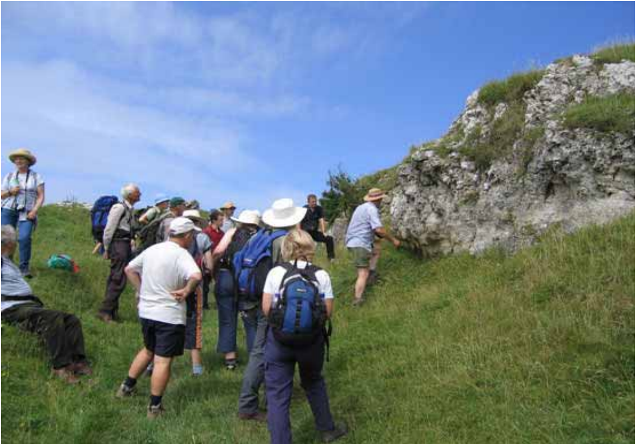
A walk around Abbotsbury with the Dorset Important Geological Sites Group. (DIGS)