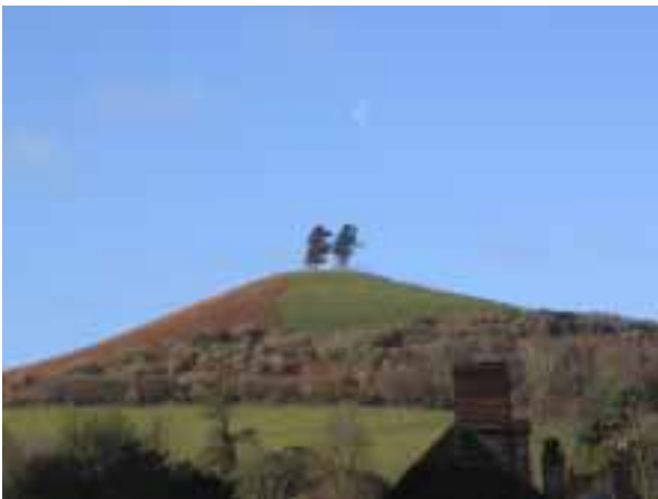
Colmer's Hill, a prominent landscape feature