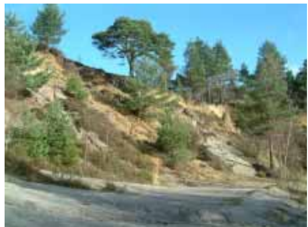
Heathland at Stephen's Castle, Verwood SSSI & RIGS