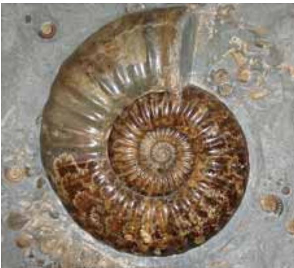
An ammonite from the Lower Jurassic