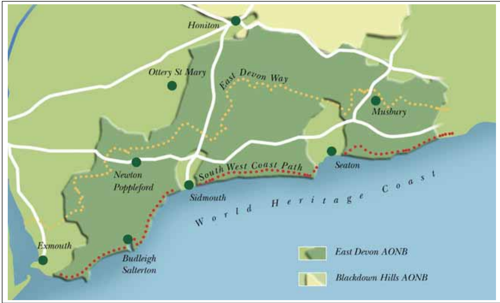
The Dorset LGAP extends to cover the Coastal Corridor of the East Devon AONB and The Jurassic Coast World Heritage Site