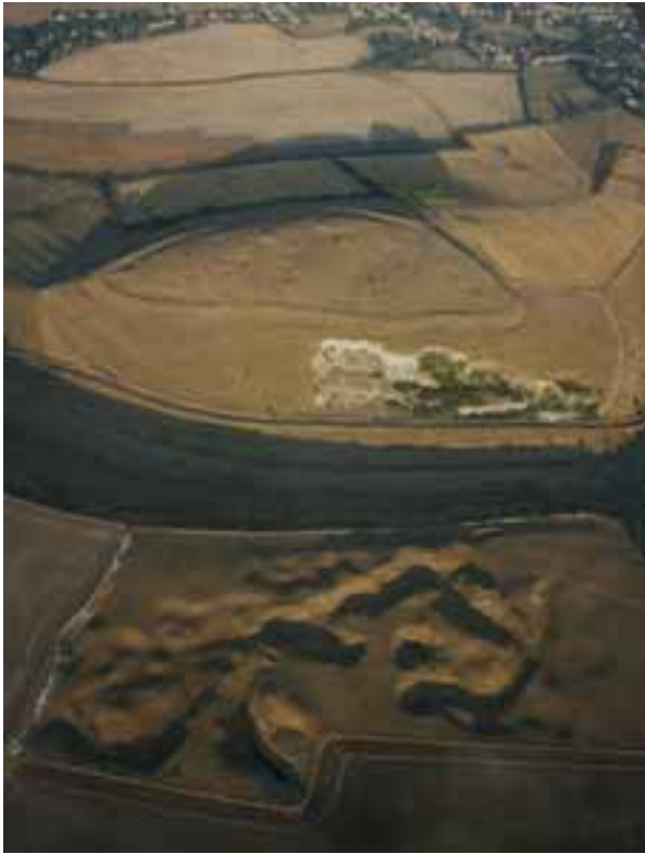
Chalbury Hill Fort with old Portland & Lower Purbeck quarry workings in the foreground. SSSI