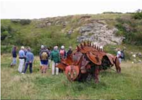
Rocket Quarry, Portesham. RIGS Site