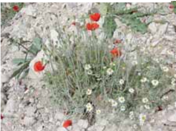
Poppies growing on a spoil heap on Portland

central swathe of Dorset covering much of the Jurassic outcrop. In the east more recent deposits of the Cenozoic, sands, gravels and clays overlie the Cretaceous rocks, These deposits give rise to important heathland habitats.