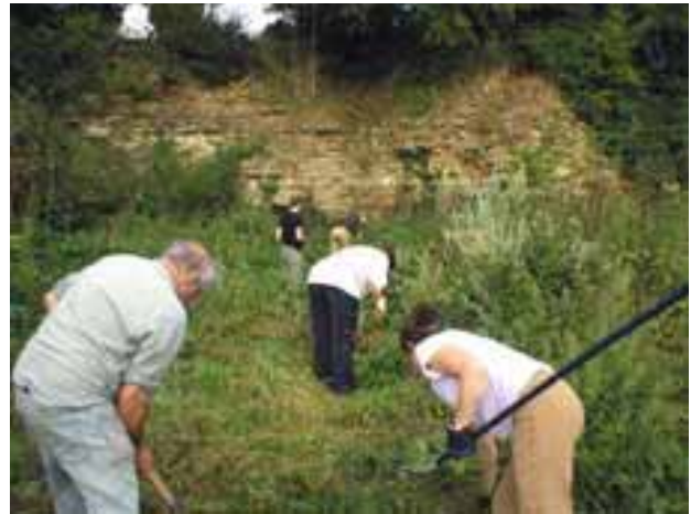
Working together, British Trust for Nature Conservation Volunteers, DIGS and local government officers clearing access to an Inferior Oolite quarry face in Quarr Local Nature Reserve.