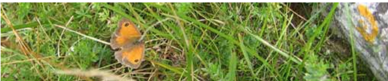
A Hedge Brown butterfly and calcareous loving Bedstraw next to Upper Greensand rock