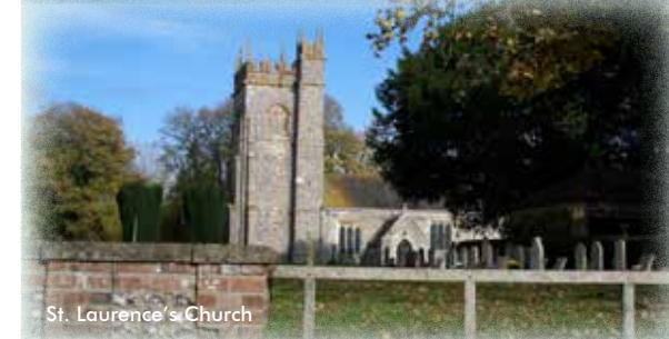
St. Laurence's Church