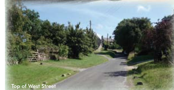
Top of West Street