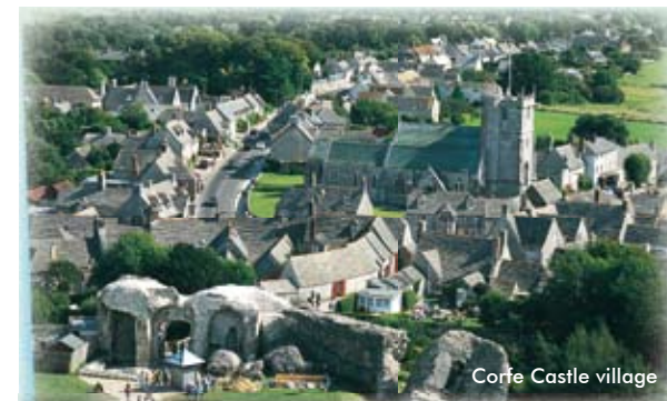
Corfe Castle village

The Character Appraisal document is available for reference at Corfe Library, the District Council offices and may be downloaded from our website: www.purbeck.gov.uk