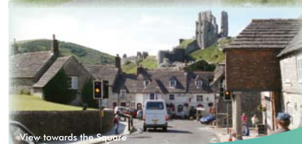
View towards the Square

Planning Services, Purbeck District Council, Westport House, Worgret Road, Wareham, Dorset, BH20 4PP. Tel: 01929 556561 Web: www.purbeck.gov.uk