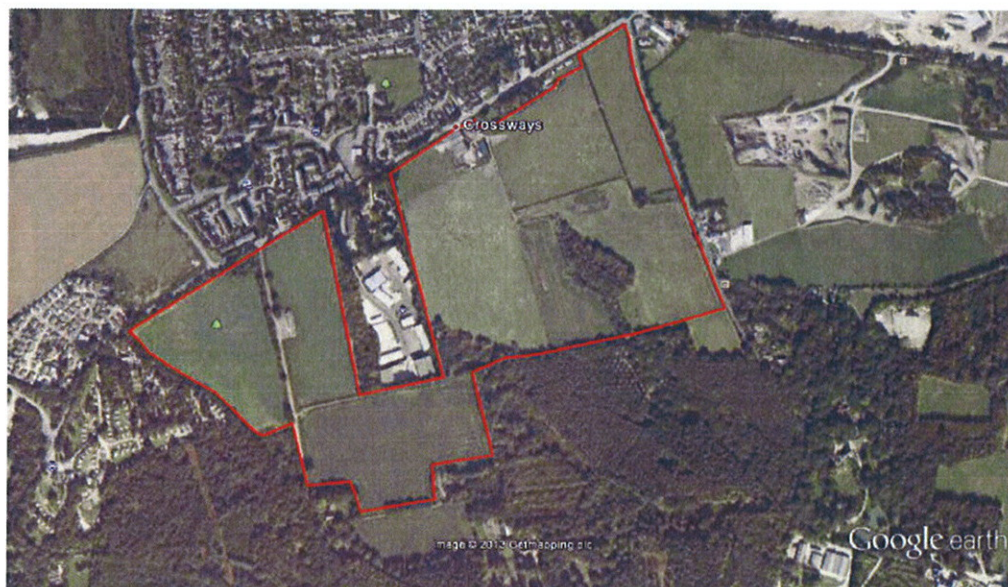
Figure 1: Location of area for assessment at Crossways, West Dorset