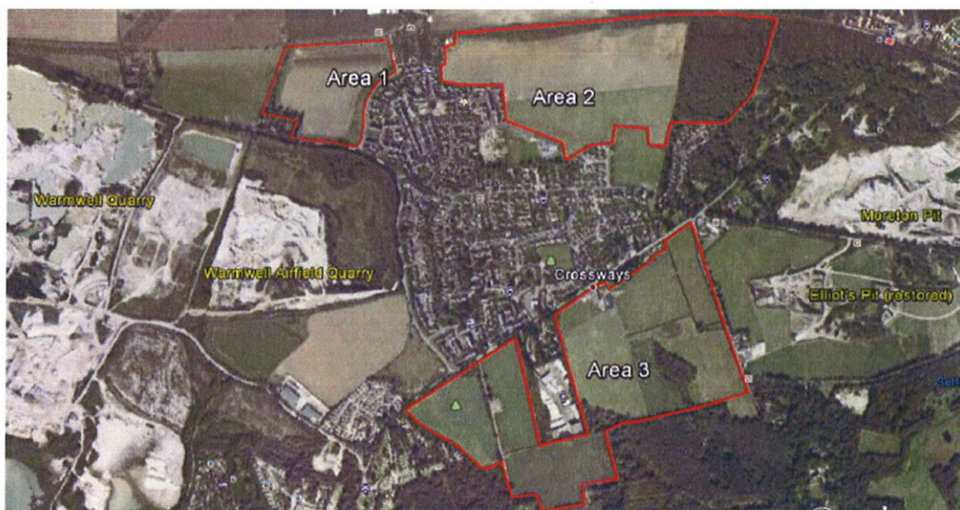
Figure 2: Land allocated for residential and community development in Crossways

1.4 In undertaking the assessment we have, for comparison purposes, also reviewed the suitability of land to the north of Crossways for development . These areas of land (shown as Areas 1 and 2 on Figure 2) which like the General's land, are identified both as Minerals Safeguarding Areas and allocated for residential and community development, could compete directly for development use with the General's land. It is concluded that this land may be suitable for development but to develop the land before the completion of Woodsford Gravel Pit in about 15 years' time may be regarded as premature.