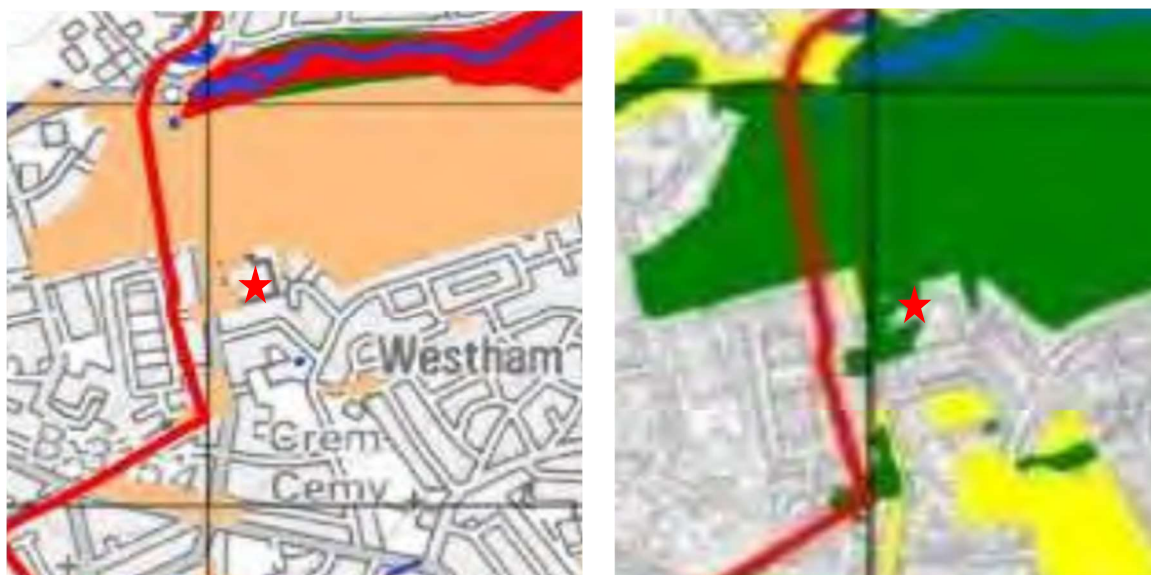
Figure 1: The map on the left is a screenshot of Map 6 from the WNP (page 33). The map on the right is a screenshot of Map 8 from the WNP (page 38). These maps show Westhaven Hospital as falling within the Ecological Network. Stars indicate the approximate site location.

Whilst Map 6 is specifically stated in draft policy W04 (page 39), draft policy W03 (page 35) refers to the ecological network that is outlined in the maps above. These policies state that: