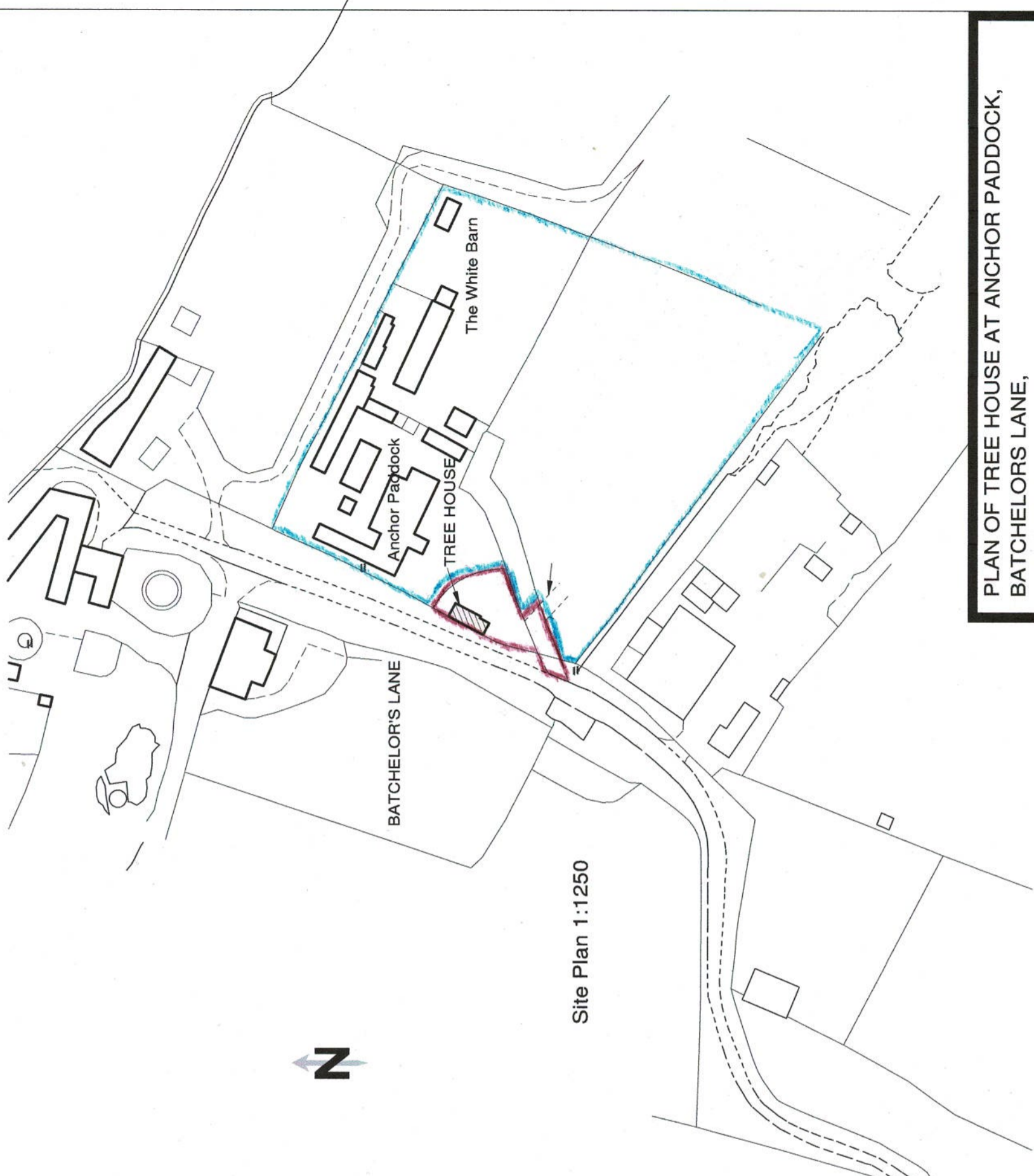
Site Plan 1:1250

PLAN OF TREE HOUSE AT ANCHOR PADDOCK, BATCHELORS LANE, HOLTWOOD, Nr. WIMBORNE, DORSET. SITE & LOCATION PLANS TREE HOUSE