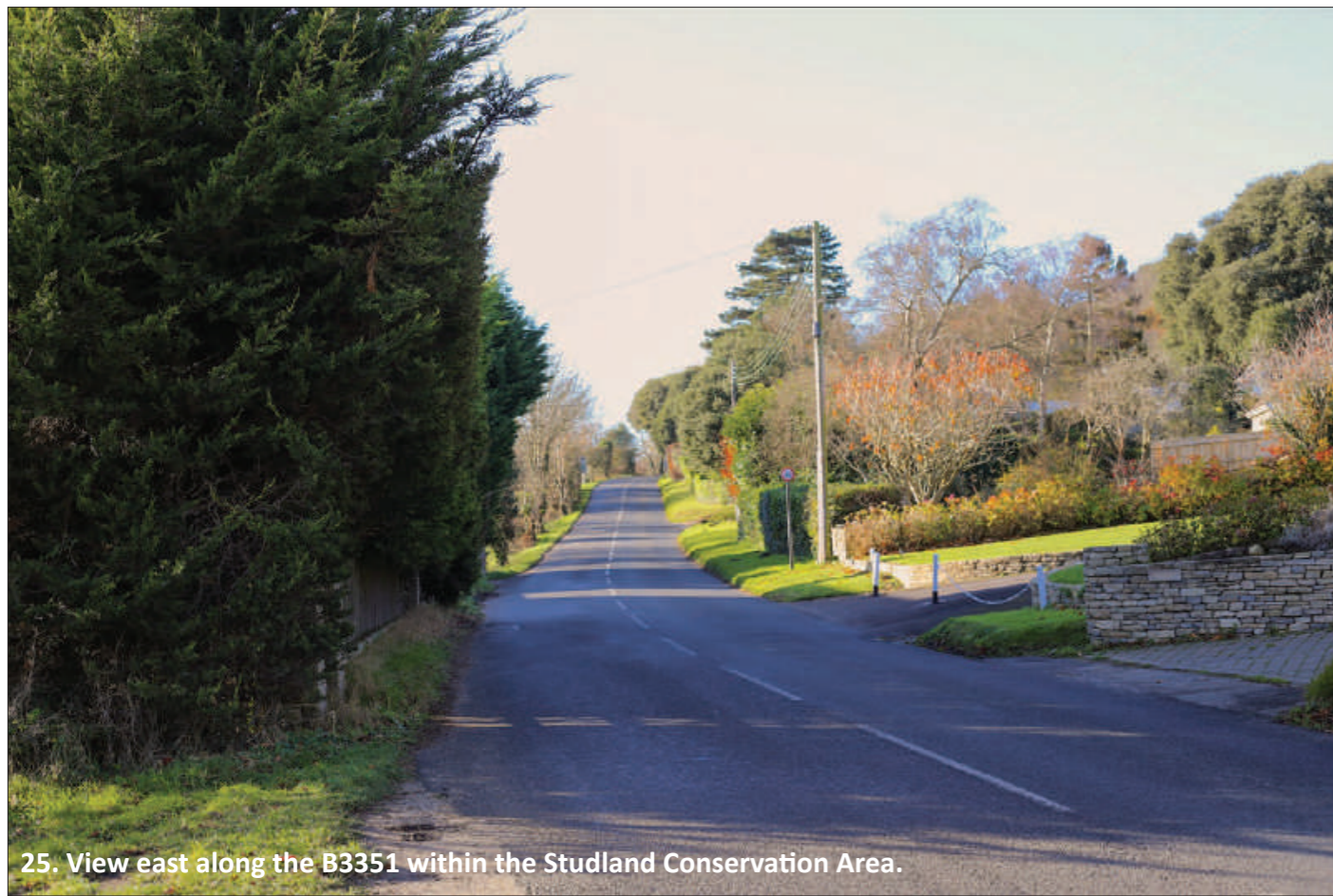
25. View east along the B3351 within the Studland Conservation Area.