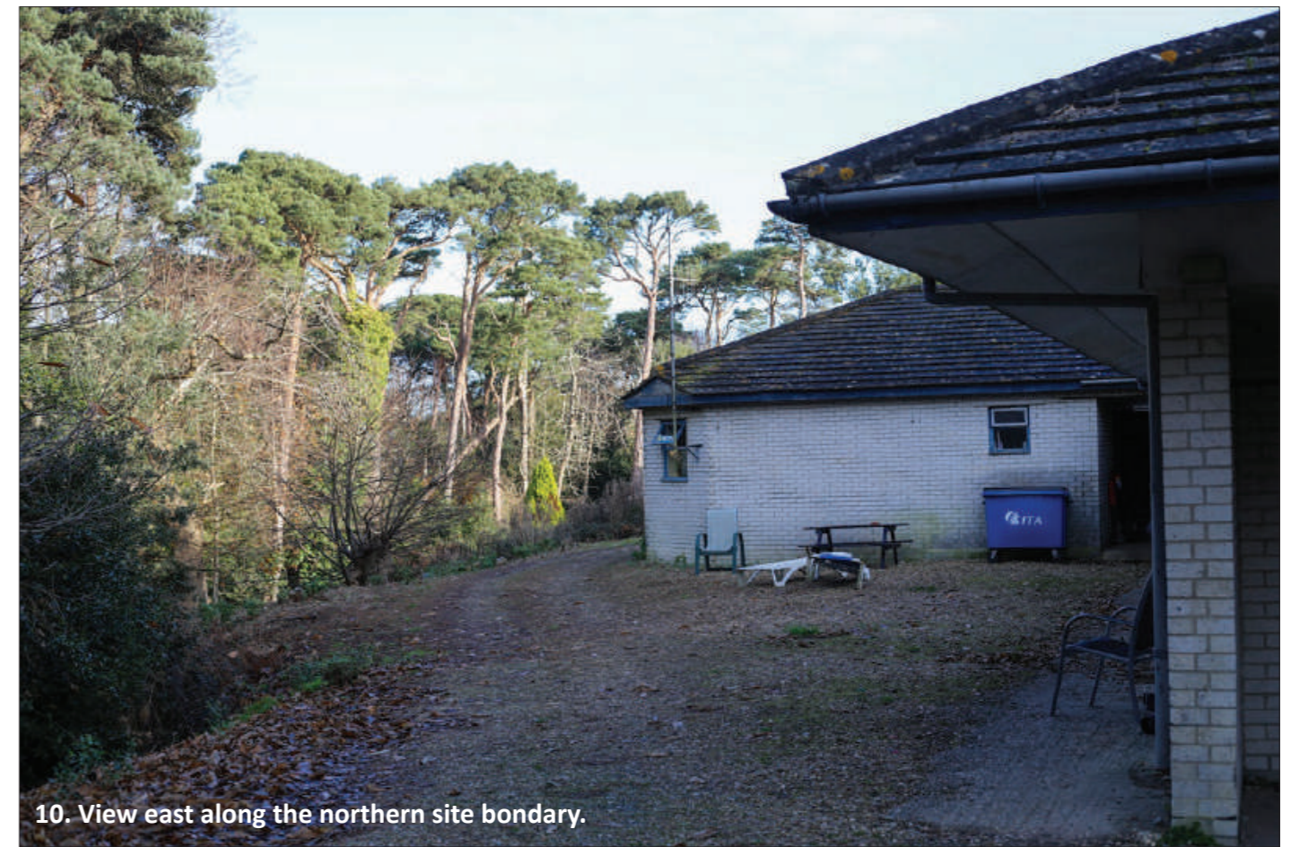
10. View east along the northern site boundary.