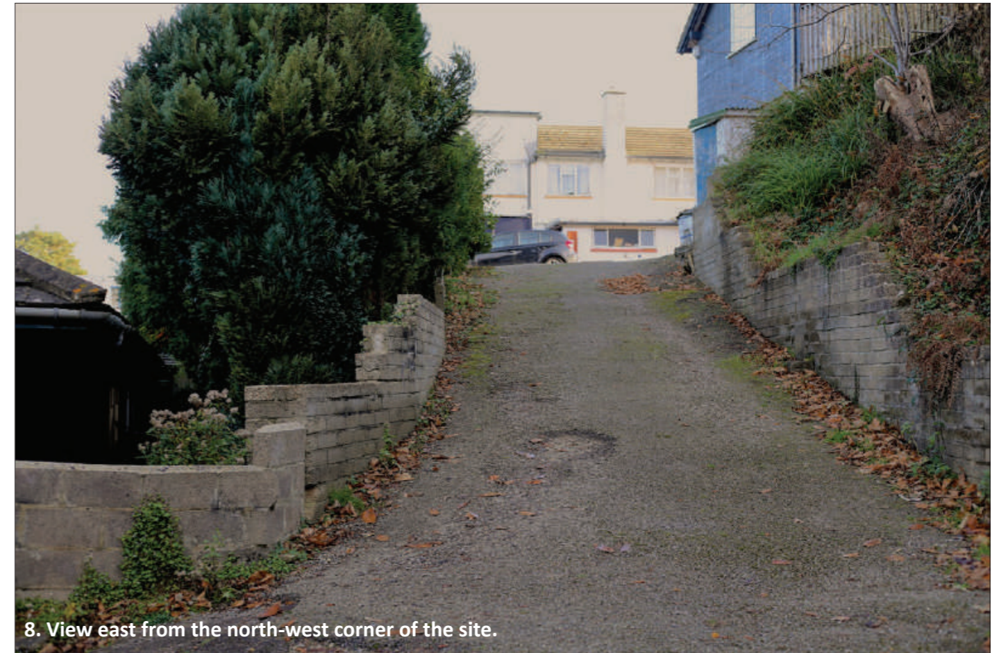
8. View east from the north-west corner of the site.