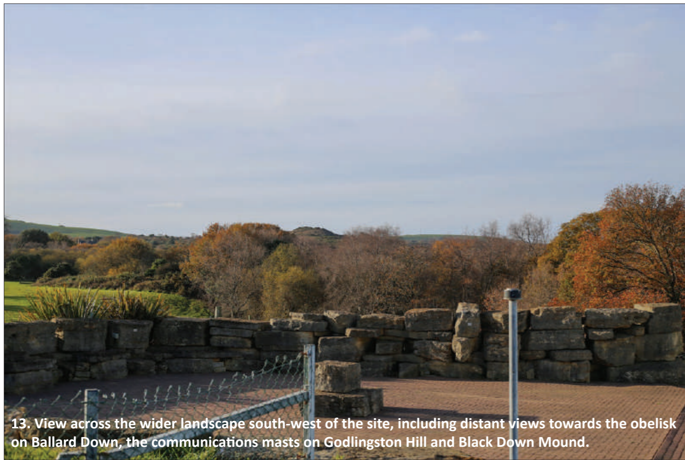
13. View across the wider landscape south-west of the site, including distant views towards the obelisk on Ballard Down, the communications masts on Godlingston Hill and Black Down Mound.