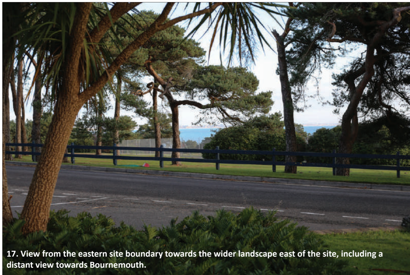
17. View from the eastern site boundary towards the wider landscape east of the site, including a distant view towards Bournemouth.