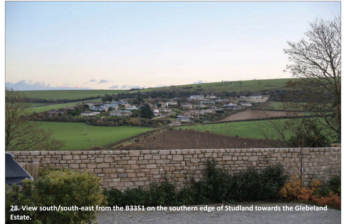
28. View south/south-east from the B3351 on the southern edge of Studland towards the Glebeland Estate.