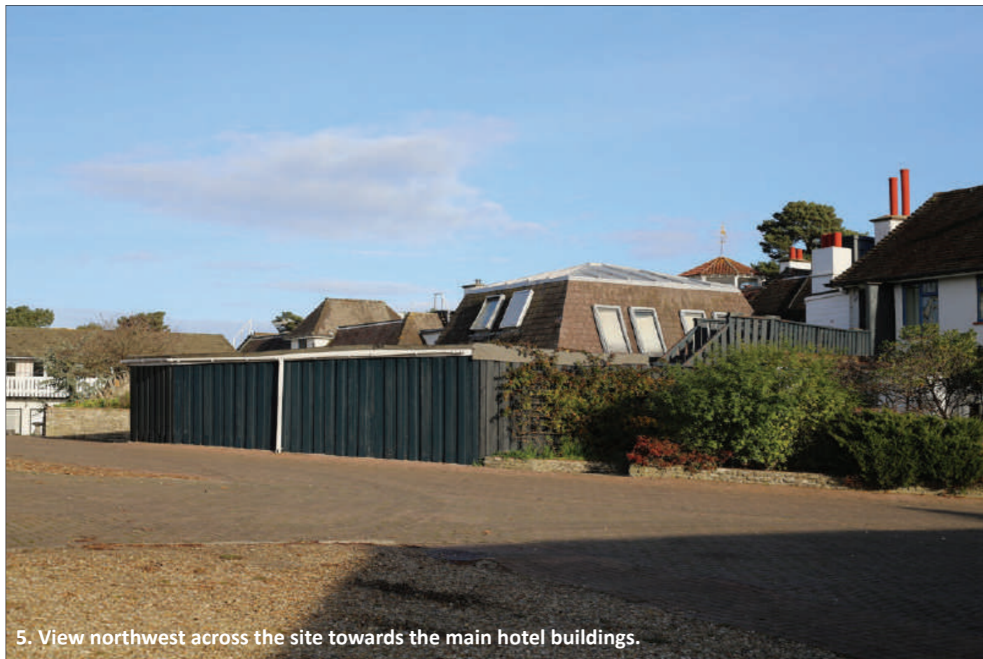
5. View northwest across the site towards the main hotel buildings.