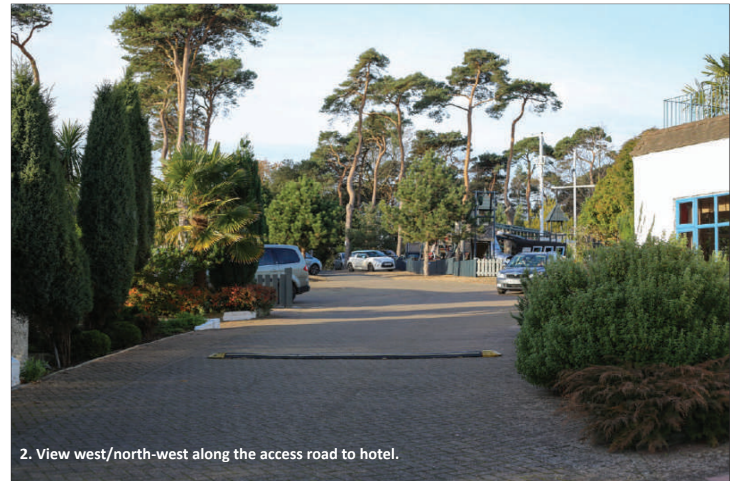
2. View west/north-west along the access road to hotel.