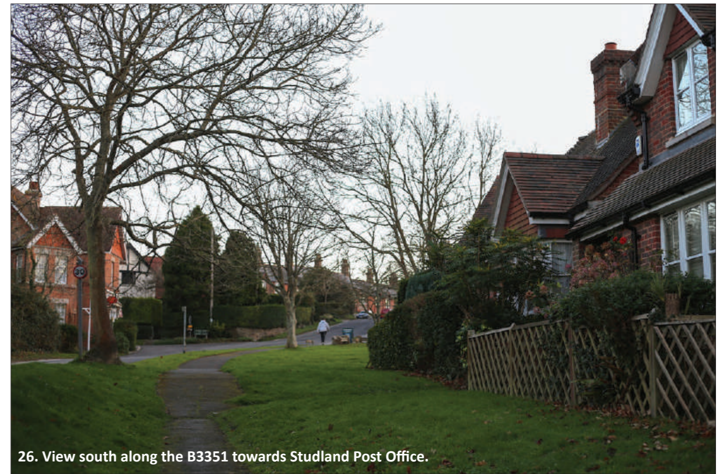
26. View south along the B3351 towards Studland Post Office.