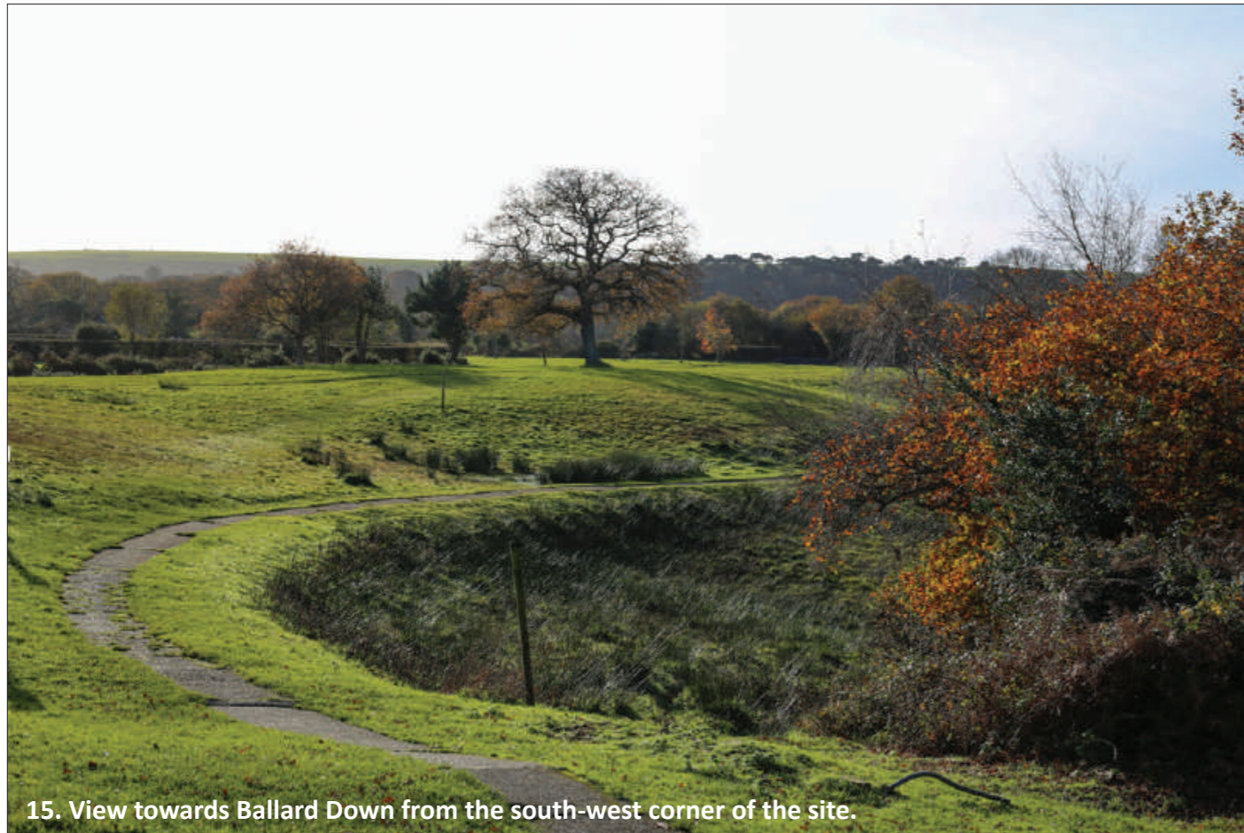
15. View towards Ballard Down from the south-west corner of the site.