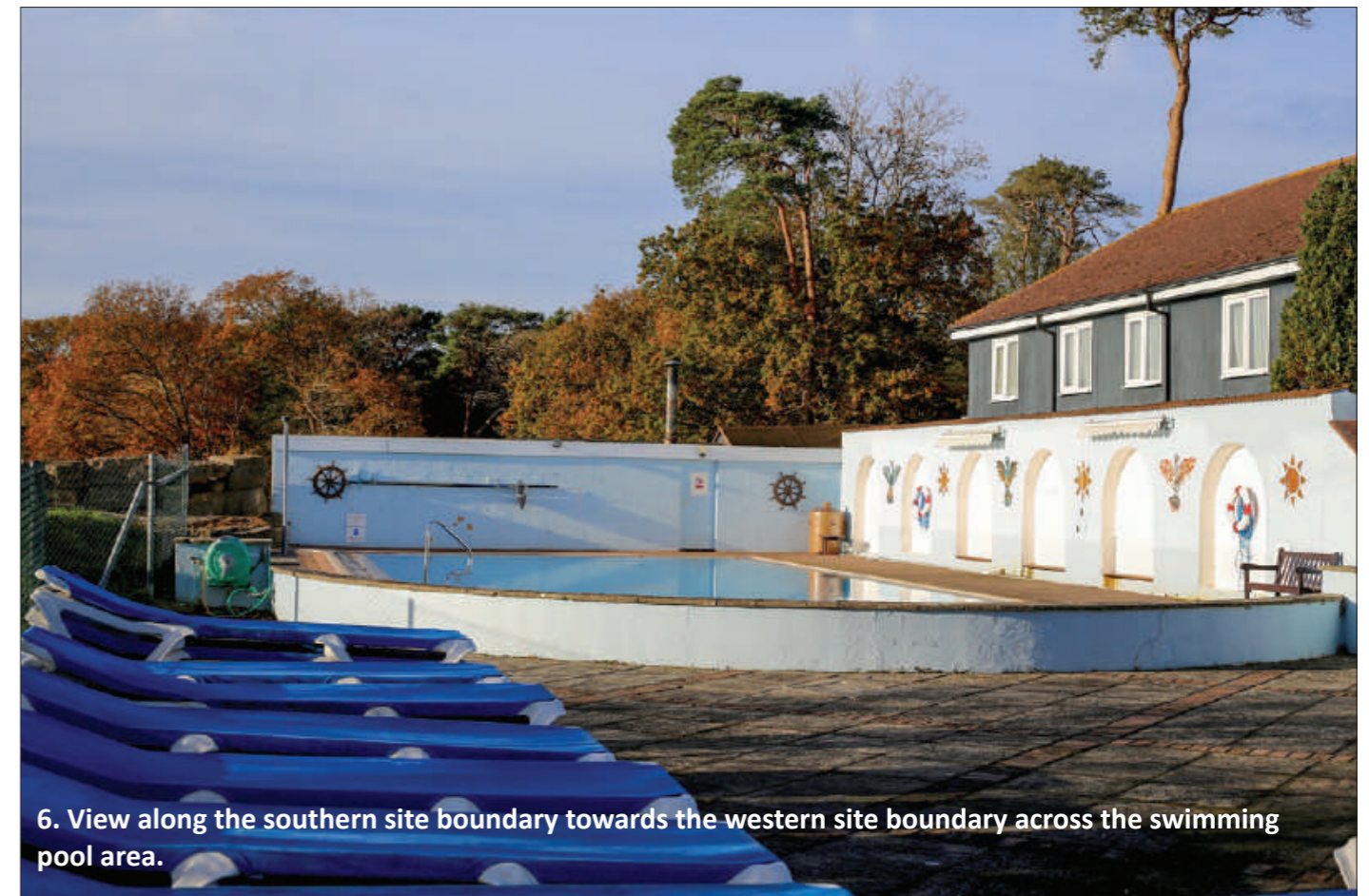
6. View along the southern site boundary towards the western site boundary across the swimming pool area.