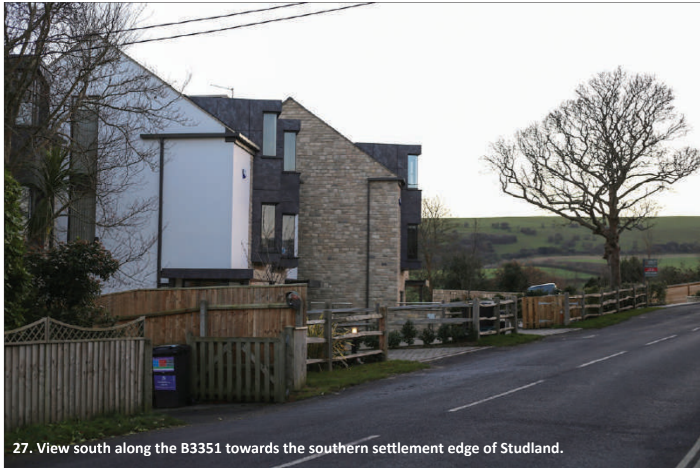
27. View south along the B3351 towards the southern settlement edge of Studland.