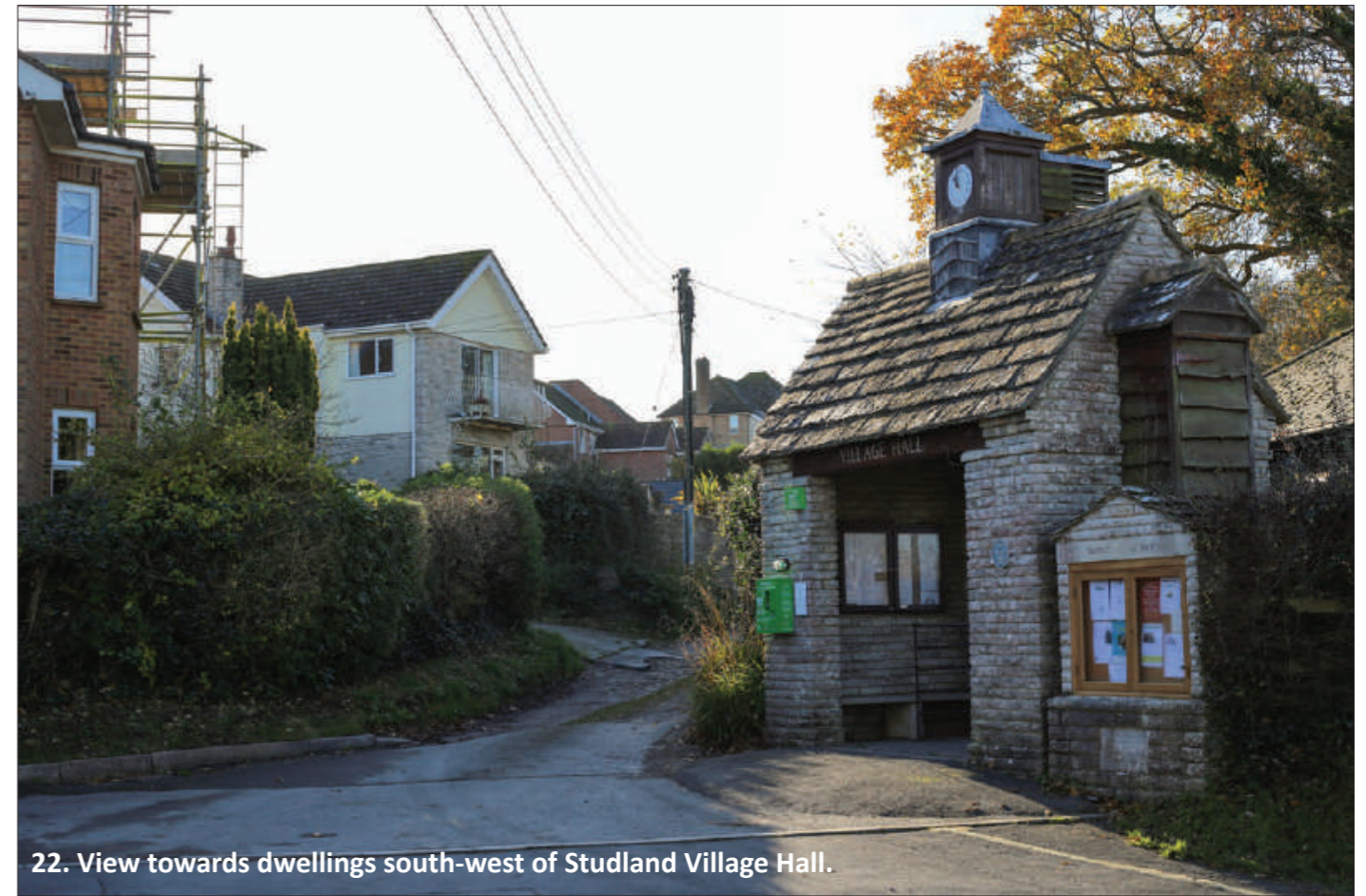
22. View towards dwellings south-west of Studland Village Hall.