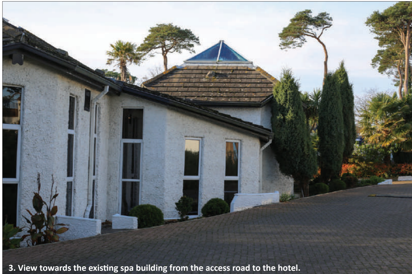
3. View towards the existing spa building from the access road to the hotel.