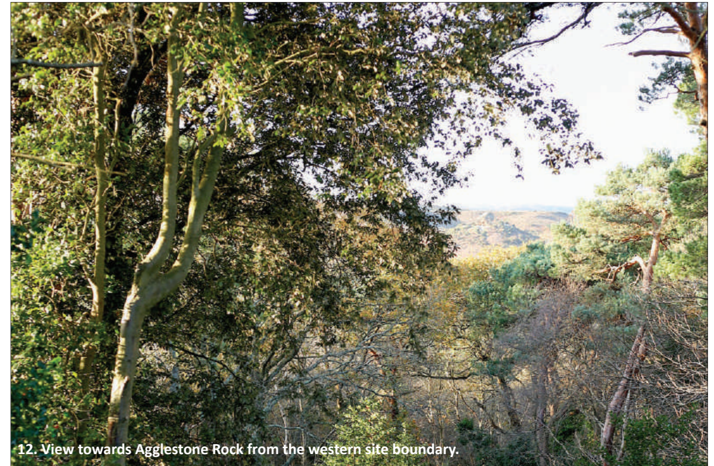
12. View towards Agglestone Rock from the western site boundary.