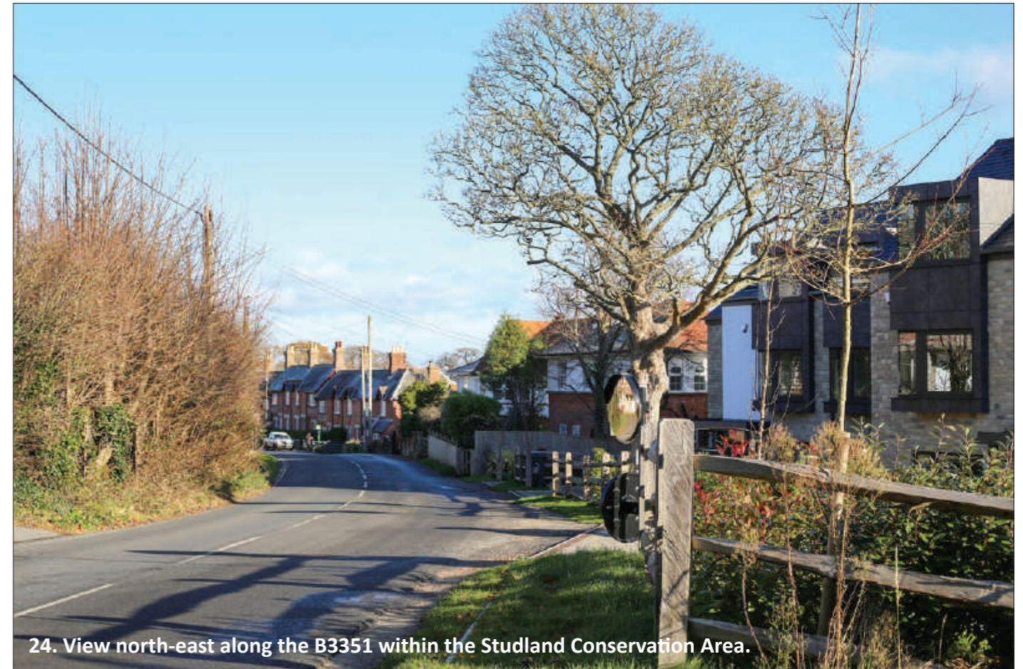
24. View north-east along the B3351 within the Studland Conservation Area.