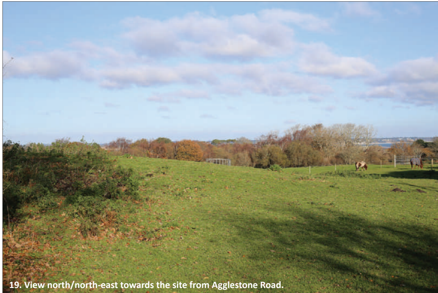
19. View north/north-east towards the site from Agglestone Road.