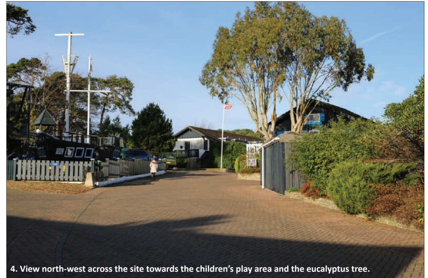
4. View north-west across the site towards the children's play area and the eucalyptus tree.