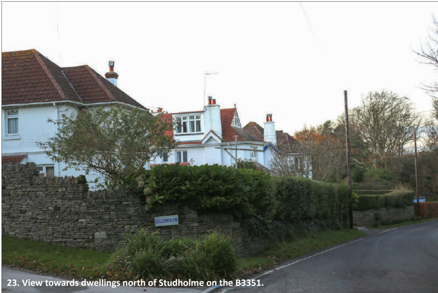
23. View towards dwellings north of Studholme on the B3351.