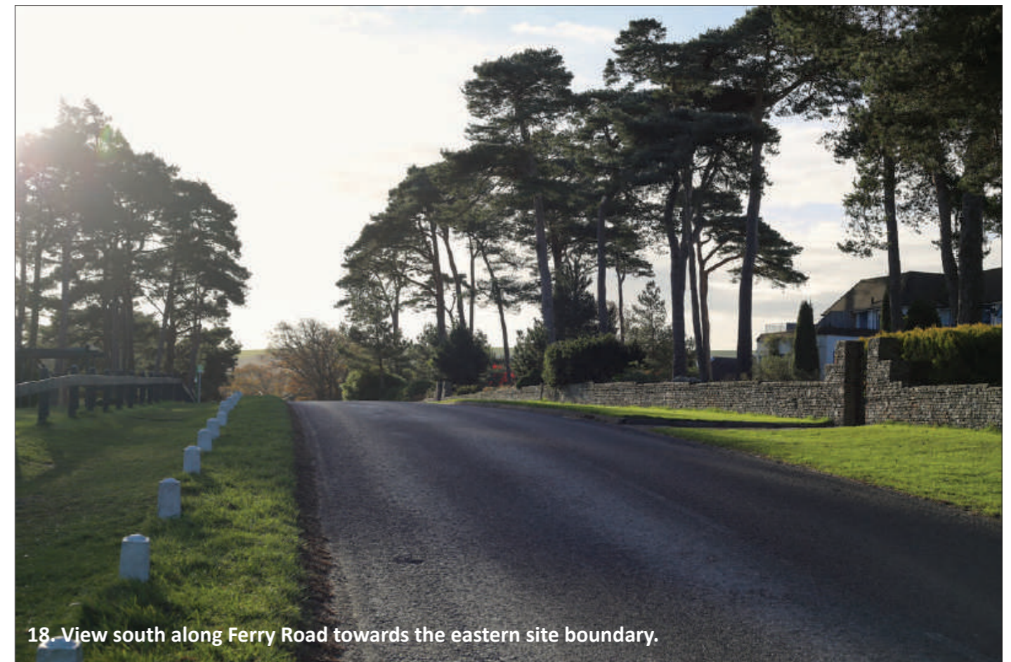
18. View south along Ferry Road towards the eastern site boundary.