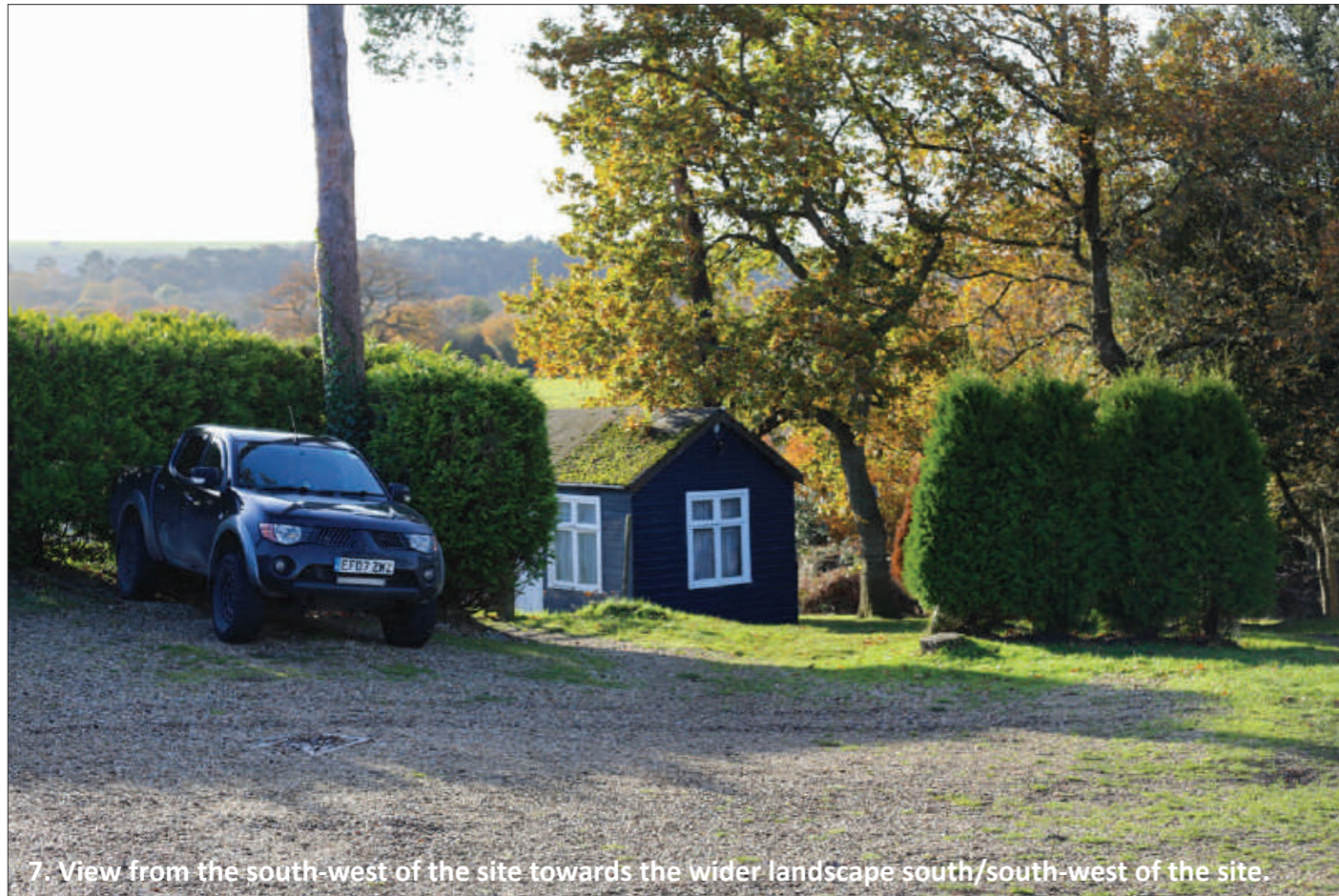
7. View from the south-west of the site towards the wider landscape south/south-west of the site.