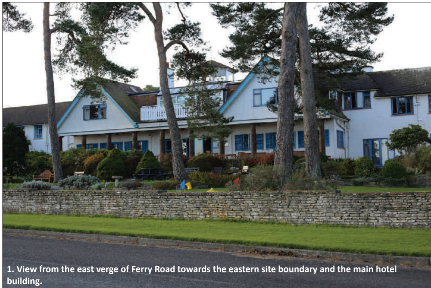
1. View from the east verge of Ferry Road towards the eastern site boundary and the main hotel building.