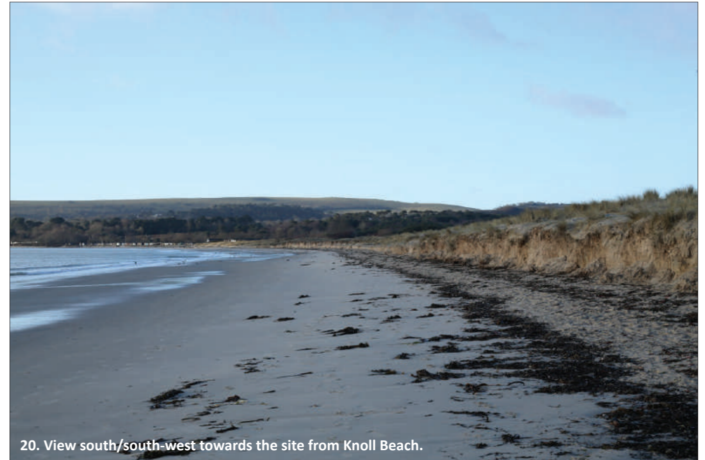
20. View south/south-west towards the site from Knoll Beach.