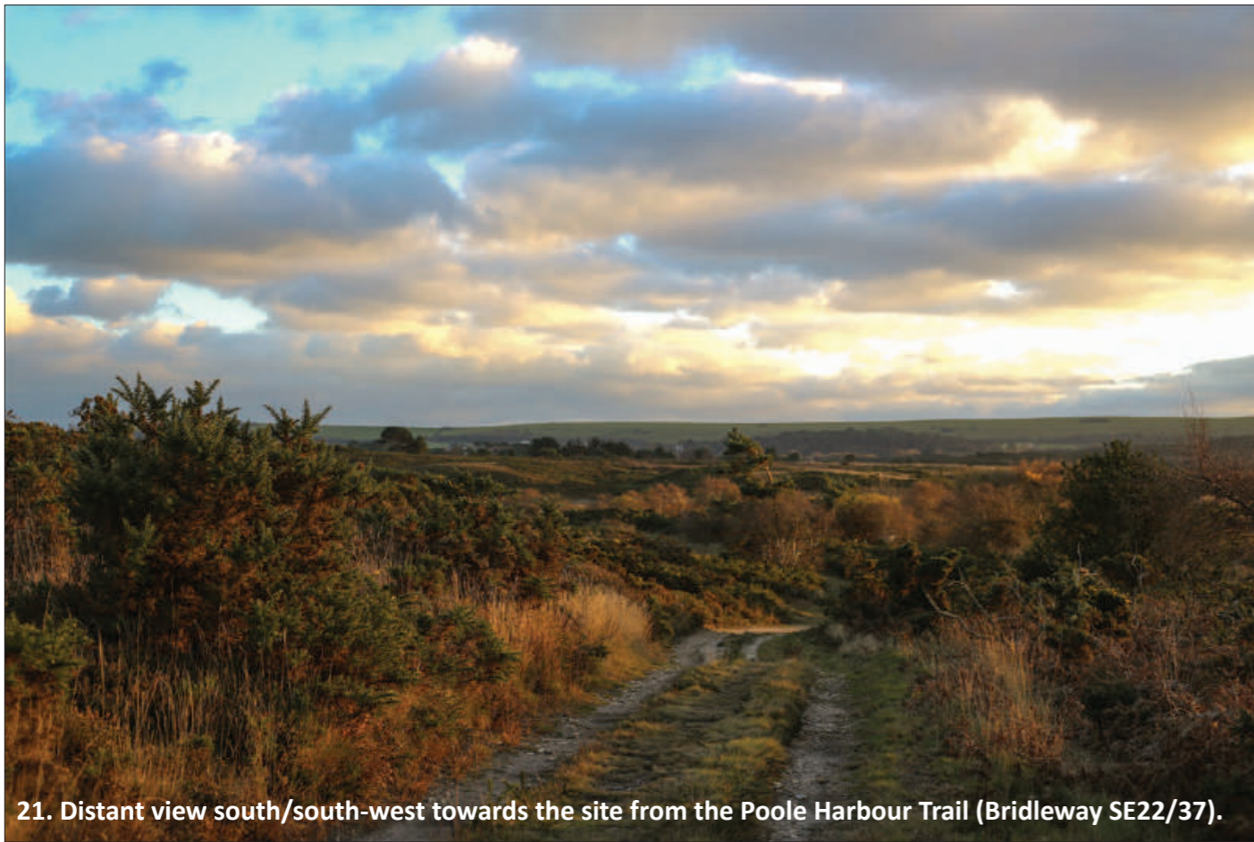
21. Distant view south/south-west towards the site from the Poole Harbour Trail (Bridleway SE22/37).