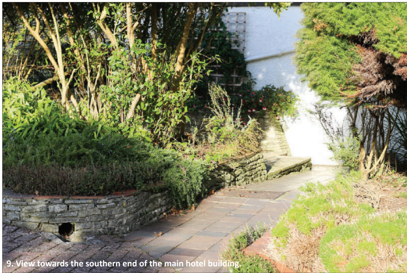
9. View towards the southern end of the main hotel building.