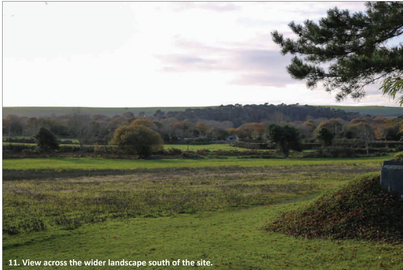
11. View across the wider landscape south of the site.