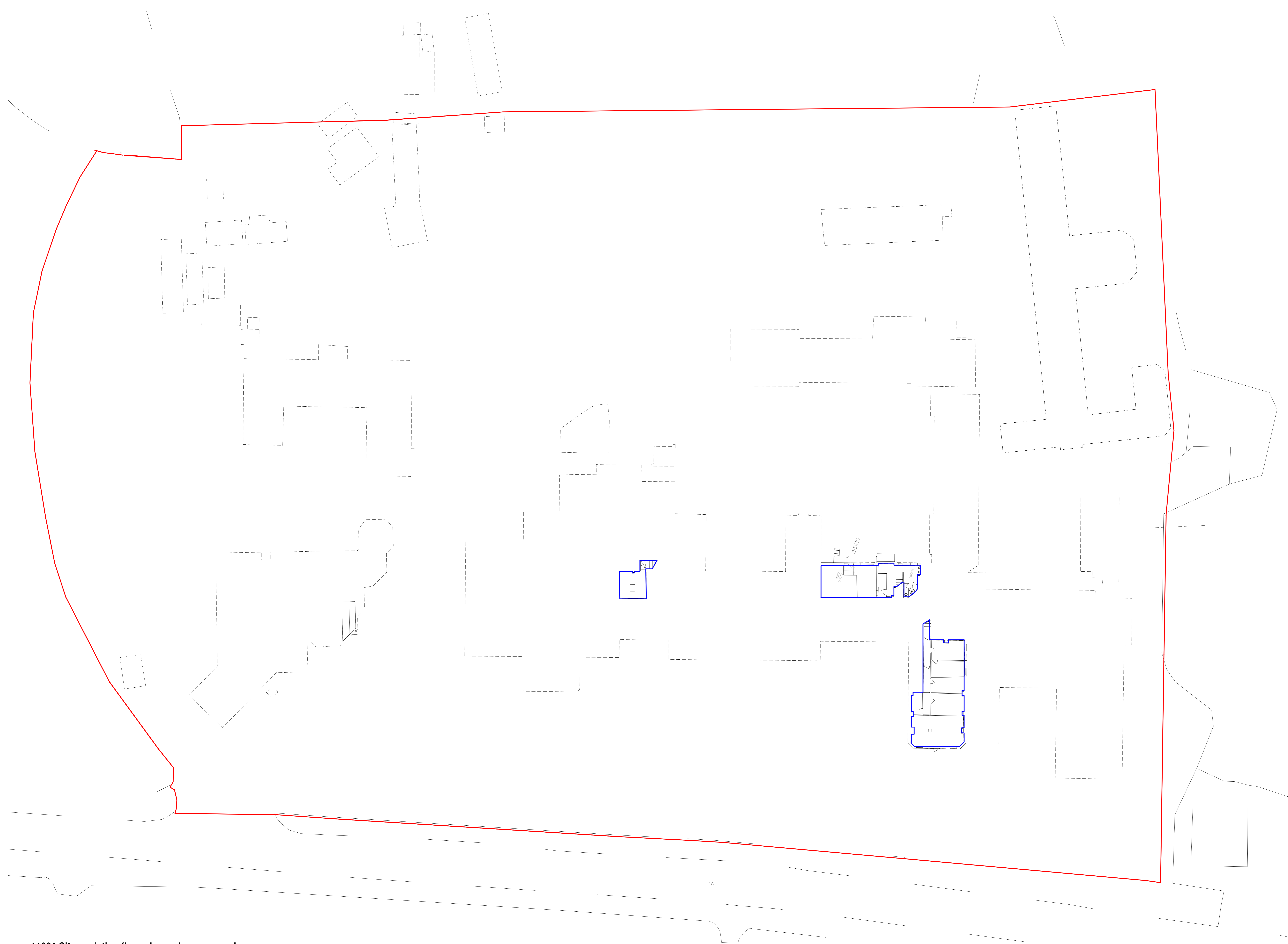
11001 Site - existing floor plans – lower ground 1 : 200

Accommodation/Leisure = 6050 sqm/ 65122 sq.ft *Excludes ancillary / outbuildings