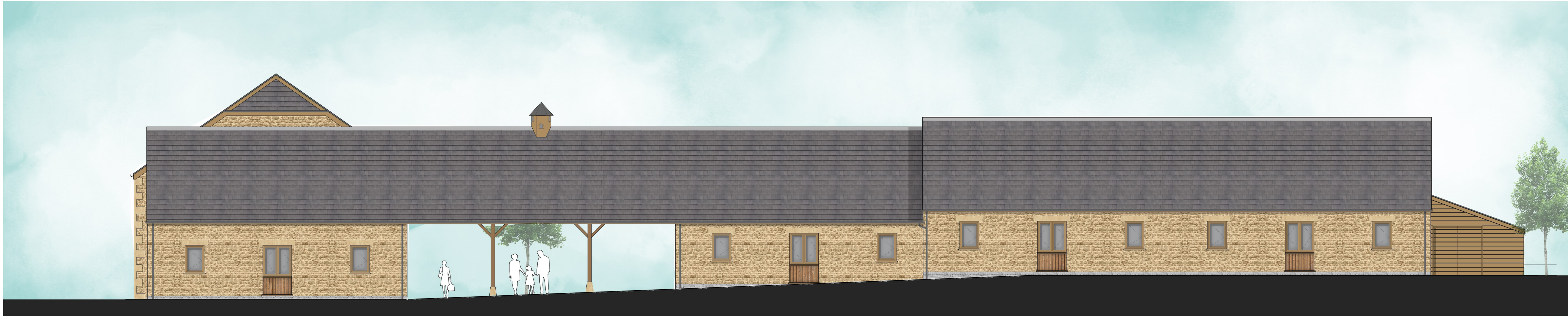
South - West Elevation

Notes: • All drawings are subject to Planning and Building Control consent. • The details shown are for design intent purposes only and are subject to further design development with suppliers and sub-contractors • Proposals subject to consultation and approval from Local Authority Building Control or an Approved Inspector • All setting out dimensions should be checked on-site prior to construction and any discrepancies and/or omissions should be reported to the Architect immediately