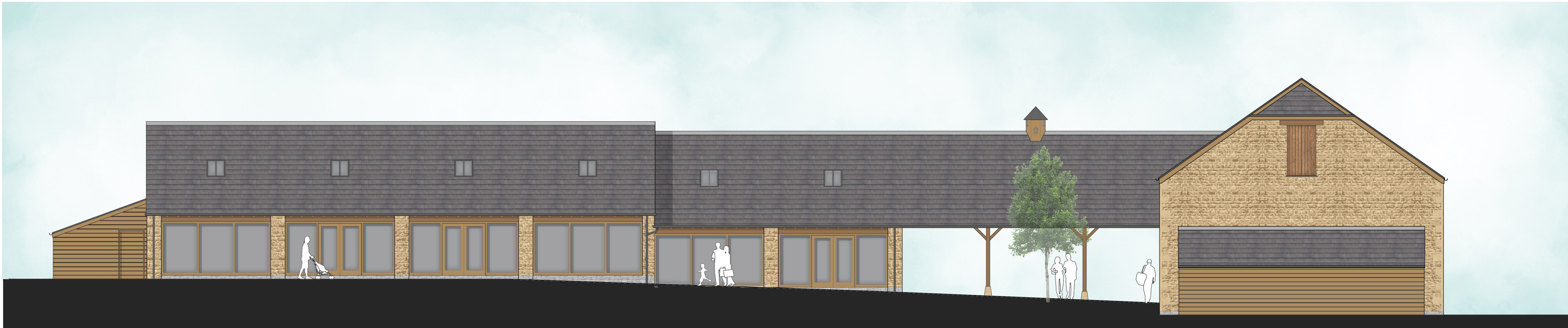
North - East Elevation