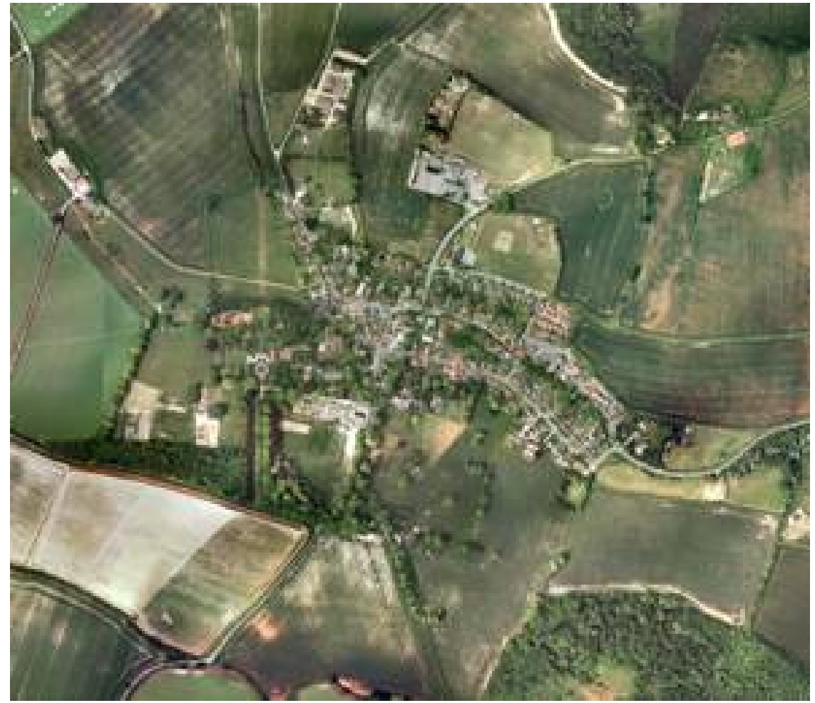
Figure 1: Vertical aerial photographic view of Cranborne, 2005.