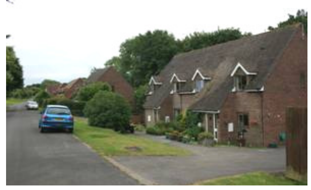
Figure 50: Sylvan Row, on south side of Catherine's Well.