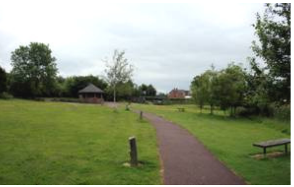
Figure 47: View of public park at Catherine's Well.

higher density with the houses accessed by a short curvilinear cul-de-sac. The roads have a semi-rural aspect with good views onto the surrounding countryside.