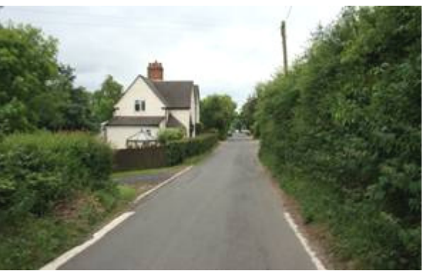
Figure 48: New Close Cottages from north.