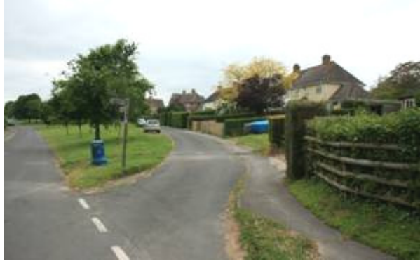
Figure 45: Catherine's Well, 1950s council housing estate set around a crescent.