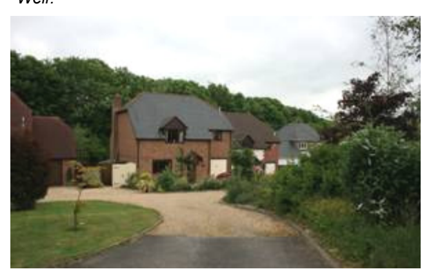
Figure 51: Modern housing development, Athelstan Way.