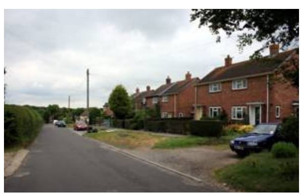
Figure 46: Post-war council houses at north end of Catherine's Well.