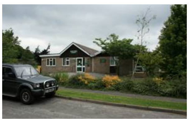
Figure 52: Doctor's Surgery, Catherine's Well.