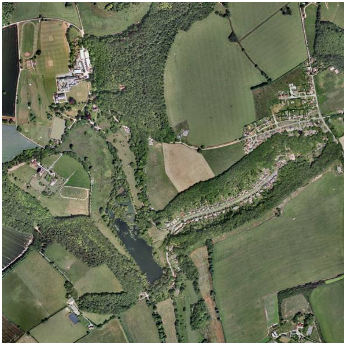
Figure 1: Vertical aerial photographic view of Milton Abbas, 2005.

ley, surrounded by chalk downland, which has been incorporated into a Brownian landscaped park. The present village, set in a narrow side valley, is an integral designed part of this park.