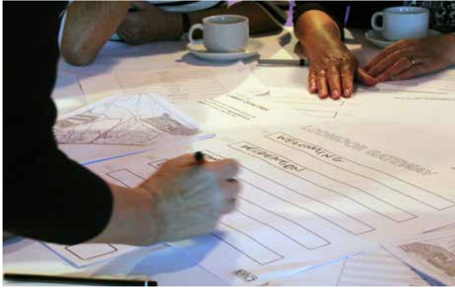
Task 02 Workshop participants were encouraged to describe the qualities that different districts or quarters in the town centre should exhibit in the future.

This area could be a location for enterprise, community and be "refreshing" with a modern and vibrant atmosphere.