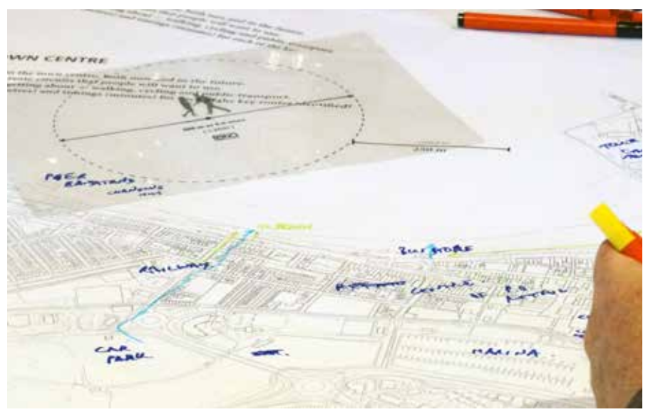
Task 04 Workshop participants examined the connections between different places and the time it takes to move between them.

Strategic transport links could also be strengthened, such as the park and ride extending its operations beyond 6pm and the bus route from there penetrating the town centre further.