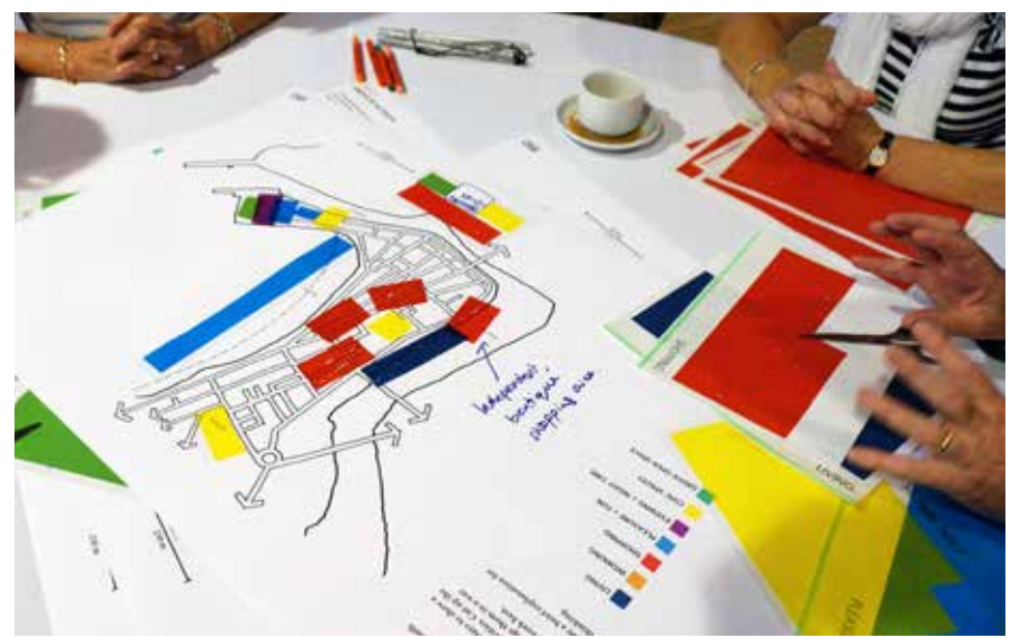
Task 01 Workshop participants were encouraged to "plan the town centre" using different coloured overlays to indicate different areas of activity.

The results gave a general consensus on the need to maintain a vibrant shopping district in the heart of the town centre, supported by better management and greater investment in the retail core. It was also identified that the shop units could be more intensively used, with opportunities for living on the upper floors not fully exploited. Maintenance of the existing building stock was identified as a concern.