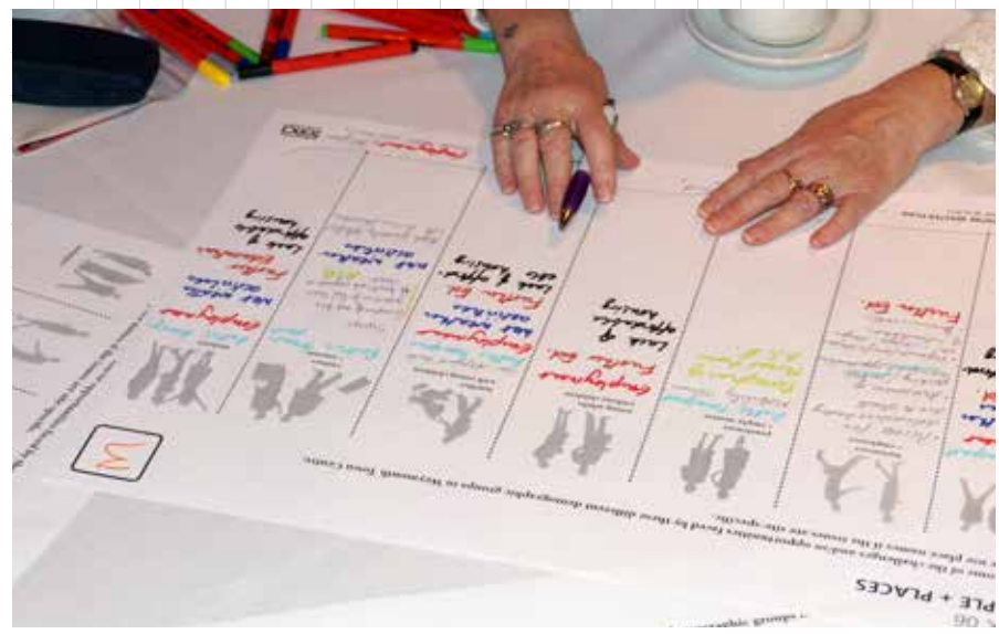
Task 06 Workshop participants were asked to list the challenges and opportunities faced by different demographic groups.