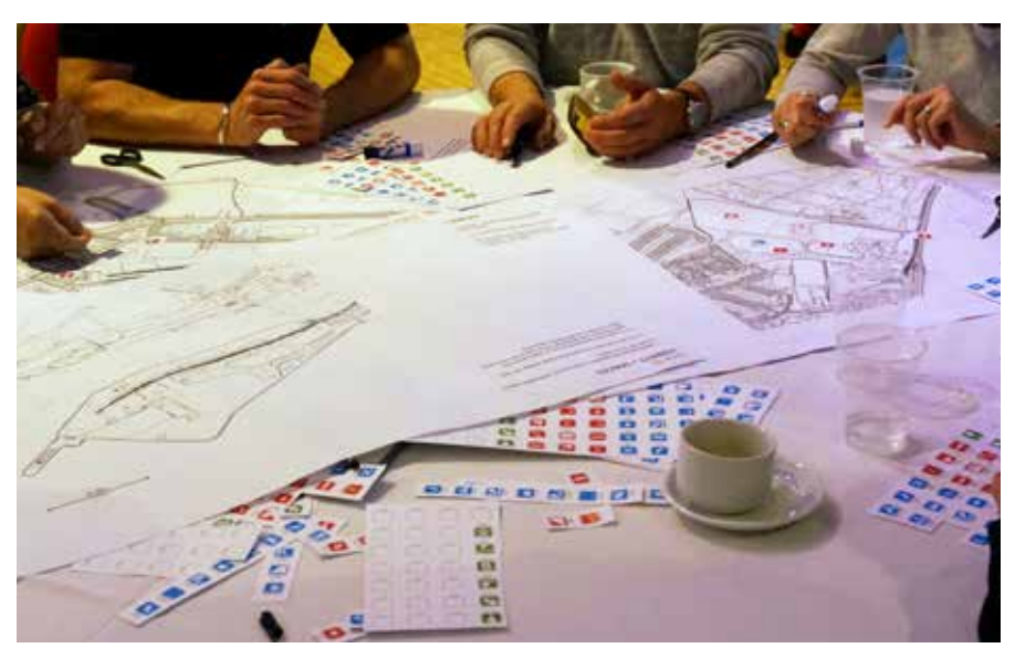
Task 03 Workshop participants used a series of icons to identify the challenges and opportunities assciated with the streets and spaces in the town centre.

There was a general consensus that this is area should be maintained and enhanced as a green, open space with water features. It should have a focus on outdoor activities, including areas for picnics, camping and cycling. The task results highlighted a general perception that the area is currently a fairly cluttered area which could be quickly enhanced through relatively minor works, such as more litter bins and/or more frequent litter collections, investment in public facilities and encouraging more "pop-up" events and activities to take place.