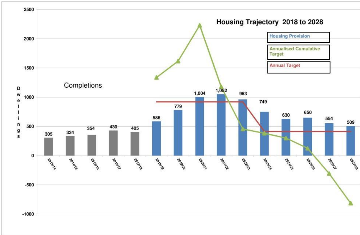
Chart 1 (20% Buffer)