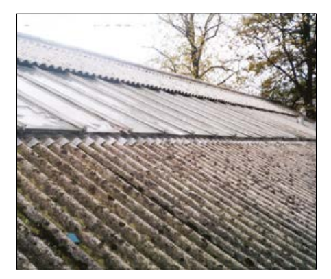
AC sheets used as roofing

There may be AC debris on the ground. Be careful not to crush this.