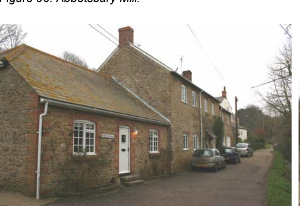
Figure 98: Numbers 4-5 Grove Lane.