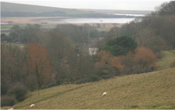
Figure 92: View of Historic Urban Character Area 5 with The West Fleet in the background.