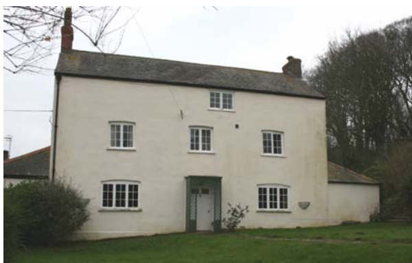
Figure 97: Number 3 Grove Lane.