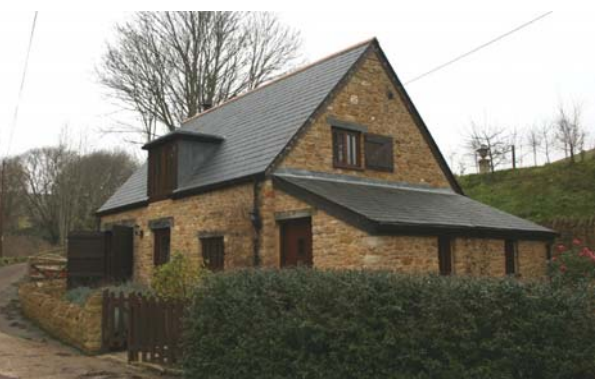
Figure 99: Mill Cottage, Grove Lane.