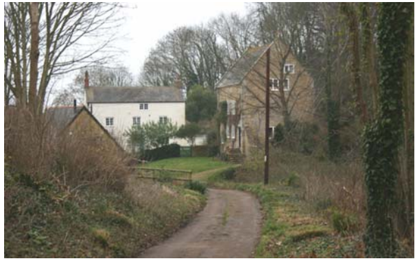
Figure 93: View of Abbotsbury Mill and associated buildings along Grove Lane.