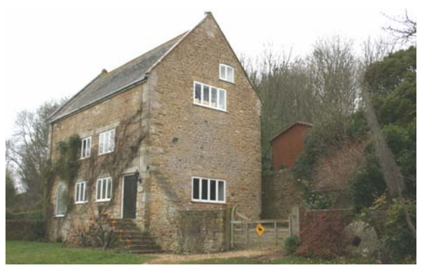
Figure 96: Abbotsbury Mill.

18<sup>th</sup>–19<sup>th</sup> century cottages: 1-2 Grove Lane, 4-5 Grove Lane, 6-7 Grove Lane.