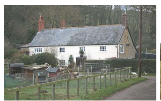
Figure 94: Estate workers' cottages, 6-7 Grove Lane.

The settlement pattern is one of detached and semi-detached cottages set back slightly from Grove Lane, with some presenting their gable ends to the street. Some of the cottages are converted barns or mill buildings, although the consistent use of local materials and good survival of 17<sup>th</sup> and 18<sup>th</sup> century buildings means that they blend in well with the overall character of the area. The area is rural in character, with widely spaced buildings a large number of mature trees and enclosed fields (Figure 95) and a partial separation from the town centre due to its location on the south side of the abbey precinct.