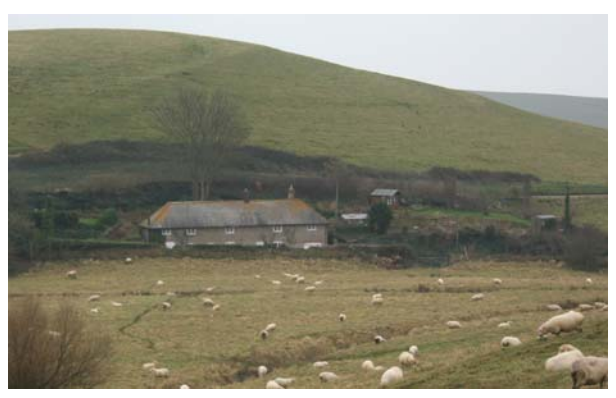
Figure 102: View of Historic Urban Character Area 5.

The northernmost tip of the character area lies within the scheduled area for St Peter's Abbey (SM22961).