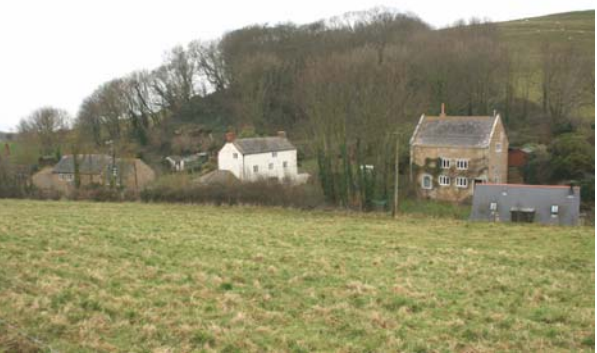
Figure 95: View of Abbotsbury Mill with Grove Lane cottages.