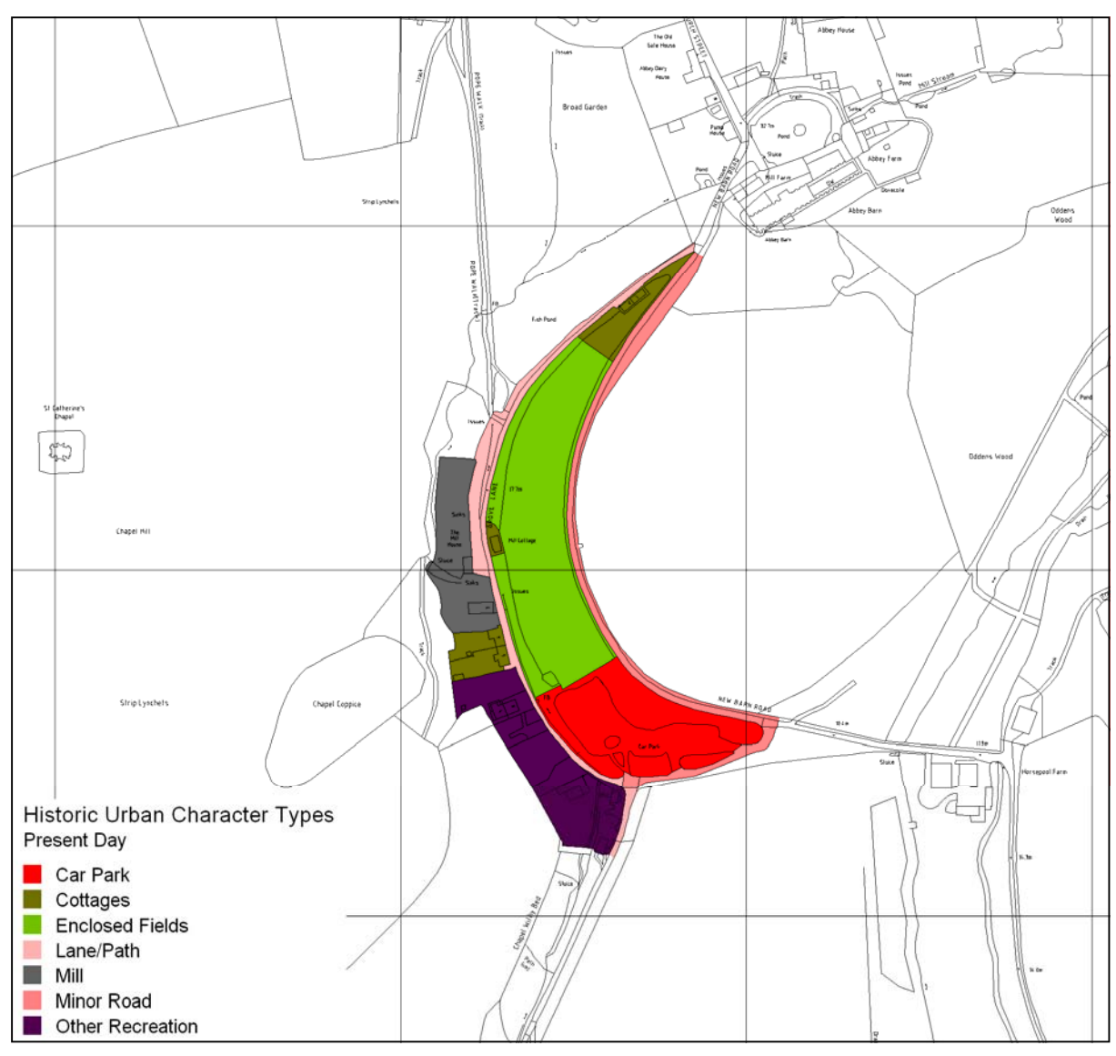
Figure 91: Map of Historic Urban Character Area 5, showing current historic urban character type.