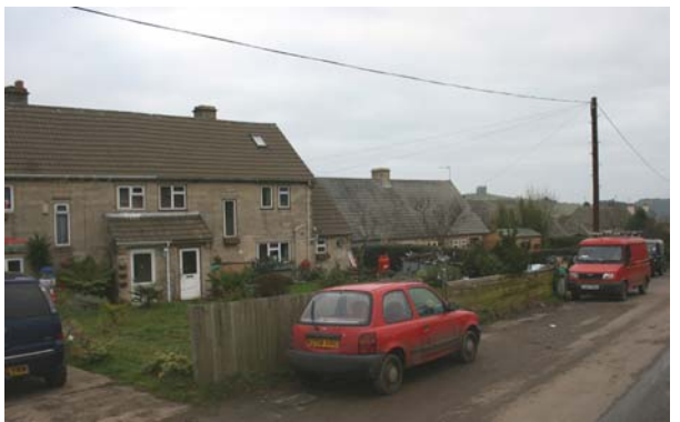
Figure 37: Modern housing along Hands Lane .