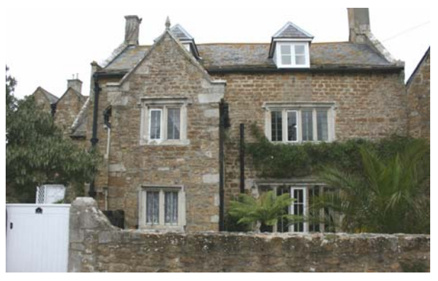
Figure 25: The Manor House (east front).

10. Abbotsbury Mill cottages. The dates of these cottages, adjacent to the mill, are not known, although they seem to be depicted on the 1814 enclosure award map. Some are certainly estate workers cottages and others may represent industrial cottages associated with the mill.