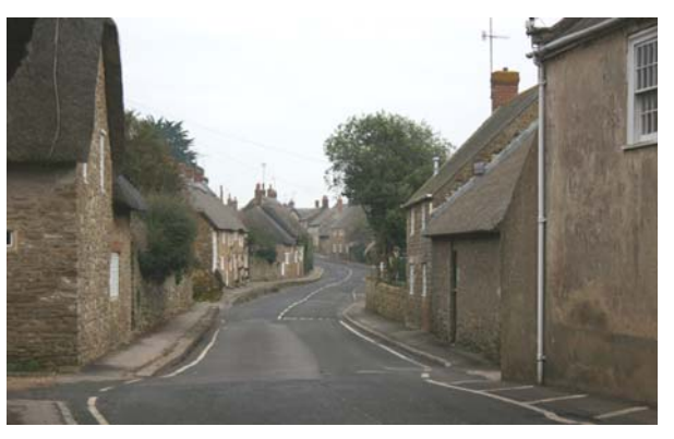
Figure 26: View east along West Street.