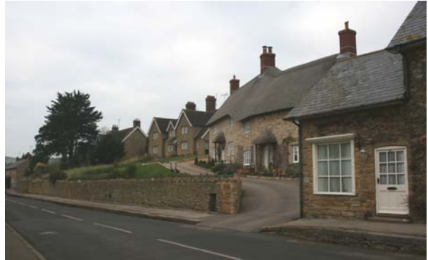
Figure 35: Modern housing development, Chapel View, West Street.