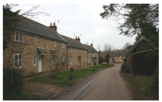
Figure 33: Modern houses on Back Street .