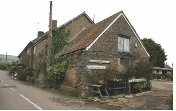
Figure 28: East Farmhouse, Rosemary Lane.