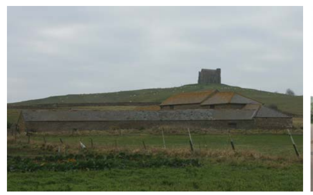
Figure 24: View of Furlong's Homestead with St Catherine's Hill behind.