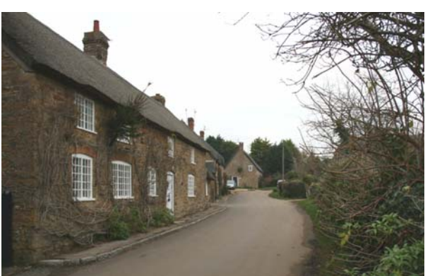
Figure 27: View east along Back Street.