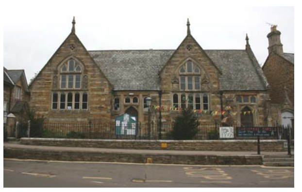
Figure 30: Former School, now Strangways Hall.