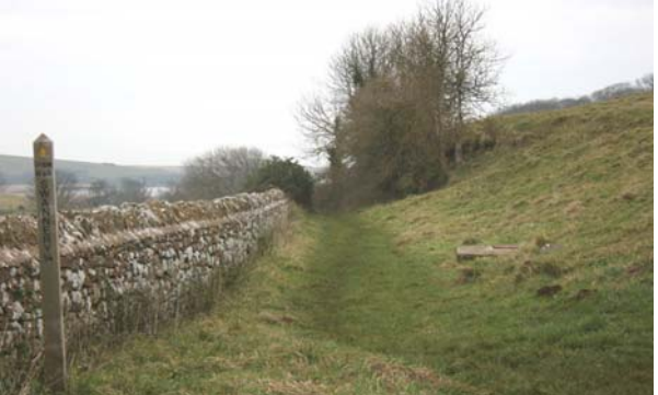
Figure 21: View south along Rope Walk.