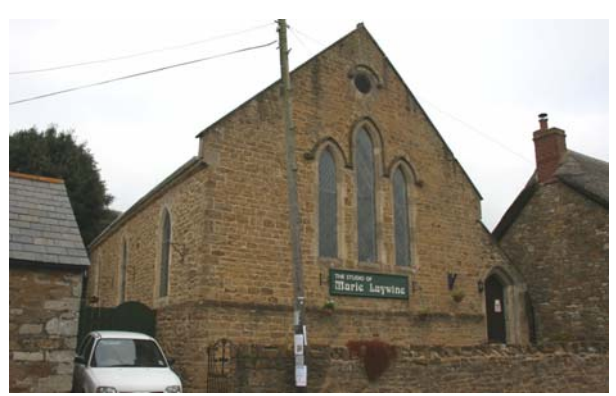
Figure 32: The Old Chapel, Back Street.

11. East Farm housing estate (Figure 37) . This area contains the vast majority of modern development in Abbotsbury. Initially a row of semi-detached houses were built fronting on to the south side of Hands Lane in the mid-late 20<sup>th</sup> century. Further development in the form of culs-de-sac occurred in the late 20<sup>th</sup> century.