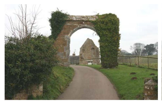
Figure 20: The Manor gate arch with view of The Pinion End beyond.

1. Abbotsbury Farm and Manor. The loss of the core buildings of St Peter's Church and cloisters following the dissolution greatly affected the layout of the former precinct area. The result was three surviving groups of buildings: Abbey House (Figure 23), Great Barn (Figure 12) and the Old Gatehouse (Figure 17), separated by isolating spaces enclosed with stone walls. The Manor House (Figure 25) at the north end of Church Street is a 16<sup>th</sup> century building west of the parish church and may have been built as part of the Strangways mansion complex to the east of the church. The vicarage wasn't added until the early 19<sup>th</sup> century. The Abbey Barn became the focus for a new farm with numerous ancillary structures built around it. The farmhouse, Abbey House,