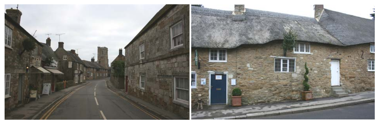
Figure 18: View south east along Market Street.

18<sup>th</sup> century documents, such as Dorset militia ballot lists, reveal that the most common trades among men aged 18-50 at that time in Abbotsbury were husbandry and fishing. Abbotsbury also had two cordwainers, three weavers, a