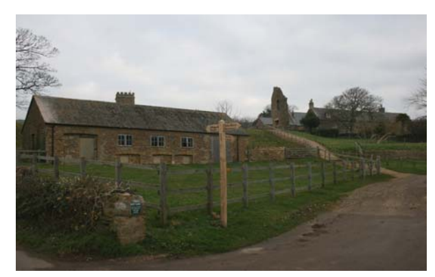
Figure 23: Abbey Farm piggery with Abbey House in the background.