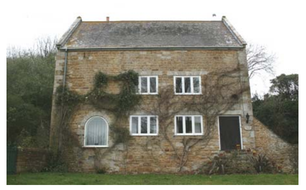
Figure 29: Abbotsbury Mill, Grove Lane.

2. Rodden Row and Market Street. This area has changed little since the mid 19<sup>th</sup> century. The school (now Strangways Hall) was built on the north side of the market in 1858. The NE quarter of the Saxon town remained undeveloped until the late 20<sup>th</sup> century when modern houses were built here, fronting on to the south side of Back Street (Figure 33).