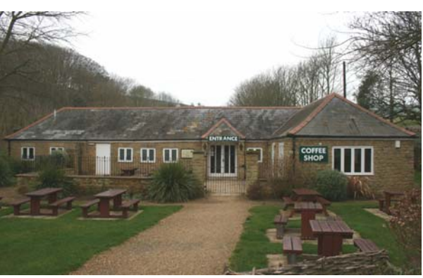
Figure 36: The Old Pheasantry Kennels, Grove Lane.