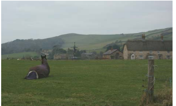
Figure 34: The Furlongs, West Street.