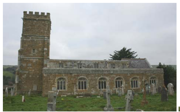
Figure 9: St Nicholas' Parish Church, Abbotsbury (south front).

The main plan components of the early postmedieval town are shown on Figure 11 and are listed below.