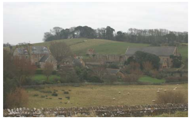
Figure 14: View of the southern part of the monastic precinct from Chapel Lane.