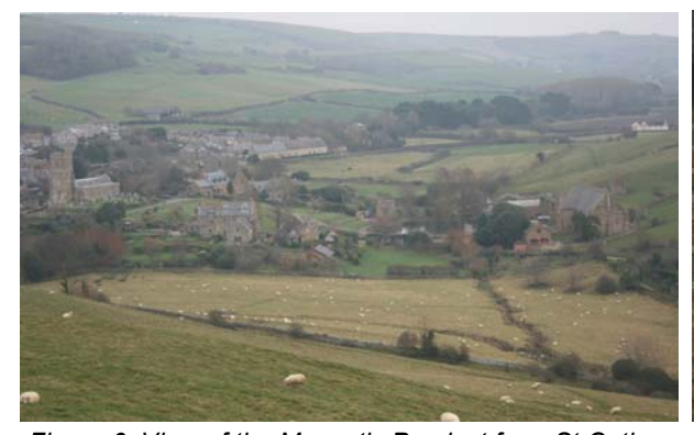
Figure 6: View of the Monastic Precinct from St Catherine's Hill

There are no contemporary documents or dateable archaeological remains that can help describe the Saxon town layout. However, it is assumed that the Saxon monastery was on the site of the medieval monastic precinct (Figure 6) and that the town lay adjacent to it on the north side. Furthermore, the topography of the modern village suggests that there was a preexisting grid of lanes and fields running E-W and N-S and that the Saxon town was fitted into this pattern. Morris has identified a rectilinear field system to the east of Abbotsbury of potentially Roman or Saxon origin (Morris 2002, 88) and the Abbotsbury alignments may represent a westward extension of this system. The Saxon settlement thus fitted into the preexisting rectilinear pattern of lanes has a 'ladder' form of a type identified at other late Saxon towns and villages such as Cheddar, Shapwick and North Cadbury (all in Somerset). Saxon Abbotsbury then, is likely to have comprised a double row of houses fronting on to both sides of Rodden Row (Figure 8). This road probably continued westwards along the line of the lane behind the Ilchester Arms. These properties are likely to have backed on to Back Street and another lane along the line of the current church path, which also marked the northern boundary of the Abbey precinct.