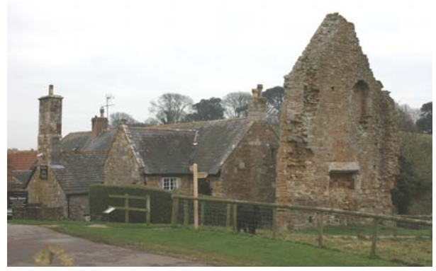
Figure 15: View of The Pinion End and Abbey House.