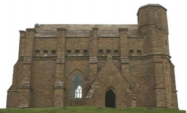
Figure 10: St Catherine's Chapel (south front).