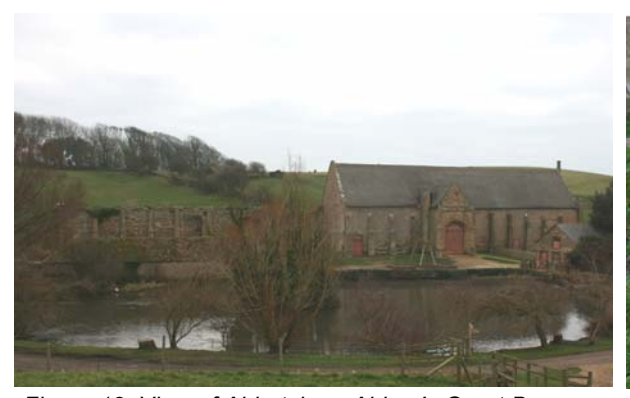
Figure 12: View of Abbotsbury Abbey's Great Barn.