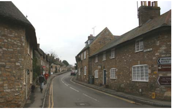
Figure 7: View east along Rodden Row.