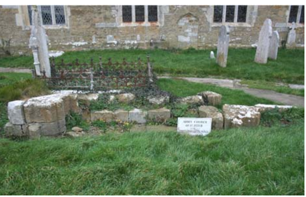
Figure 16: The exposed part of the north aisle north wall of St Peter's Abbey church.