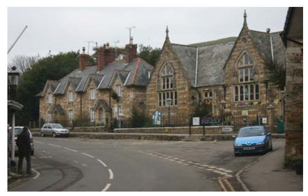
Figure 13: View of the Market Place.