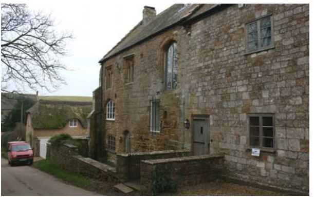
Figure 17: The Old Gate House.