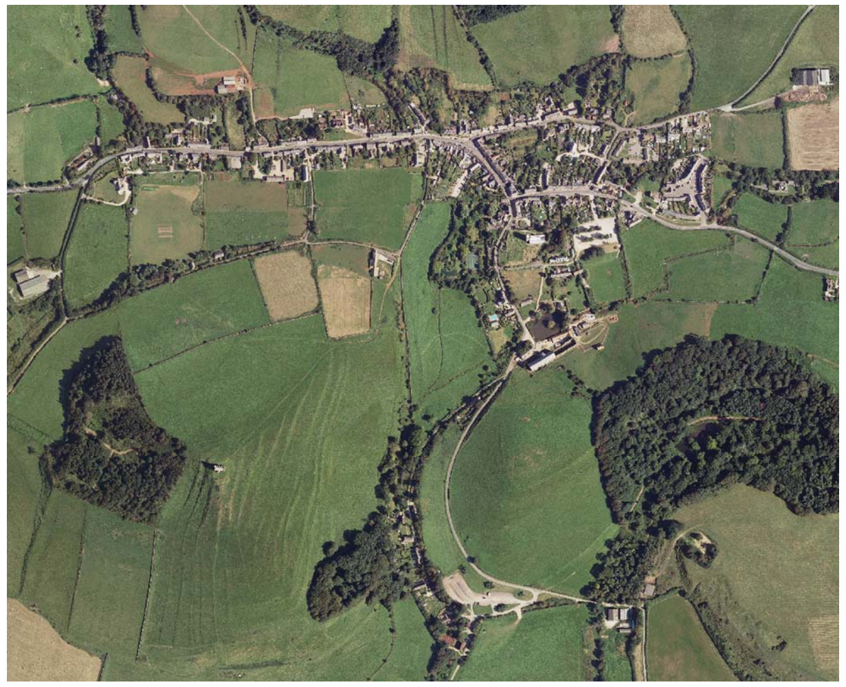
Figure 1: Vertical aerial photographic view of Abbotsbury, 2005.

existing tracks that dictated the layout of the late Saxon town.