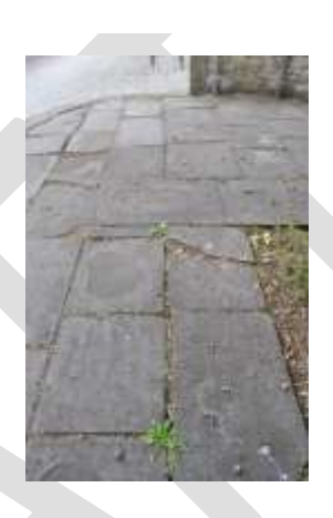
Gillingham Town Bridge