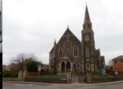
The Methodist Church