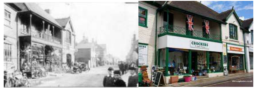
Crocker's Hardware Shop