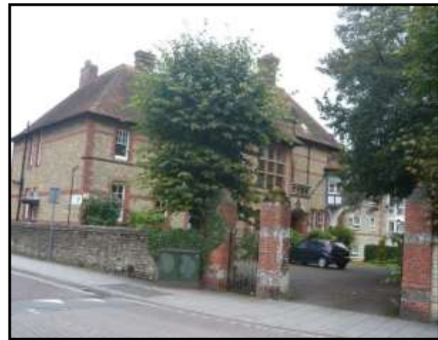
5.5 Vic ara ge Sc ho ol Ro om s

The Vicarage Schoolrooms are situated in Queen Street and are today used by various local community groups. Activities held in the schoolrooms include a Sunday School, a playgroup, bingo and coffee mornings. The Schoolrooms are probably mid C19 though possibly incorporate earlier work. They are built of coursed rubble, tiled roof with stone slate verges, gabled left and half-hipped right with a brick stack left of centre. The schoolrooms are single storey, long range with two windows and door to left, 3-lightsquare-headed windows with 'Perpendicular' tracery and returned labels and between is a 2-centred studded C19 plank door. The schoolrooms are a prominent and well used feature of the Conservation Area and compliment the neighbouring properties.