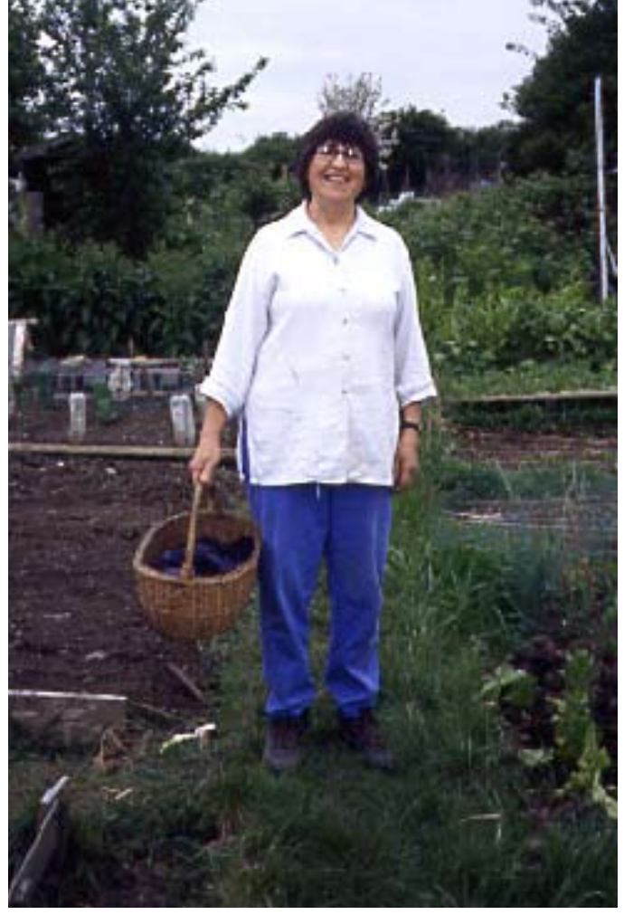
Allotments: a plotholder's guide Revised Edition, June 2007. Published by ARI for DCLG