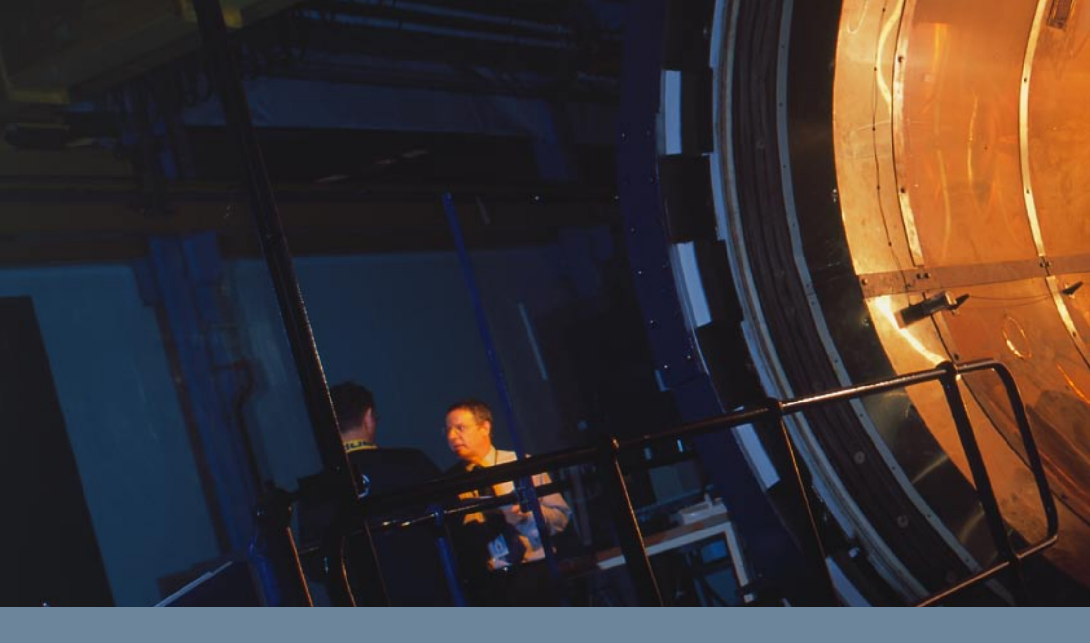
South West England