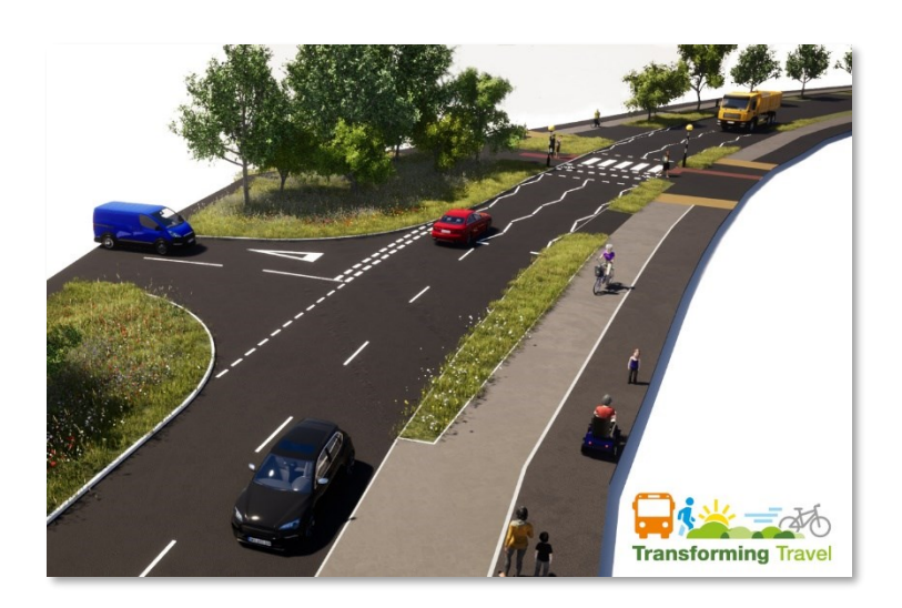
Above, image of the Leigh Road cycleway