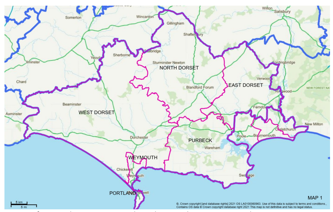
MAP 1 – former administrative area boundaries within Dorset Council.