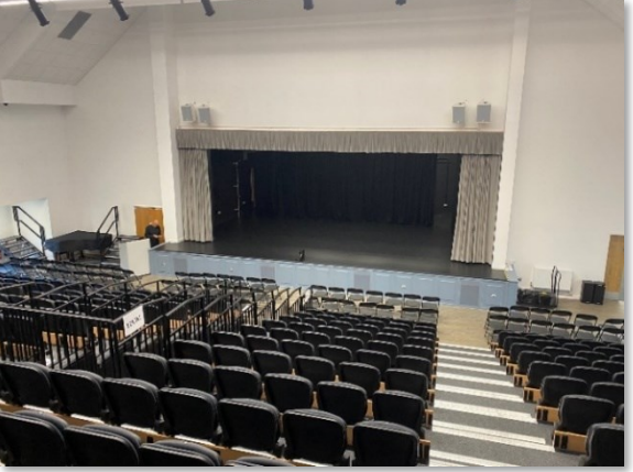
Above, pictures of the completed new theatre facilities (Corn Exchange, left, Thomas Hardy, right)