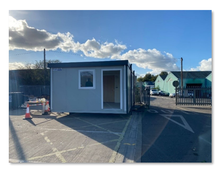
Above, picture showing the newly installed welfare facility at Louds Mill Household Recycling Facility.