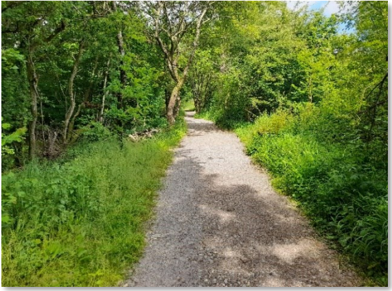
Above, pictures showing the newly laid surface along the old railway line.