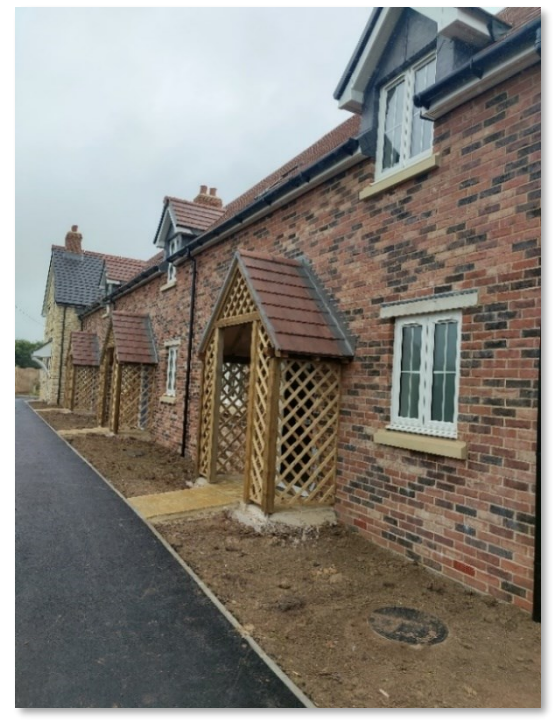
Above, pictures of the completed affordable homes in Holwell