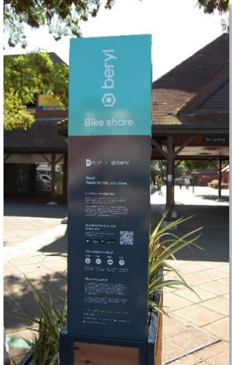
Above, pictures at the launch of the bike sharing scheme