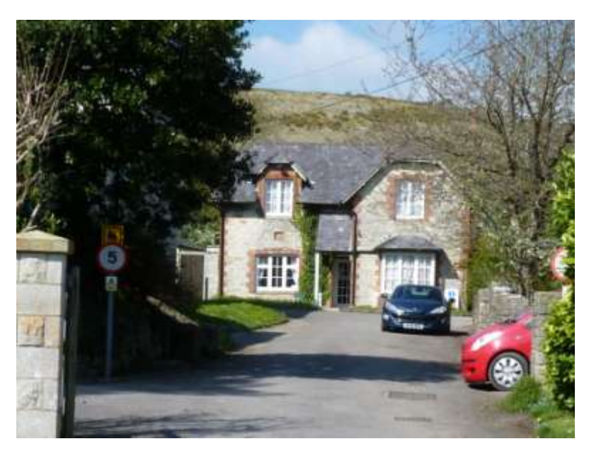
Upper Mill house, now used as Wessex Water office building