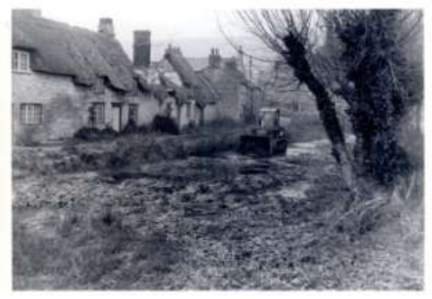
About 1950, with centre cottages in ruin