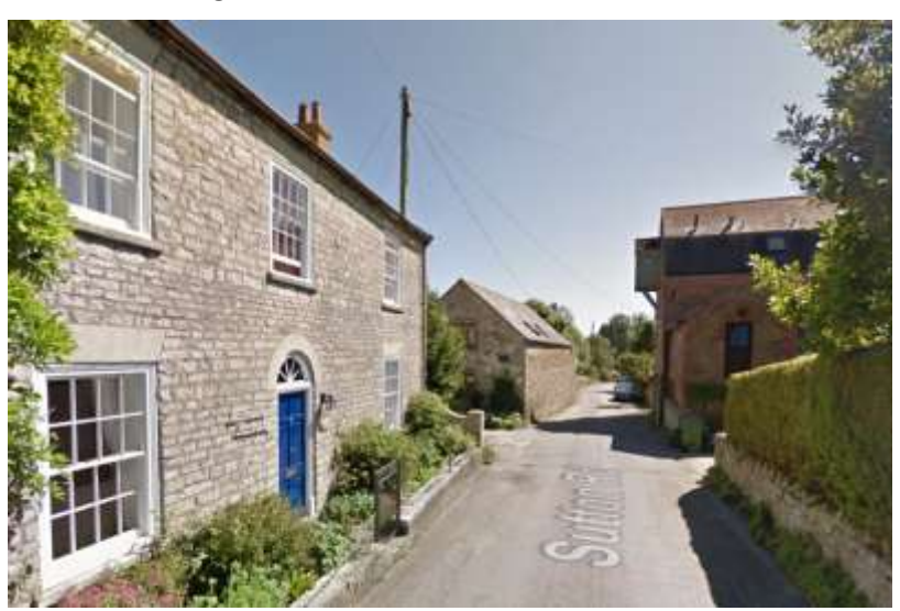
Northdown Farmhouse, with Court House and Sutton Mill beyond (2016 photo by Google StreetView)

The outbuilding was thatched until a fire in the first decade of the 20<sup>th</sup> Century (which caused extensive damage to several buildings along the street including the Court House); since around then its roof has been of corrugated asbestos.