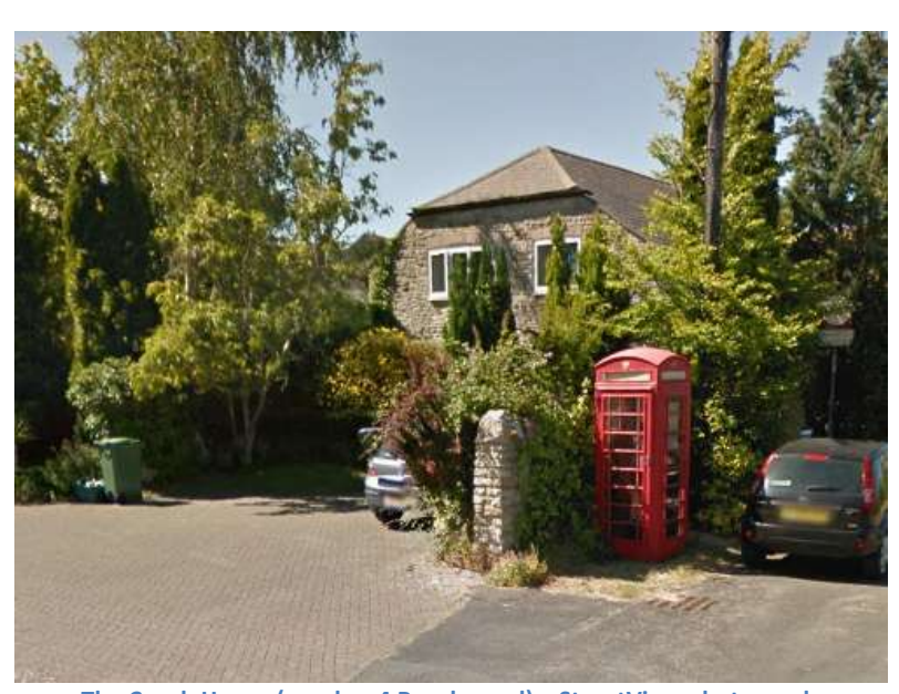
The Coach House (number 4 Brookmead) – StreetView photograph

The Waterworks office building (this was the Upper Mill house, and is probably late 18th C; it was may perhaps have been the model used by the artist who drew the cover illustration for the 1st Edition of Hardy's Trumpet Major). Other Waterworks buildings are noted by <a href="http://www.heritagegateway.org.uk">http://www.heritagegateway.org.uk</a> as non-designated.