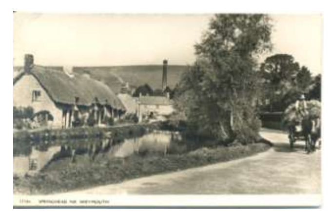
Cottages by pond, circa 1920, with Waterworks chimney beyond

There has been a row of cottages in this location as far back as records can take us. The Listed Buildings descriptions suggest an early 18<sup>th</sup> C date for number 101, and a 19<sup>th</sup> C date for the others but incorporating earlier material. These are modest size labourers cottages, and will have been modified many times in the past as families grew and divided, so dates are inherently difficult to establish. There may have been a pub called the Spring Bottom in this row at one time.