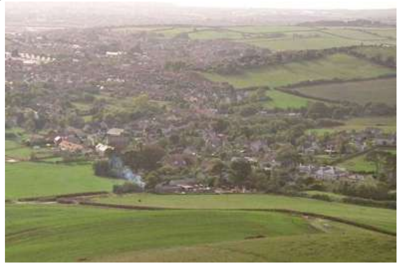
View of village from White Horse (photo from 1999 Village Survey)

The Osmington White Horse (MDO1820), a chalk cutting of King George III on horseback, is on the ridge just outside the Neighbourhood Area, but overlooks both Sutton Poyntz and Osmington. Sutton Poyntz is an important part of the setting for this monument. There are some nearby bowl barrows (MDO1821 to MDO1825) just outside view of the village.