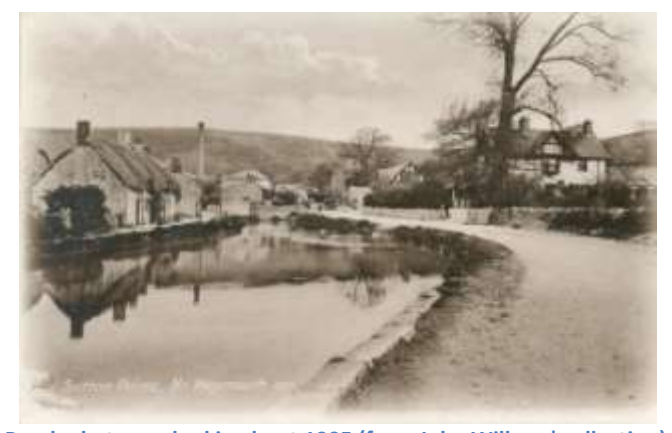
Pond, photographed in about 1905

The pond is very much the heart of the village, and a popular site for visitors and holidaymakers. It was of course the headwater for Sutton Mill, but has shrunk steadily over the last 100 years or so, particularly on the road side where wide banks with willow trees have been established. The pond was not shown in the 1790's Weld Estate Map, suggesting the old mill would have had an undershot wheel; it is likely therefore that the pond was created when the present Mill was built in around 1812.