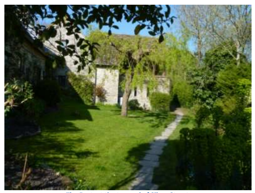
The Rest, at the top end of Silver Street

Prospect Cottage in Plaisters Lane. A cottage on this footprint is shown in the Tithe map, and also in the earlier Weld Estate survey map. Old Ordnance Survey maps show Sutton Poyntz's chapel as having been in this area, but there does not seem to be good evidence for this. The present structure is probably late-19<sup>th</sup> C. Prospect Cottage was divided and enlarged in 1990, with the larger and older part being renamed Prospect House. The original front door opening straight onto the road was presumably blocked up at this time. This house was at one time the home of the Harrison family – wheelwrights, carpenters and builders in Sutton Poyntz since about 1880.