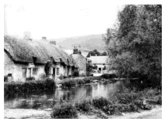
Sutton Poyntz mill pond and cottages