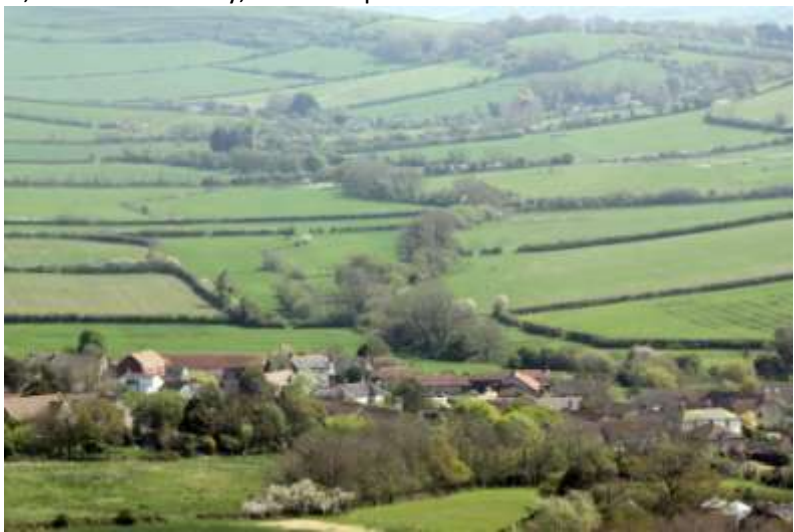
View of village and valley beyond, from Chalbury Hill-fort

Chalbury and Rimbury; these form the western arm of the circle of hills surrounding Sutton Poyntz, and look straight down to the village in the east. Chalbury (MDO309) is a hillfort, containing several bowl barrows (MDO306, MDO 307) as well as later pottery finds (MDO310, MDO311); we understand the hillfort dates initially to around 800BC, which makes it rather older than Maiden Castle. Rimbury (MDO6647) was the site of an excavation documented by Charles Warne in his book "Celtic Tumuli of Dorset" (1866); Mr Warne and other "antiquarians" were brought in by the landowner to rescue burial urns that were being used as targets for stone throwing contests by the local agricultural workers (annoyed that the urns they had found contained nothing more valuable than ash and bone). Frustratingly Charles Warne does not give a date for this. Lord Abercromby's later theory that this burial ground and another in Dorset must represent a foreign cultural incursion is completely discarded now, but the term he gave to that culture, Deverel-Rimbury, is still in quite common use to describe a local sub-culture.