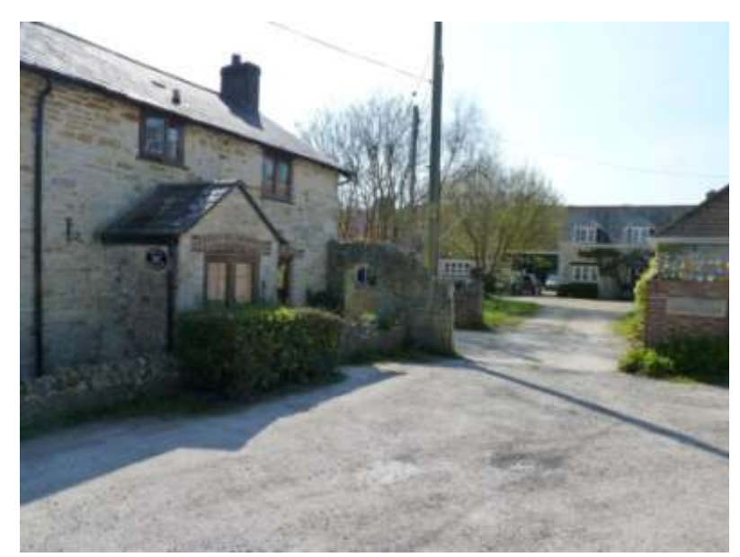
The Old Dairy House in Puddledock Lane, with The Puddledocks in background

A group of cottages along Silver Street (Ebenezer Cottage, Albert Cottage, Rose Cottage, No 3, and The Rest). Cottages in these locations are shown (along with other small cottages since disappeared) in the Tithe map. The Rest was originally two quite significant cottages, set in about half an acre and is said to have been referred to in a 17<sup>th</sup> C document. No 3 also had a reasonably large garden, but the other cottages were smaller, and set in a terrace. The present structure of these cottages is probably in the main late 19<sup>th</sup> C, although The Rest in particular may preserve some older structure. Nevertheless, these cottages all form an important component of the context for the group of Listed Buildings (Laurel Cottage, Blue Shutters, Sutton Mill and Sutton Mill House) in the same area.