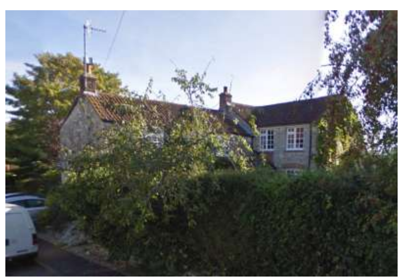
The Cottage, also in Puddledock Lane (StreetView photo)