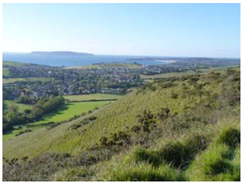
View down from near Northdown Barn on ridgeway

The Osmington White Horse (MDO1820), a chalk cutting of King George III on horseback, is on the ridge just outside the Neighbourhood Area, but overlooks both Sutton Poyntz and Osmington. Sutton Poyntz is an important part of the setting for this monument. There are some nearby bowl barrows (MDO1821 to MDO1825) just outside view of the village.