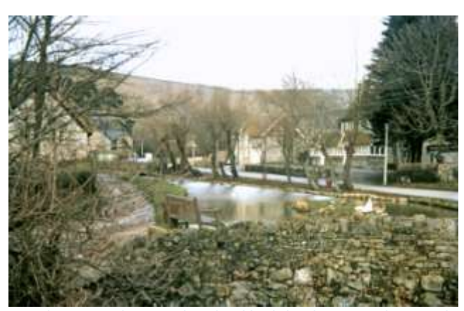
Pond in 1969, showing the island built by the Borough Council