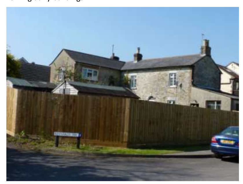
Chipps Cottage, in Puddledock Lane

both the Tithe Map and the Estate survey map. The development known as The Puddledocks is recent, but preserves the layout (and a little of the material) of the working dairy buildings.