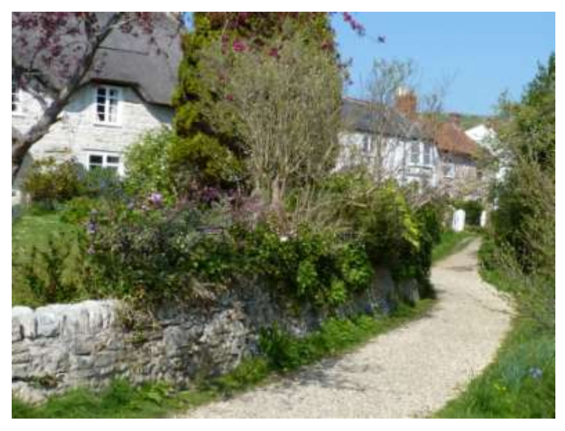
Terrace of cottages in Silver Street, next to Laurel cottage

A group of cottages along Silver Street (Ebenezer Cottage, Albert Cottage, Rose Cottage, No 3, and The Rest). Cottages in these locations are shown (along with other small cottages since disappeared) in the Tithe map. The Rest was originally two quite significant cottages, set in about half an acre and is said to have been referred to in a 17<sup>th</sup> C document. No 3 also had a reasonably large garden, but the other cottages were smaller, and set in a terrace. The present structure of these cottages is probably in the main late 19<sup>th</sup> C, although The Rest in particular may preserve some older structure. Nevertheless, these cottages all form an important component of the context for the group of Listed Buildings (Laurel Cottage, Blue Shutters, Sutton Mill and Sutton Mill House) in the same area.