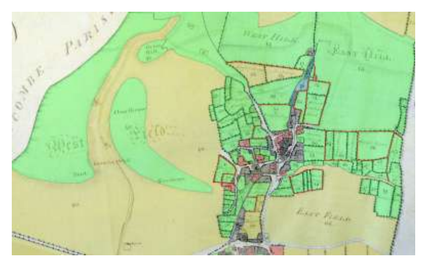
Extract from 1790's Weld Estate survey map, highlighting ancient field boundaries

The maps also show areas of orchard, in red. Orchards were extensive, particularly in the 1830's; however there do not seem to be any areas marked then as orchard that have been preserved as such. Later on, market gardens became important in Sutton Poyntz, but there is little or no evidence of these now.