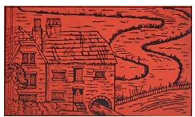
Cover picture from 1st Edition of Hardy's Trumpet Major