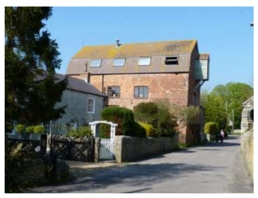
Sutton Mill, with Sutton Mill House in foreground

Sutton Mill was occupied and run as a working mill until 1981. Like the Mill House next door, this building had suffered severe structural degradation, in this case mainly because the weight of the roof was more than the walls could stand. A roof was replaced with one of lighter construction, and a steel frame was added inside to support the old walls, and another important building was happily restored. Milling was no longer economic, and the building has been occupied since its restoration as a dwelling; the milling machinery was largely unhung, but is still kept on site.