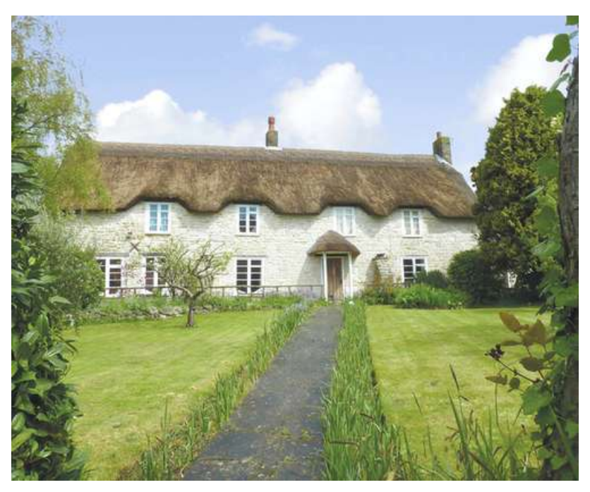
Laurel Cottage, viewed from the junction of Plaisters Lane and Silver Street

This cottage, at the corner of Silver Street and Plaisters Lane, is given as 18^{th} or early 19^{th} Century according to the Listed Buildings description; however while the Tithe map just before 1840 seems to show this building, the Weld Estate survey from just before 1800 shows a smaller building to a slightly different alignment, so a 19^{th} C date is more likely. The Tithe survey showed this building as the village Poor-house. The main structure is a long single depth 2-storey cottage of rubble construction, with 4 low buttresses against the front wall. The existence of the buttresses caused some excitement in the past as evidence of this having been the lost Sutton Poyntz chapel. Hutchins adds confusion by saying that the site of the chapel was occupied by a poor-house "till it was pulled down on the alteration of the poor law", but clearly the poor-house that is now Laurel Cottage was not pulled down. In any case the orientation of Laurel Cottage is too far from true east for it to be the chapel, and a much better candidate has been revealed by excavations near the Waterworks. The Listed Buildings description notes that Laurel Cottage's interior has been modified but "remains representative of vernacular cottages in the village".