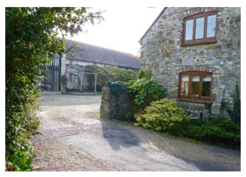
Northdown Farmyard building conversions, with Court House in foreground, and main barn beyond

In addition, set back from the road, is a long and significant barn which together with the wall between it and the farmhouse is listed. This building was used as cow sheds while the farm was still worked, and has now been converted into two dwellings, Overcombe Barn and Upwater Barn, which together maintain the old barn structure. The conversion preserved the rubble-construct walls and the attractive tile roof, and also some narrow window-lights high in the front wall.