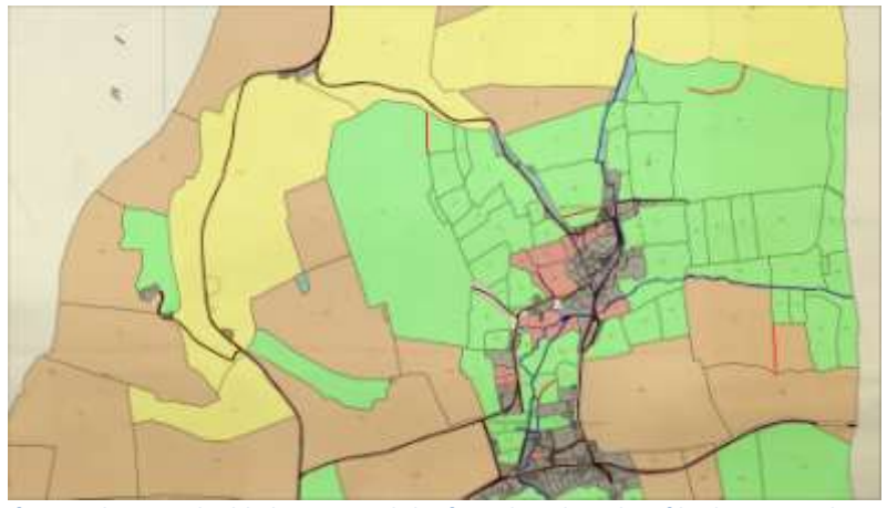
Extract from Tithe map, highlighting in red the four short lengths of hedge created since then