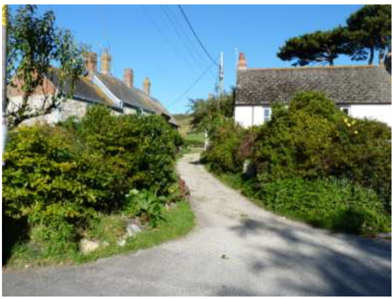
Springfield Cottage, Fox Cottage and South View, with view of ridgeway behind

• Two working buildings and one dwelling near "the fork" (the junction between Sutton Road and Plaisters Lane). The Cart Shed was probably precisely that although old surveys and maps do not help to establish use. This building and 84 Sutton Road next door occupy a site that was already in use in 1790's, as shown by the Weld Estate survey. Across the road is the old barn, now The Coach House in Brookmead, which is one of a group of Sutton Farm agricultural buildings along the old line of Puddledock Lane shown in the 1838 Tithe Map. The Cart Shed houses the village's Victorian letter box.