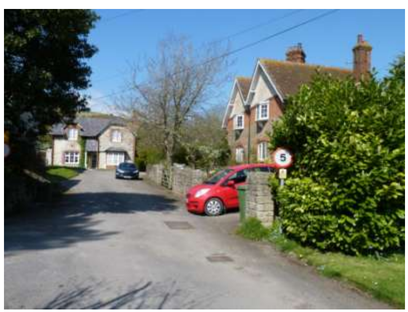
Waterworks Cottages, with Upper Mill House in background