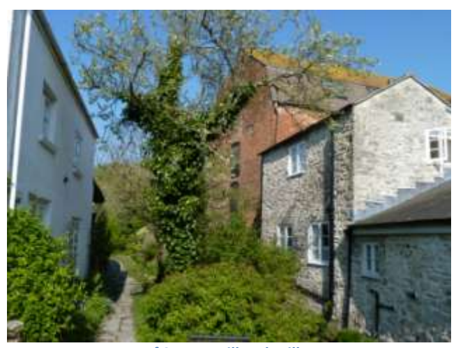
Rear of Sutton Mill and Mill House taken from Silver Street