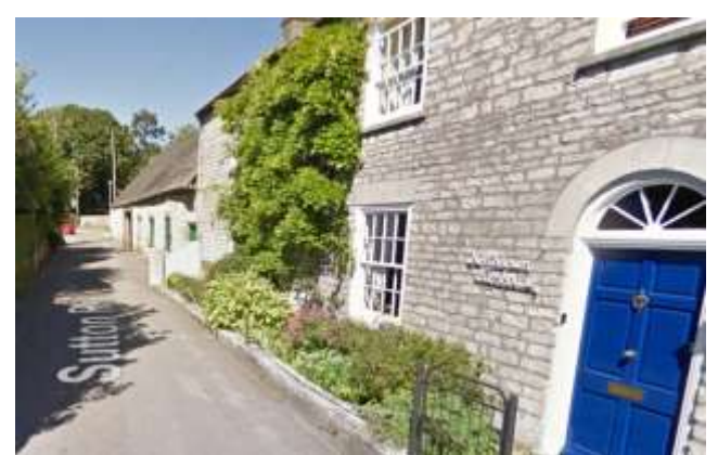
Northdown Farmhouse from south, with agricultural outbuilding beyond (2016)