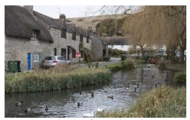
Modern view of cottages by pond