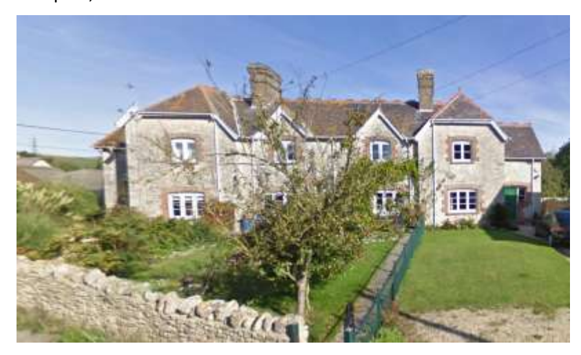
Puddledock Cottages (Streetview photo)

Puddledock Cottages and Waterworks Cottages are two sets of late Victorian cottages. From the plaque on the building, Puddledock Cottages were built in 1890, presumably for senior agricultural workers. Waterworks Cottages are slightly later, 1900 from an architectural plan, and were built for senior Waterworks workers.