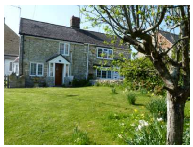
1 and 2 Myrtle Cottages, with the so-called Village Green in front

speculative. There was at one time also a small cottage on the "village green" in front of Myrtle Cottages, and another on the land later known as the Springhead Car Park (and still later known as "Top of the Pond").