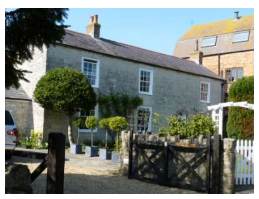
Sutton Mill House – the beautiful front, with Sutton Mill beyond

The building is built over water tunnels from the Mill itself, and undermining had left the house in a severe structural state, but happily this beautiful house was very successfully rescued in 1992.