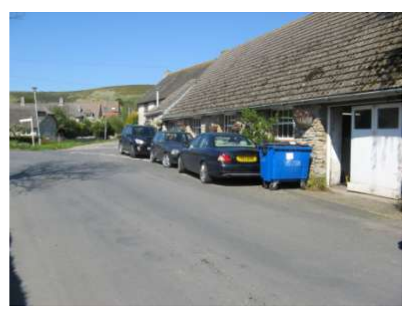
The Cart Shed (motor works), with 84 Sutton Road beyond