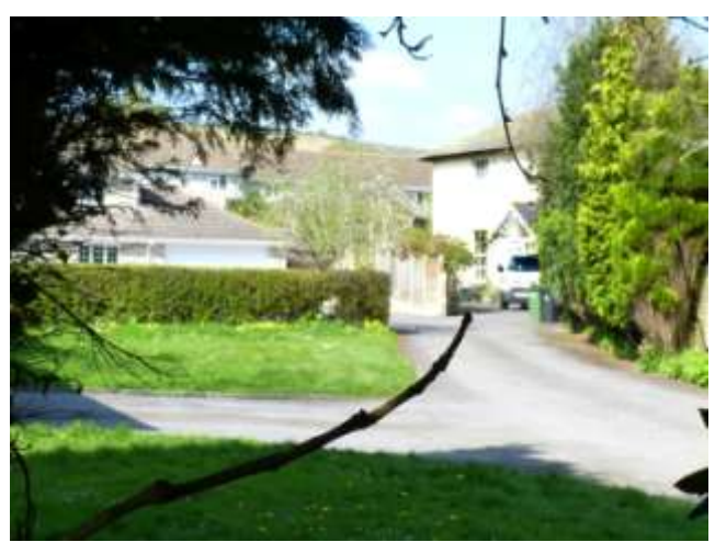
The only view from the road of the main entrance of the farmhouse, showing how the setting is affected by modern houses