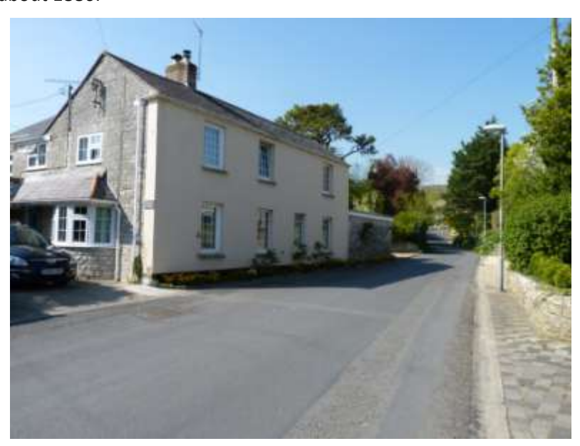
Prospect House (formerly Prospect Cottage) in Plaisters Lane

Prospect Cottage in Plaisters Lane. A cottage on this footprint is shown in the Tithe map, and also in the earlier Weld Estate survey map. Old Ordnance Survey maps show Sutton Poyntz's chapel as having been in this area, but there does not seem to be good evidence for this. The present structure is probably late-19<sup>th</sup> C. Prospect Cottage was divided and enlarged in 1990, with the larger and older part being renamed Prospect House. The original front door opening straight onto the road was presumably blocked up at this time. This house was at one time the home of the Harrison family – wheelwrights, carpenters and builders in Sutton Poyntz since about 1880.