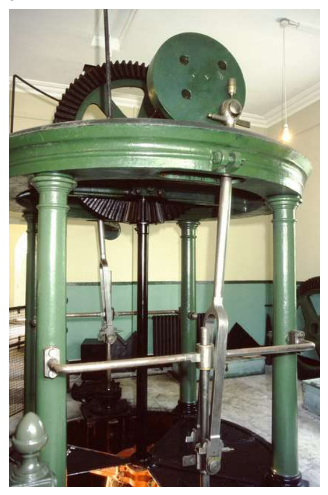
The 1857 turbine-driven water pump, manufctured by D Crook of Glasgow

This is listed partly for the Hawksley building, but largely for the (perhaps now unique) water pump that the building houses.