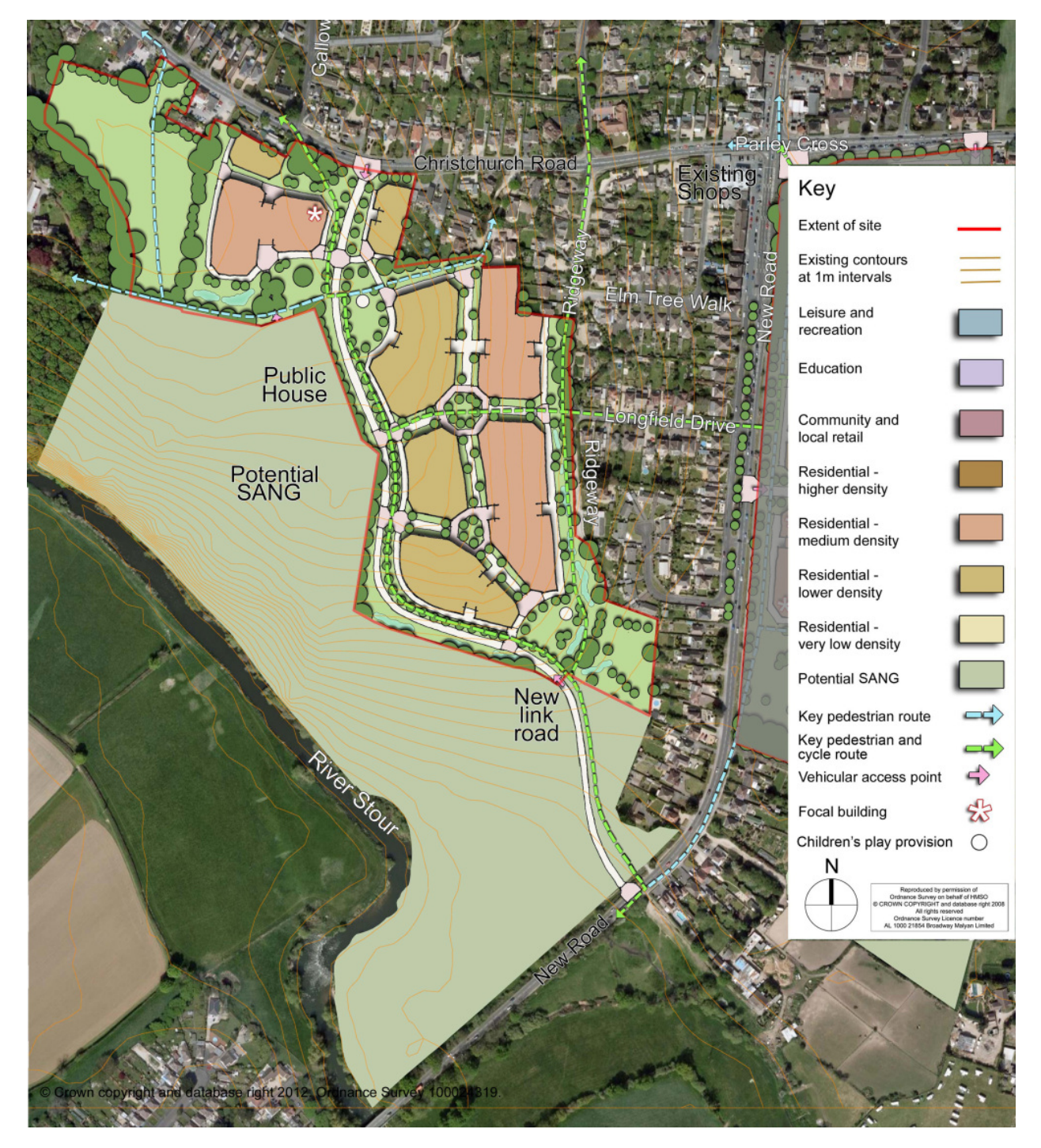
Map 10.10 West of New Road New Neighbourhood, West Parley

10.40 These policies will be delivered by: