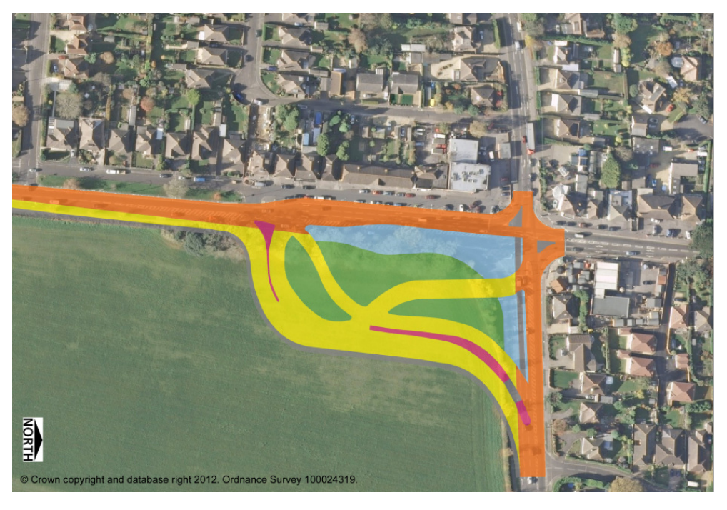
Map 10.7 Previously suggested transport solution

10.33 The local community and Council are left with a difficult choice. The allocation of New Neighbourhoods gives the opportunity to reorganise traffic movements and alleviate congestion at the Crossroads, but results in a significant change to the built character of the area. If New Neighbourhoods are not allocated, traffic alleviation will have to rely upon public funds and alternative solutions. Previous assessments of the Crossroads have identified that limited congestion alleviation can be provided if a gyratory system were to be built which would expand the road dominated area to 90 metres wide. This would simply be a traffic alleviation solution which would significantly increase the highways area and lead to further deterioration of the urban environment. Additionally, due to funding shortfalls it may not be implemented in the 15 year lifetime of the Core Strategy, leaving the residents of the area with a deteriorating situation.