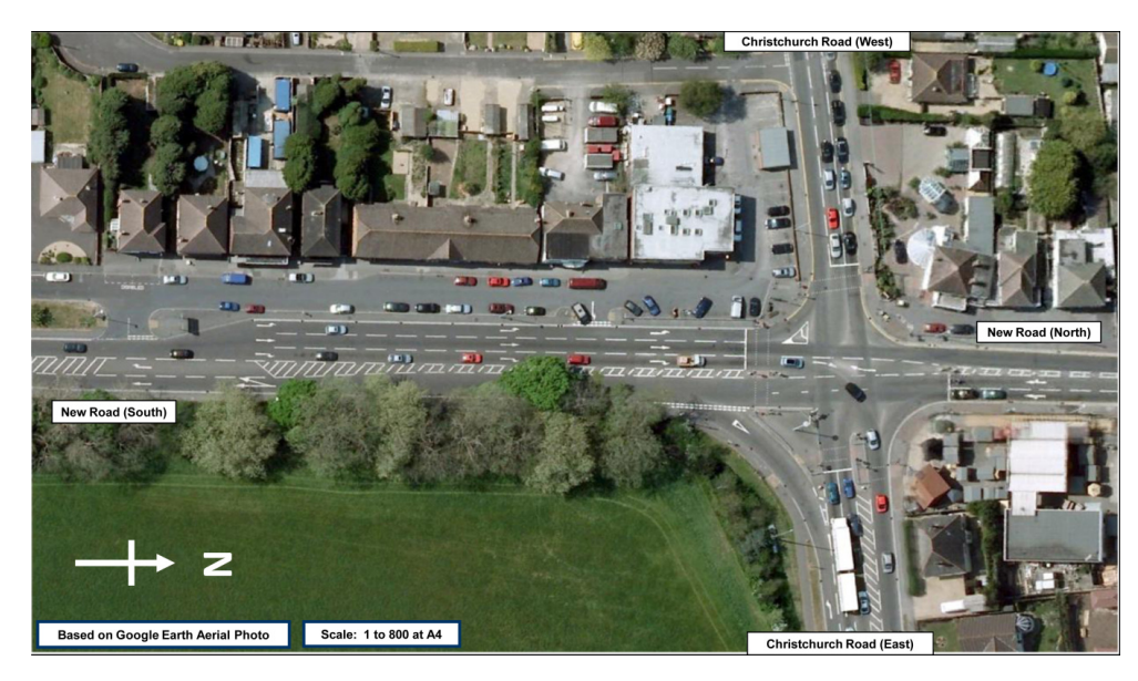
Map 10.6 Parley Cross

10.33 The local community and Council are left with a difficult choice. The allocation of New Neighbourhoods gives the opportunity to reorganise traffic movements and alleviate congestion at the Crossroads, but results in a significant change to the built character of the area. If New Neighbourhoods are not allocated, traffic alleviation will have to rely upon public funds and alternative solutions. Previous assessments of the Crossroads have identified that limited congestion alleviation can be provided if a gyratory system were to be built which would expand the road dominated area to 90 metres wide. This would simply be a traffic alleviation solution which would significantly increase the highways area and lead to further deterioration of the urban environment. Additionally, due to funding shortfalls it may not be implemented in the 15 year lifetime of the Core Strategy, leaving the residents of the area with a deteriorating situation.