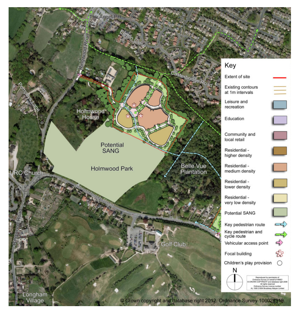
Map 10.4 Holmwood House New Neighbourhood, Ferndown