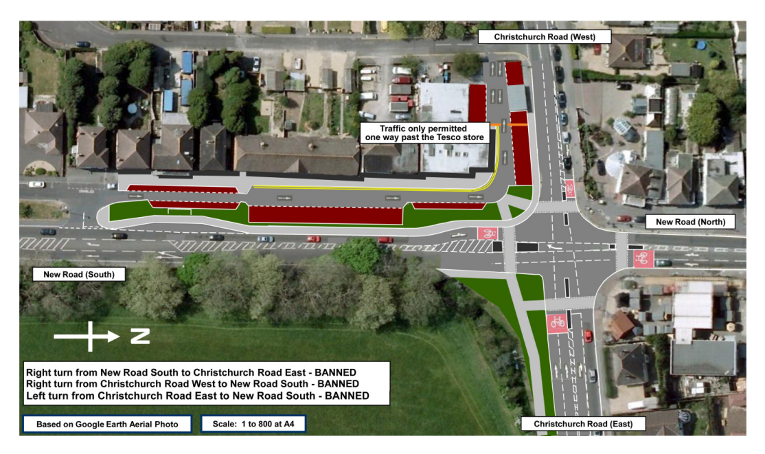
Map 10.8 West Parley Village Centre Enhancement Scheme

A major environmental enhancement of West Parley Village Centre is to be implemented to improve its vitality and viability. New public spaces, shops, services and facilities are to be provided in conjunction with wholesale changes to the Parley Crossroads and the associated service roads. This relies upon new link roads to be provided in conjunction with the New Neighbourhoods allocated in policies FWP6 and FWP7.