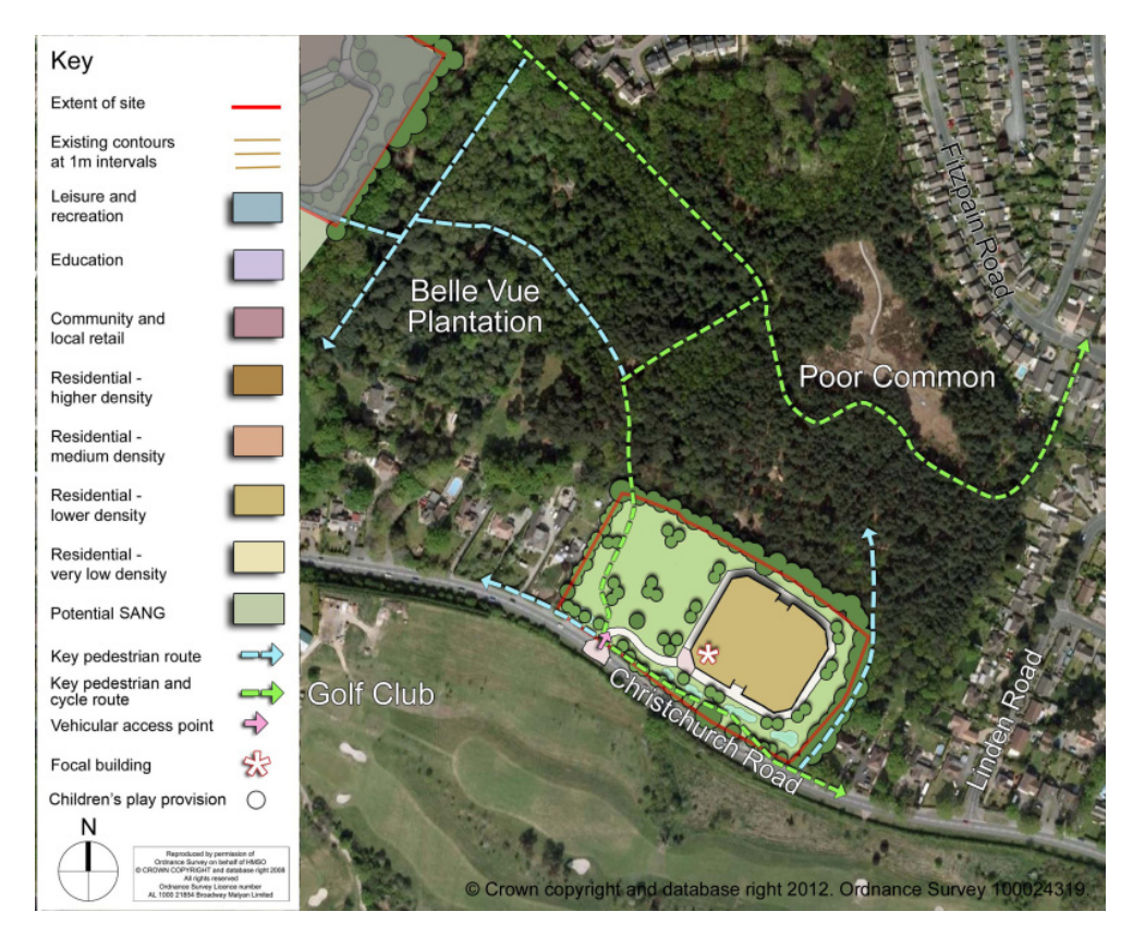
Map 10.5 Coppins New Neighbourhood, Ferndown