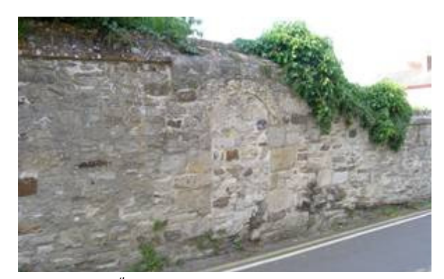
Figure 78: 12<sup>th</sup> century doorway reset in Rectory garden wall, Pound Lane