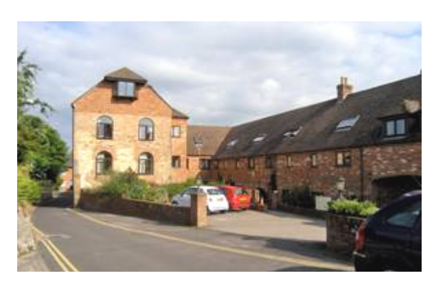
Figure 77: Old Brewery, Pound Lane.