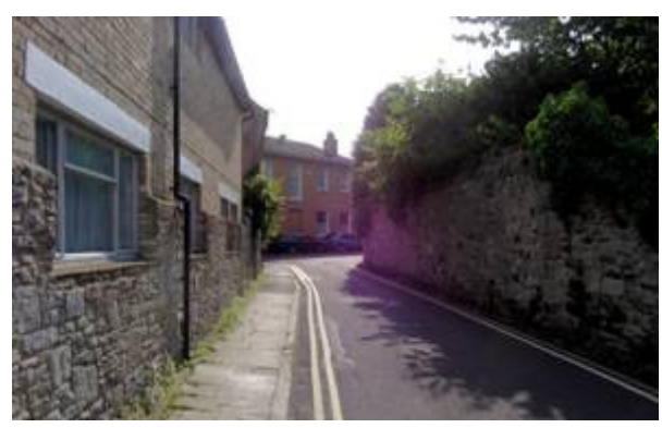
Figure 72: View along Pound Lane towards Brewery House.