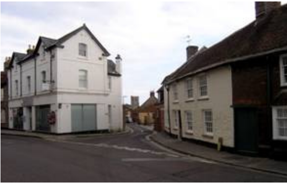
Figure 71: View down Trinity Lane from West Street.