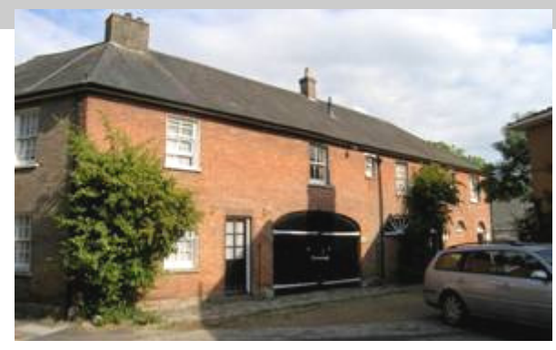
Figure 75: 16 & 18 Pound Lane.