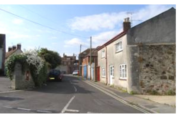
Figure 74: View along Trinity Lane from Pound Lane.