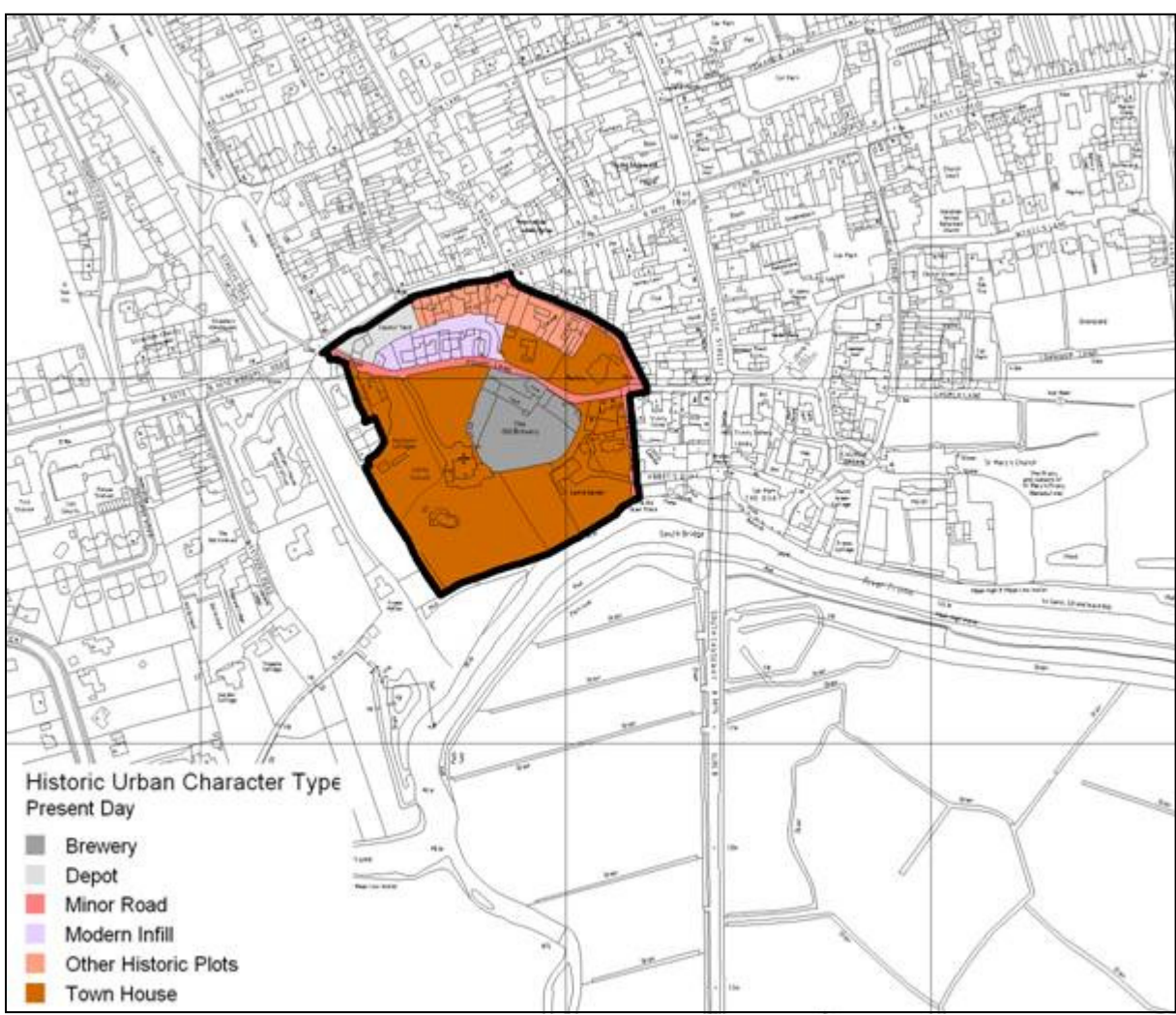
Figure 70: Map of Historic Urban Character Area 3, showing current historic urban character type.