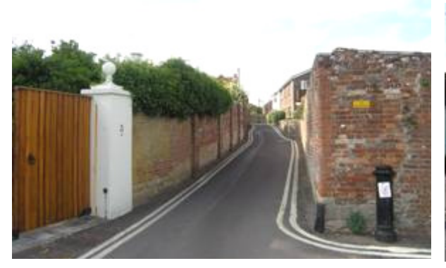
Figure 73: View up Tanners Lane from Abbot's Quay.

The settlement pattern is diverse, but much of the area comprises low density housing, set well back from the street frontage in extensive gardens. To the north, there is high density housing set directly on the edge of the street. Where the buildings are not built directly on the street, the frontage is defined by high stone or brick walls, some of which have 12<sup>th</sup> and 13<sup>th</sup> century architectural fragments incorporated, possibly derived from the castle or Lady St Mary's Church. The narrow curving lanes with their high walls give a great sense of enclosure. There is no public open space in this area and green spaces are limited to the extensive gardens of the large houses.