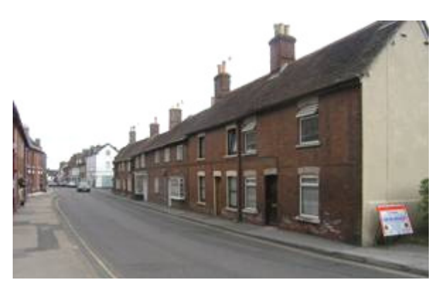
Figure 76: 33-47 West Street