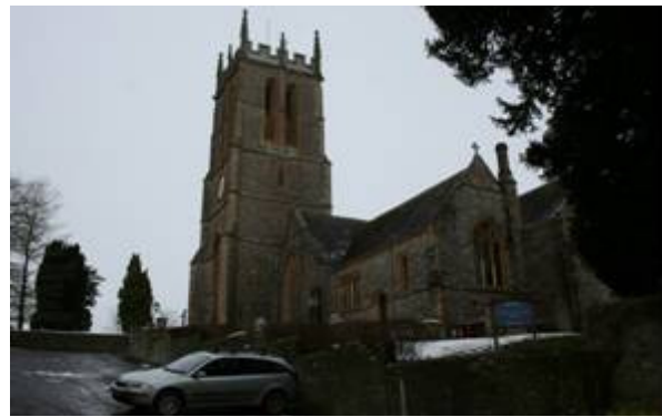
Figure 38: View of St Mary's Church from Church Hill.