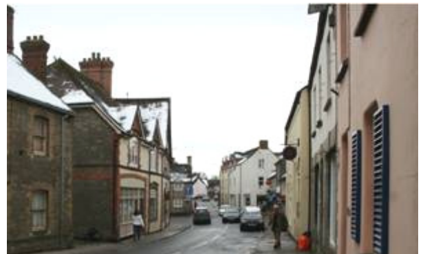
Figure 37: View south along High Street.