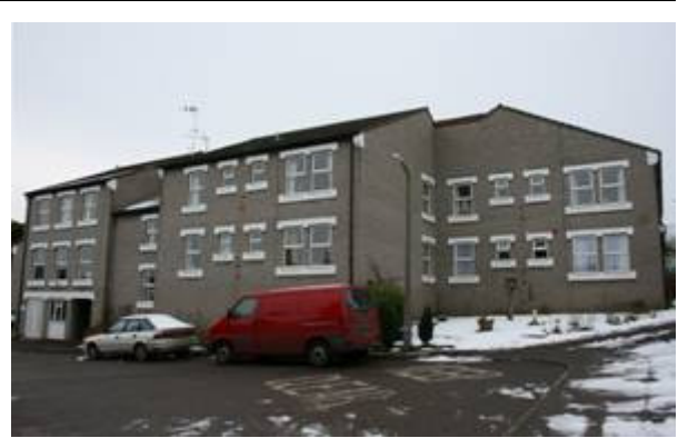
Figure 31: Knightstone Court, Silk House Barton; on the site of the former silk works.

20. Stalbridge Primary School. The school was established on its current site in the late 19<sup>th</sup> century and the core of the building dates from that time. The plot was initially small but extended during the later 20<sup>th</sup> century to include a large field at the rear. The building has also been extended in a piecemeal fashion (Figure 34).