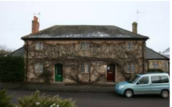
Figure 20: Numbers 5-6 Anglesey Cottages, Lower Road.