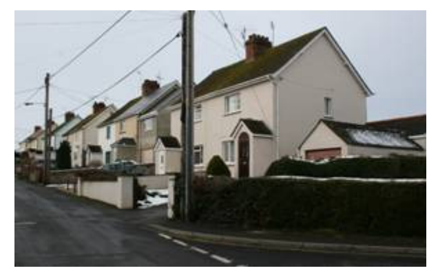
Figure 32: View west along Grosvenor Road.