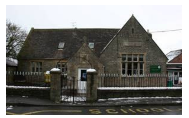
Figure 34: Stalbridge Primary School, Duck Lane.