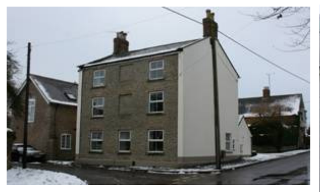
Figure 23: Barrow Hill House.