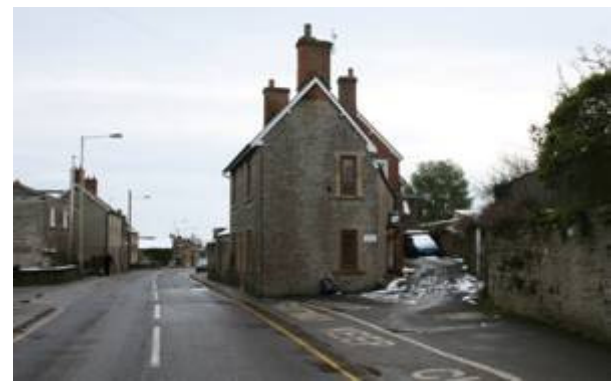
Figure 22: The Ring, Ring Street.