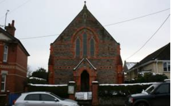
Figure 18: The Independent Chapel, Station Road.