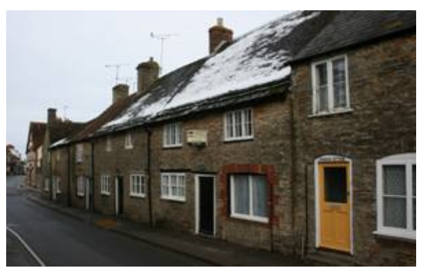
Figure 24: Eighteenth century cottages, Ring Street.

15. Station Road Industrial Area. The opening of Stalbridge Railway Station in 1863 led to the establishment of a new industrial area to the east of the town in the clay vale. This process began with the construction of a gas works in the late 19<sup>th</sup> century (Figure 27). The town also began to spread eastwards along Station Road towards the station.