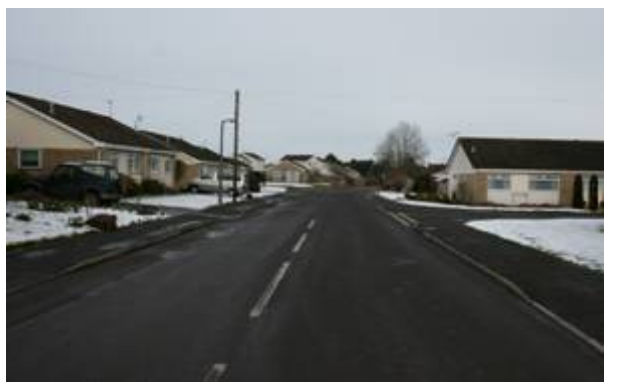
Figure 29: View of Jarvis Way bungalows.