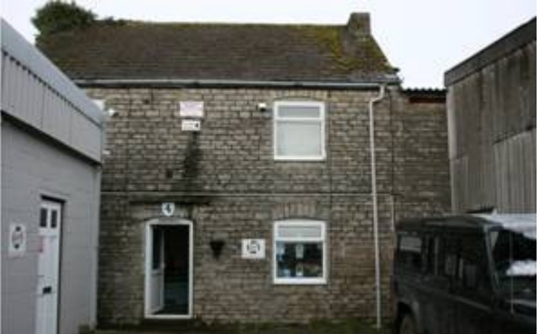
Figure 27: The old Gas Works, Station Road.