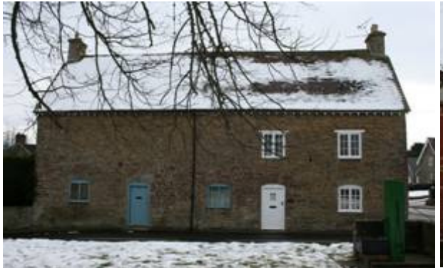
Figure 17: Ringtree House; the old Workhouse.

A charity school was established in Stalbridge in 1708. The Old Schoolhouse at the junction of Church Hill and Drew's Lane was built in 1832 (Figure 19), although the school had moved to its present site on Duck Lane by the late 19<sup>th</sup> century.