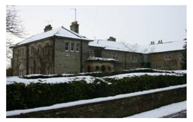
Figure 25: Grove House, Park Grove.