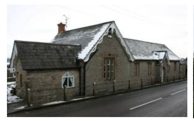
Figure 19: The Old Schoolhouse, Church Hill.

7. Drew's Lane. The south frontage of Drew's Lane was fully developed with cottages by 1782.