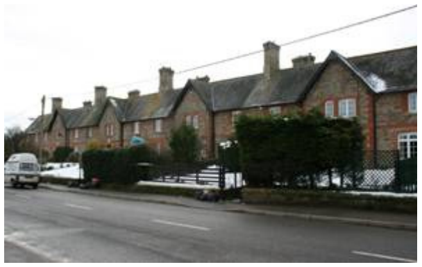
Figure 26: View of Westminster Buildings, Thornhill Road