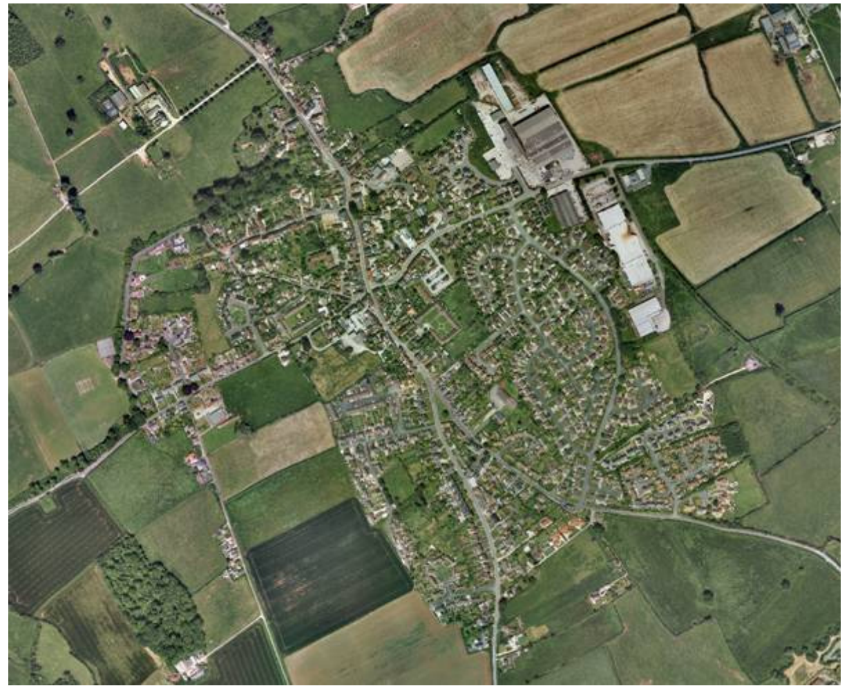
Figure 1: Vertical aerial photographic view of Stalbridge, 2005 (© Getmapping.com, 2005).

within the town. During the late 20<sup>th</sup> century the town expanded eastwards into the fringes of the clay vale itself.