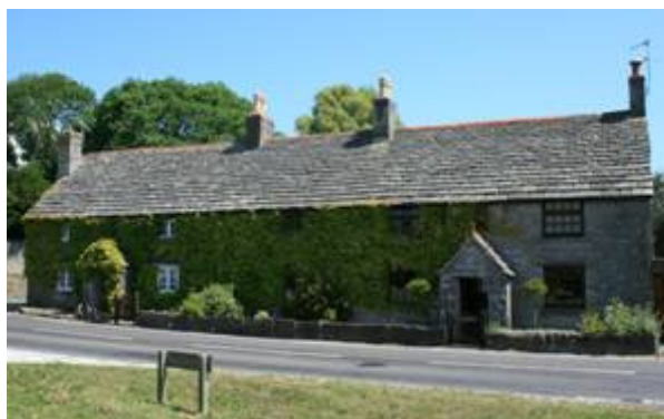
Figure 25: Town's End Farm, 127 East Street.

15. East Street Cemetery . This cemetery was established by 1844 but was extended by the late 19 th century. It appears to have been consecrated as a replacement to the churchyard.