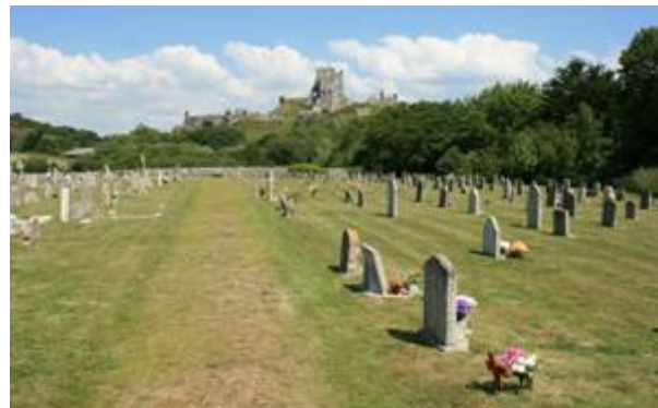
Figure 31: Modern View of Corfe Castle Cemetery, behind West Street.