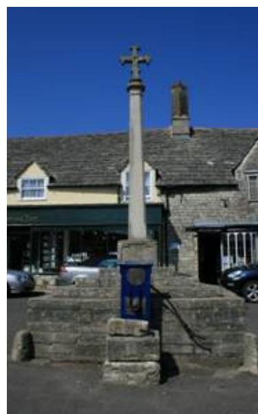
Figure 26: View of the Market Cross and Village Pump, The Square.