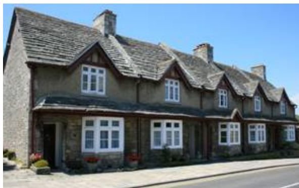
Figure 23: 20-28 East Street..

5. Central Historic Plots . A terrace of houses was constructed on the west side of East Street (numbers 20-28) immediately south of the churchyard during the early 20 th century (Figure 23).