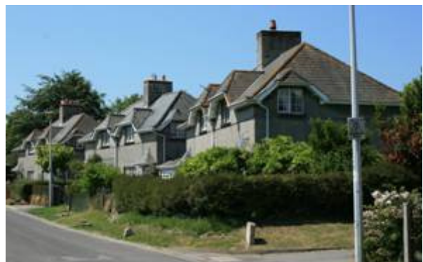
Figure 32: Inter-war semi-detached houses, 70-80 West Street

medieval field boundaries and significant Mesolithic activity.