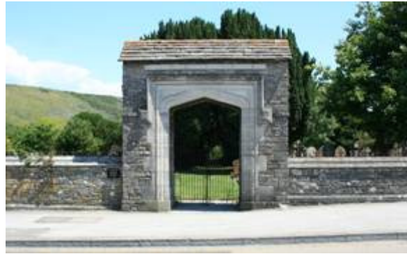
Figure 30: Arched entrance to East Street Cemetery, designed by Fra Newbery, erected 1922.

16. Tom's Mead Cemetery (Figure 31) . This third cemetery in the town was added in the early 20 th century at the rear of the West Street burgages. It was extended to the west during 1996-7. The construction of a car park south of the cemetery during 2005 revealed evidence for