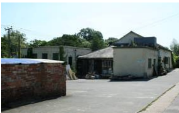
Figure 27: View of Sandy Hill Workshops – the former milk factory.

Ralph Bankes left the Corfe Castle estate to the National Trust in 1981. This included the castle, the commons and various properties in the town. Other former public and commercial buildings have been converted to tourist attractions; the Old Town Hall is now a museum and the National Trust Tea Rooms occupy a former