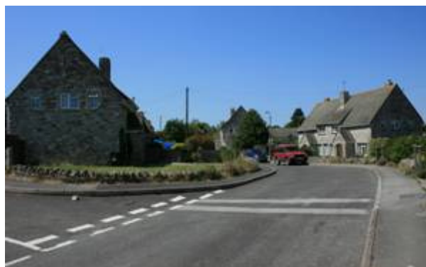
Figure 28: View of Halves Cottages, later 20th century suburban houses at Town's End

The main plan components of the twentieth century town are shown on Figure 29 and are listed below.