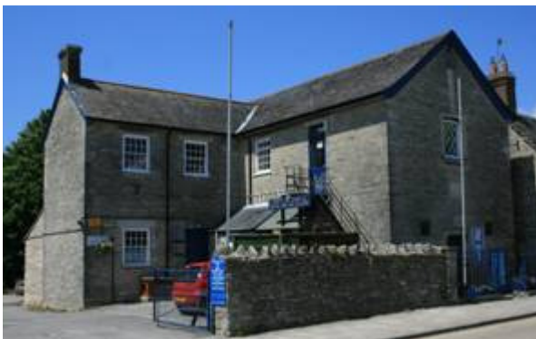
Figure 20: Former National School, now Royal British Legion Hall, East Street.

Corfe Castle had both a British School and a National School for boys and girls in the early 19 th century. The British School was founded in about 1829 and moved into the former Independent chapel in West Street in 1834. The National School was built on the west side of East Street in 1834 (Figure 20). A south wing