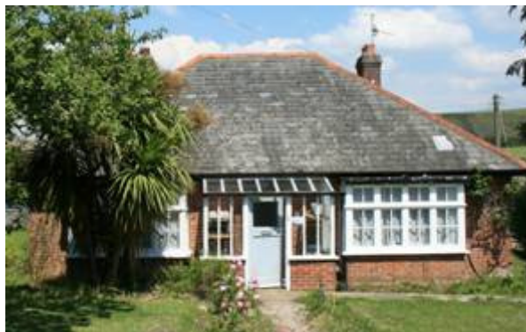
Figure 33: Inter-war bungalow at 3 Jubilee Gardens .

19. Sandy Hill Workshops . These buildings originated as a Milk Factory adjacent to the railway but were closed at a similar time. It is now occupied by craft workshops and galleries.