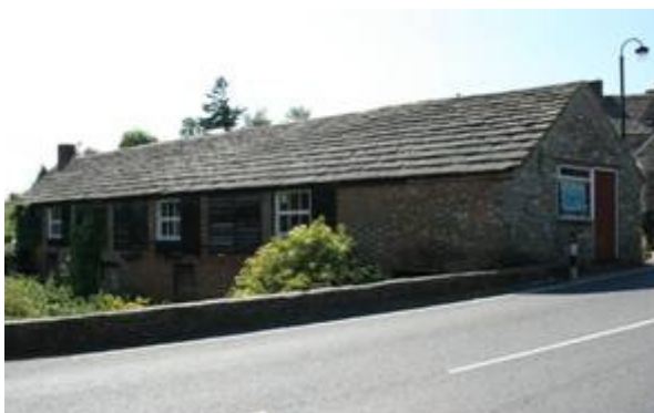
Figure 22: Site of the Former Tannery, Byle Bridge, East Street..

The late 19 th century town layout is depicted on the 1 st edition 25-inch Ordnance Survey maps. These indicate very little change over the period from the Tithe Map in 1844. Essentially the late medieval town plan remained stable into the early twentieth century. Nevertheless, there are a few changes worth noting. The changes to the roads in the late 18 th century has been mentioned above. The most significant change in the layout in the 19 th and early 20 th century was the creation of the Swanage Branch Railway in 1885. This led to the severe truncation of burgage plots on the east side of East Street and the creation of a new access road and station (Figure 24). Other small changes include the construction of schools and a cemetery on East Street. This period also saw the beginnings of suburban housing along East and West Streets.