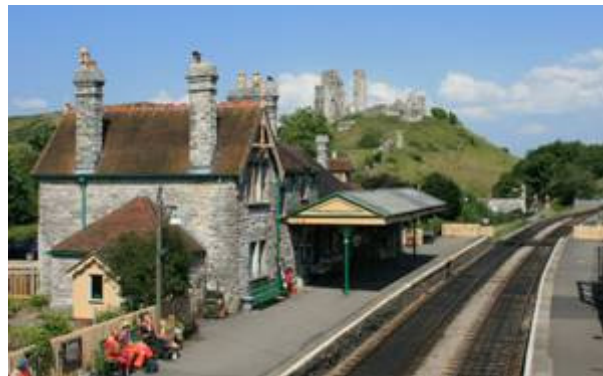
Figure 21: View of Corfe Castle Station looking north.