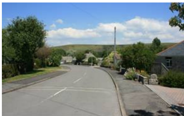
Figure 34: Modern suburban housing, Battlemead.