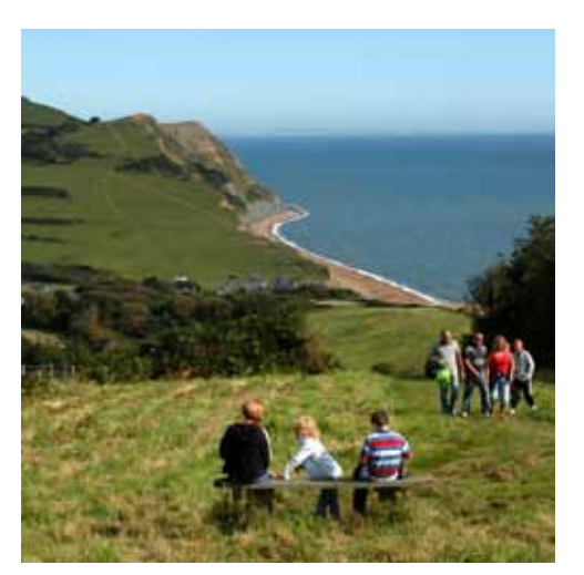
Dorset Area of Outstanding Natural Beauty.