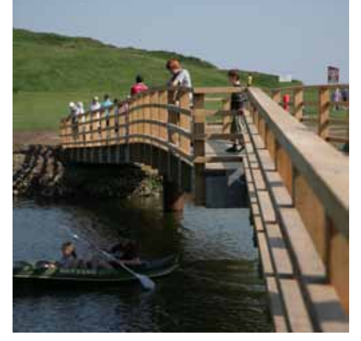
Charmouth Bridge Artists Sans Facon.