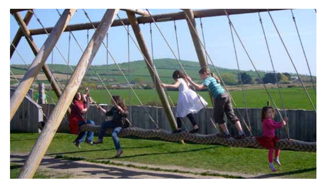
Playground at West Bay, design influenced by artist Peter Margum.

Dorset Councils and partners collaborated to create a single play strategy for Dorset. The Dorset Play Partnership was able to use this focal point to identify priorities and work towards common goals in raising the standards and opportunities for children to play. The Playbuilder programme was one such example. Over £1million was secured to deliver 22 fantastic new or redeveloped play areas across Dorset. Great examples include the beach themed play area at West Bay, the skate park at Crossways, and the water play park at Christchurch Quay. More information <u>here</u>.