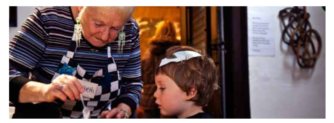
Museum volunteer at Priests House Museum Wimborne.

In summer 2014 73 teenagers participated as Dorset Library Service Summer Reading Challenge (SRC) volunteers. They helped to sign children up to the reading challenge, talked to the children about their books and assisted with events and displays. Building on this achievement, we have been allocated some funding from the Cabinet Office, Accelerate Scaling Fund (administered by the Reading Agency) to increase the number of SRC volunteers and to launch yearround volunteering opportunities. Young people can now apply online for the additional volunteer roles: Consultation, Activity and Events, Digital Champion and Recruitment. They will be accredited or supported if already working towards an award. More information here.