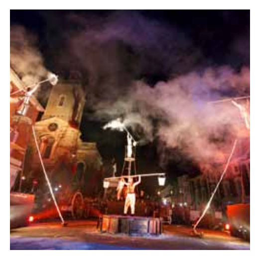
The Bell in Blandford Forum by Periplum (Inside Out Dorset 2014 – Activate).