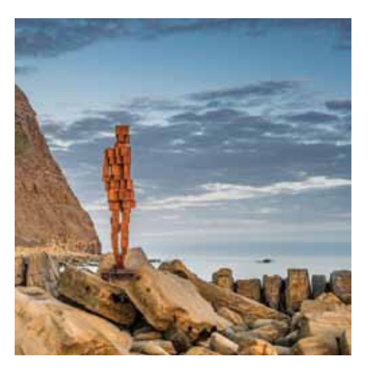
Artsreach work in partnership with Landmark Trust for the Gormley commission at Kimmeridge.

b-side has developed its reputation as an international festival of standing and has concentrated on developing projects in and around Weymouth and Portland – most recently collaborating with Artangel in a project which gained national recognition.