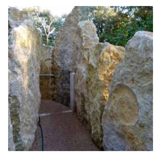
Serpentine Path, Durlston Castle.

New collaborations have improved public spaces including in Chickerell, Newtons Cove, Durlston Castle. When the footbridge was replaced at Charmouth engineers teamed up with artists Sansfacon who lead on design creating a replacement bridge which won the Institute of Civil Engineers small project award in 2011. "A great asset for Charmouth, very honoured that it was able to happen" - Charmouth Parish Council. Details of other collaborative public art projects <u>here</u>.