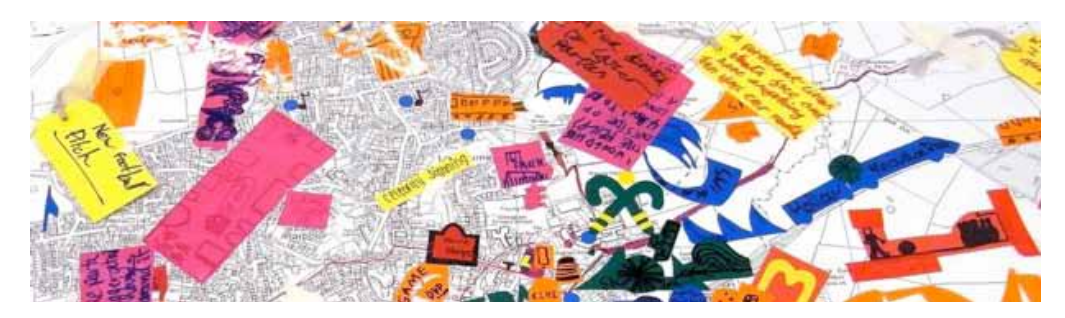
Creativity in Community-Led Planning Toolkit.

The N3 projects improved public places for community benefit and demonstrated the value of cross-sector collaborations. One project has now turned into a community enterprise, providing homes for wild life such as birds and bats, thus conserving and increasing the amount of wild life on the housing estate and bringing in an income. Another project produced guidance advising community and neighbourhood planning groups on how to engage with culture and use the skills of creative practitioners within the planning process: <u>Creativity in</u> <u>Community Led Planning in Dorset</u>.