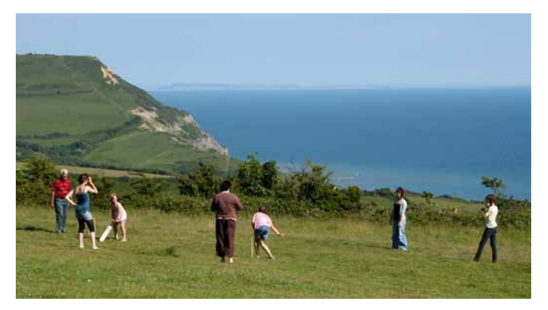
Stonebarrow Down.

Festivals and events have been established in Dorset over the years to promote physical activity and play to thousands of Dorset residents. Disabled adults enjoy A Sporting Chance held at Bryanston School offering many sports and cultural activities. Weymouth Beach hosts the beach festivals annually offering special days for disabled children and disabled adults and a free open weekend for the whole family as a legacy of the 2012 Games. The real highlight is the water sports paddle-boarding, kayaking and sailing. Play day activities to celebrate the national Play Day also offer fun festivals for the younger generation.