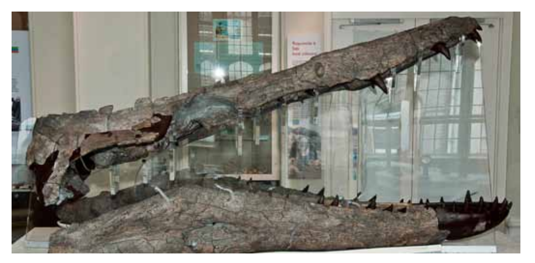
The Weymouth Bay Pliosaur in the Jurassic Coast Gallery at Dorset County Museum (Courtesy DNHAS).

Recent research has demonstrated that heritage and museums have a vital role to play in developing an attractive tourism offer which enhances the local economy. West Dorset museums (Dorset County Museum DCM, Bridport, Sherborne and Lyme Regis) have worked together to assess the economic value of their visitor base. Using the Association for Independent Museums (AIM) toolkit; a professional system which enables museums to adopt a robust approach to estimating economic value using locally collected visitor data and nationally sourced tourism information, it has been assessed that the four museums supported by WDDC generated a total gross visitor impact of just under £3 million in the local economy over the last 12 month period. Landmark exhibitions such as the Pliosaur at the County Museum and War Horse at the Tank Museum in Bovington have generated national publicity and profile; and focused high quality improvements in museums such as Gold Hill in Shaftesbury and Swanage Museum have seen these two entirely voluntary run museums attract nearly 90,000 visitors per year between them.