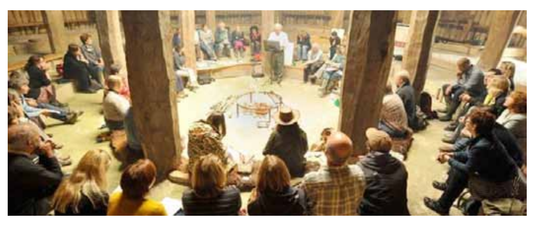
Dorset arts organisations on a Learning Day at the Ancient Technology Centre.

Leadership programme provided action learning sets and mentoring for over 40 participants drawn from across the cultural sector and generated many opportunities for developing collaborative projects as well as increasing cross sector understanding. One participant from library staff commented "I had never previously understood what arts development was about but now I get it" .