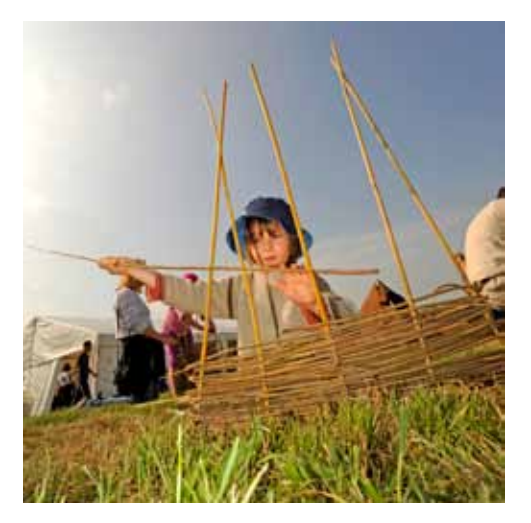
South Dorset Ridgeway.

DCC's <u>Children's Nature Nurseries</u> at Avon Heath and Durlston have been established with a vision of connecting children with nature during their early years education and development. Located on AONB sites and making the most of outdoor green spaces. The learning objectives are pursued by giving time and space to the child, with professionals allowing skill-based experiences to flourish, assisted by quality observation. Children's Nature Nurseries are the complete learning experience for children.