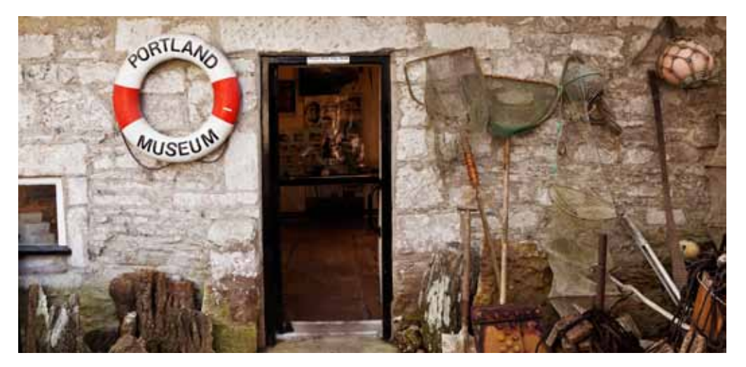
Portland Museum, part of the Jurassic Coast Museums Partnership.

The Jurassic Coast Museums Partnership secured an £180,000 grant to deliver new displays, digital content and shared events programming; the North Dorset Museums Partnership has undertaken joint marketing and publicity; the Dorset Museums Association has delivered over 10 training and networking sessions for 25 museums and the Wessex5 partnership (DCM, Poole, Russell Cotes, Salisbury, Devizes), have secured nearly £0.5m Arts Council Resilience funding for capital fundraising and tourism development work and the South West Museums Sustainability pilot has enabled Portland and Priests House Museums to undertake a self assessment and improvement process which will yield dividends in terms of HLF support.