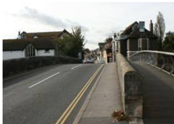
Figure 100: Bridge Street