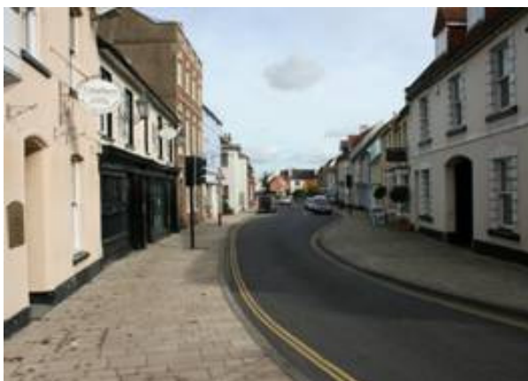
Figure 99: Bridge Street (Waterloo Bridge)