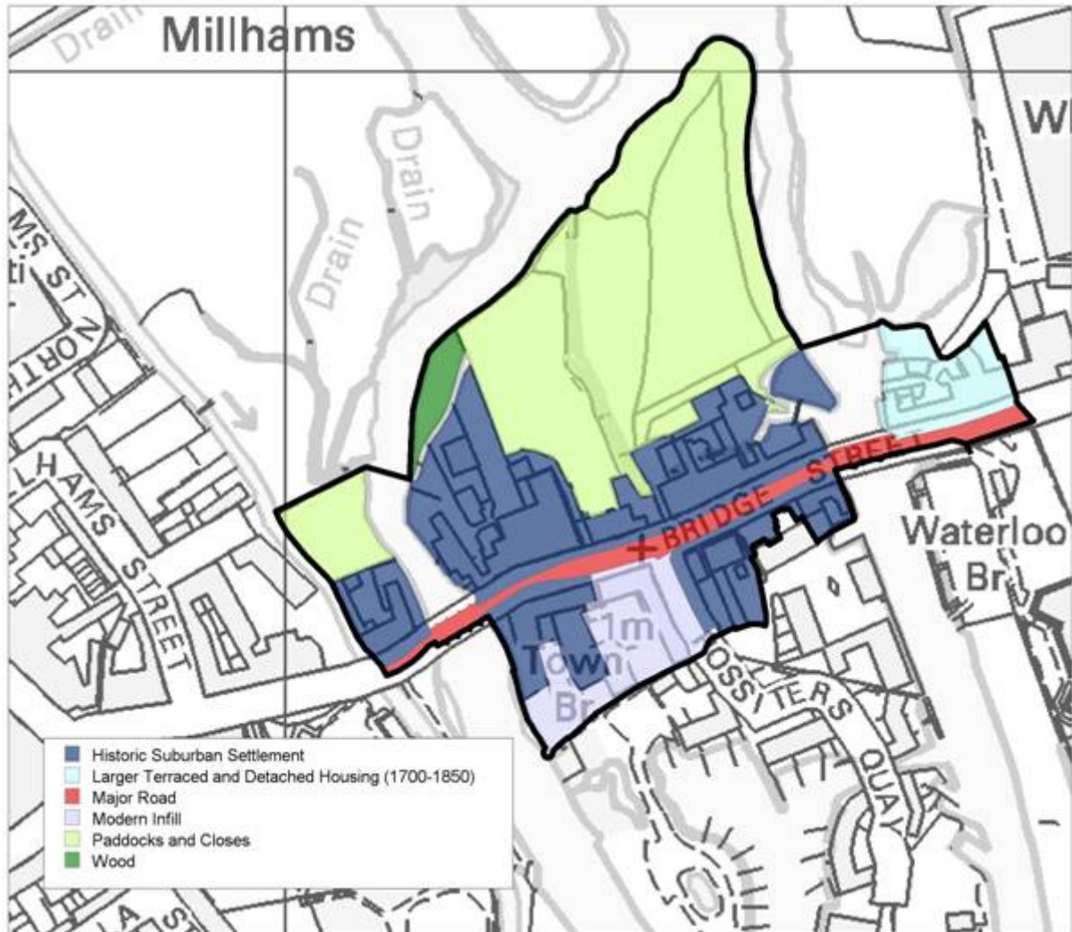
Figure 98: Map of Historic Urban Character Area 9, showing current historic urban character type.