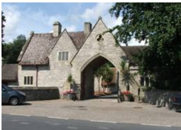
Figure 76: Jumpers cemetery lodge