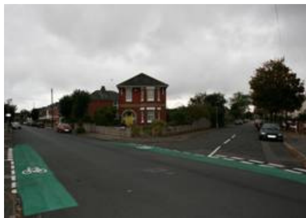
Figure 77: Avenue Road and Avon Road West