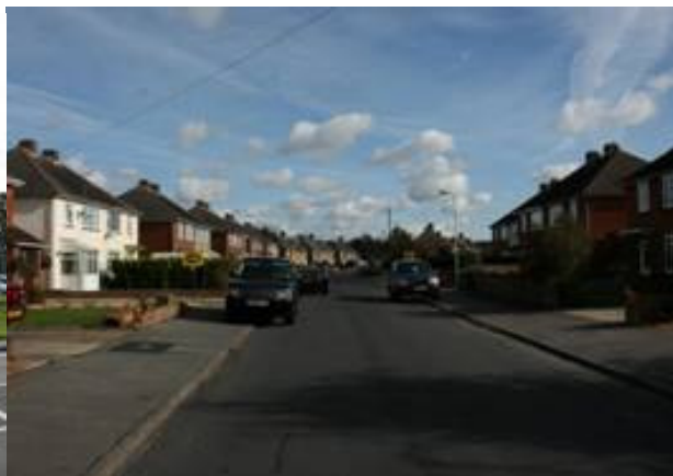
Figure 140: Edward Road