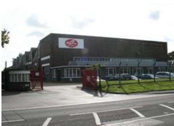
Figure 139 Former de Havilland factory